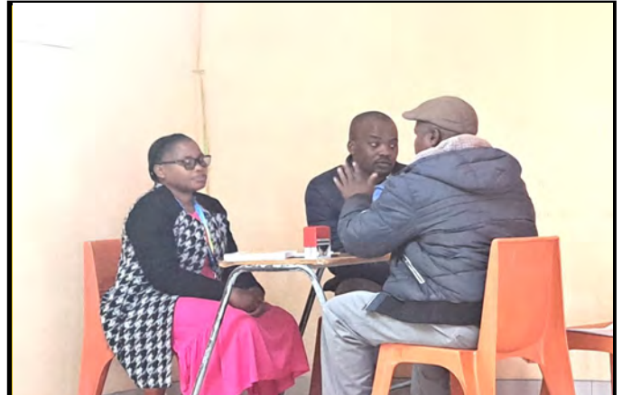
SASSA officials assisting the client.