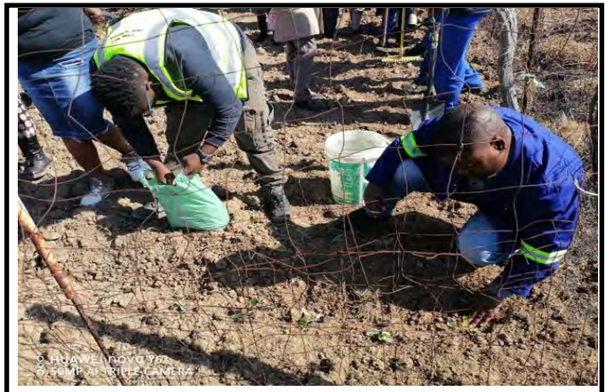
Uniting for a common purpose