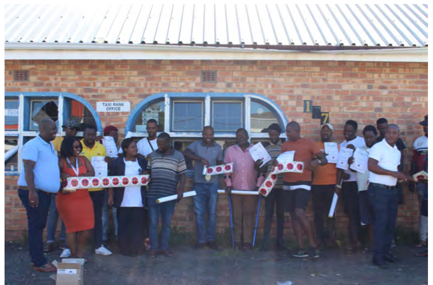
Taxi Driver's appreciating their participation certificates

Together, we can combat TB and create a healthier community. Stay informed, are tested and support those affected.