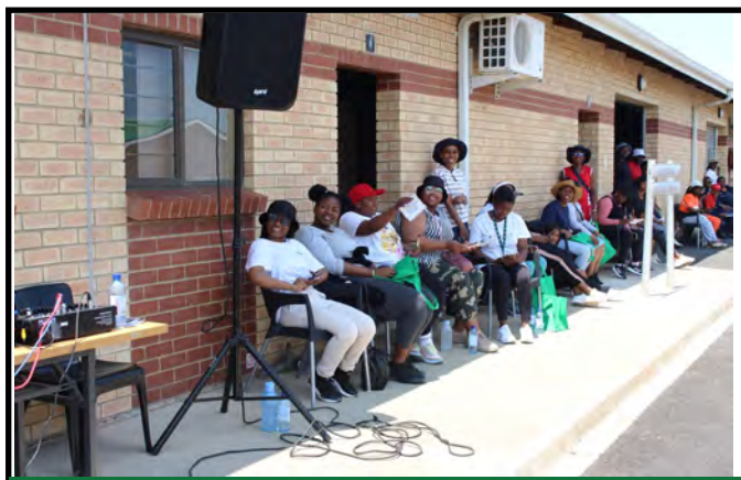
Empowering healthy habits and celebrating our wellness champions!