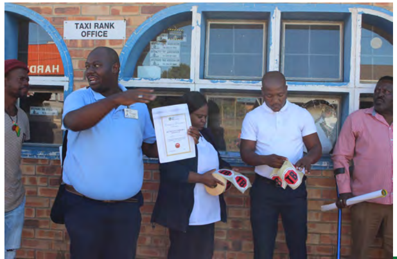
A world free of TB is possible! Lets work together to make it a reality

However, TB does not discriminate, it affect people from all lifestyles. Early detection, treatment and prevention are key to overcoming this challenge.