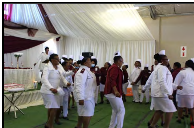
The art of nursing: where science meets the heart