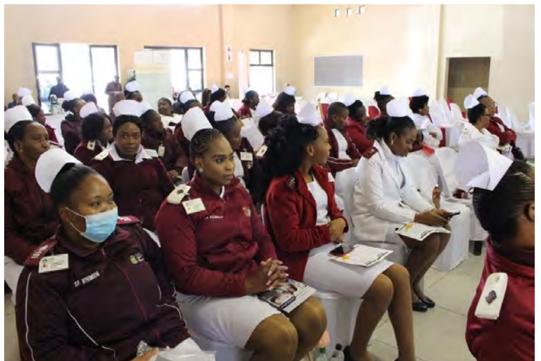
Florence Nightingale of today - our loved Nurses

a part of a family. We support each other and strive for excellence.”