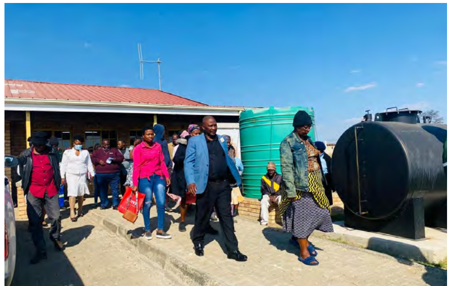
Community exploring their clinic