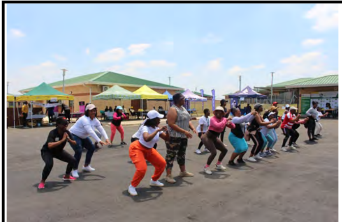
Sweat , smile, repeat exercise is a great way to reduce stress and boost mood.