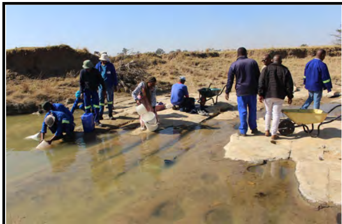
Fetching water to water the garden