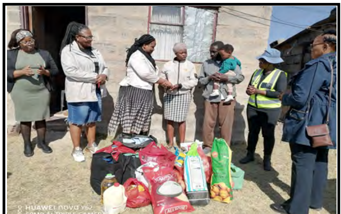
Making a difference one small act at a time