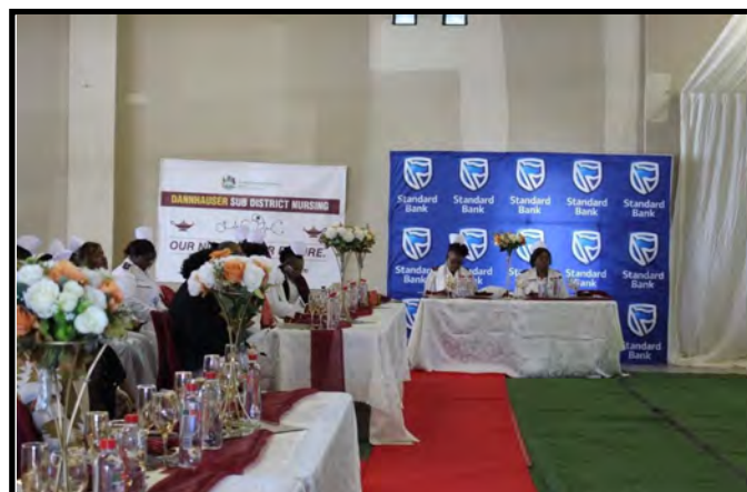
Celebrating the nursing profession