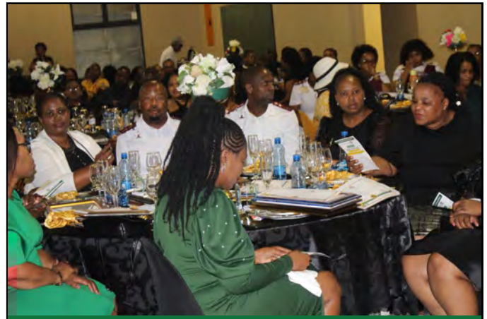
Our Operational Nursing Managers