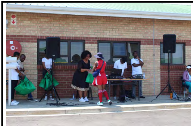
Healthy habits for a healthy life!