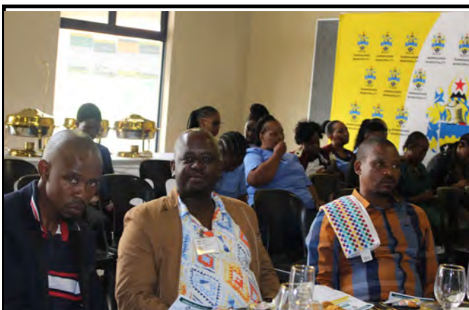
The Maintenance Team