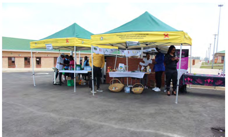
Screening & Nutrition stations