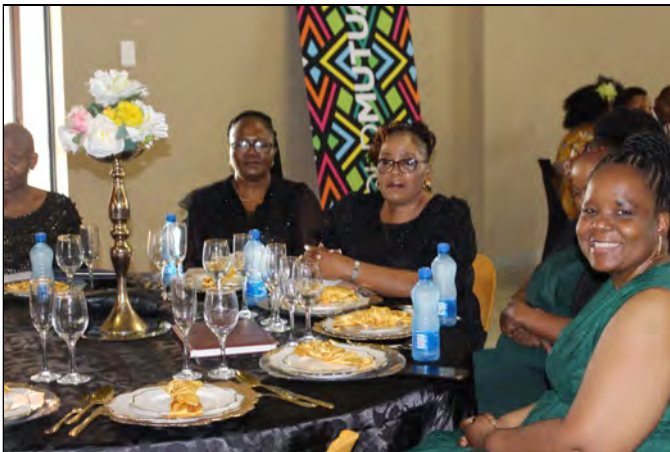
The Executive Committee