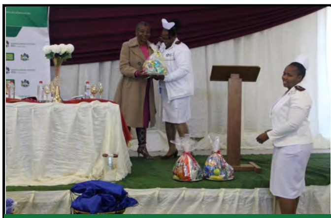
Appreciation gifts hand over