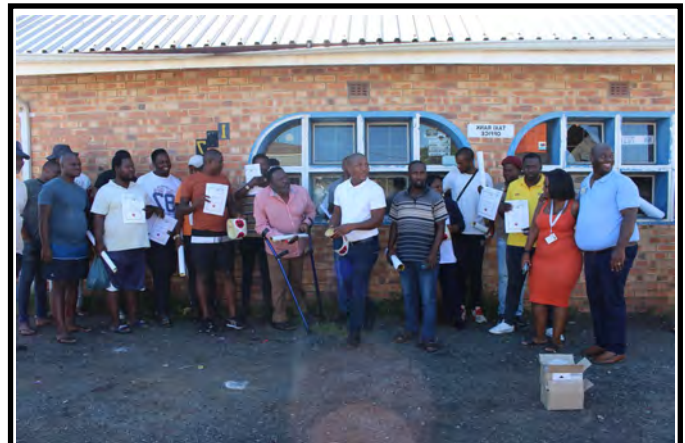
Every breath counts in the fight against TB