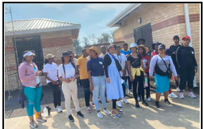
Healthy lifestyle is the best