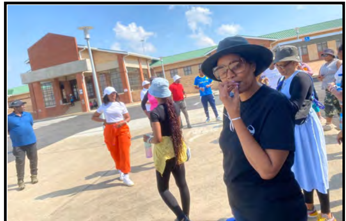
Mindful moments for healthier life the