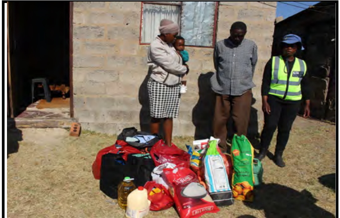
Giving back to the community