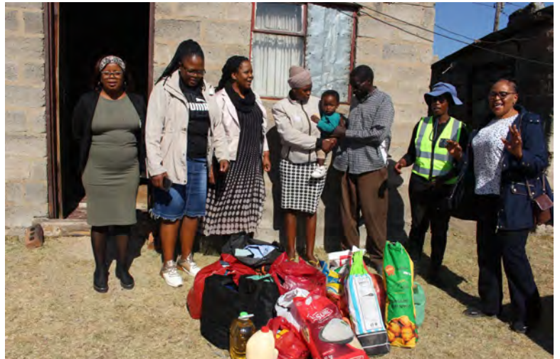
Handover of groceries & clothes