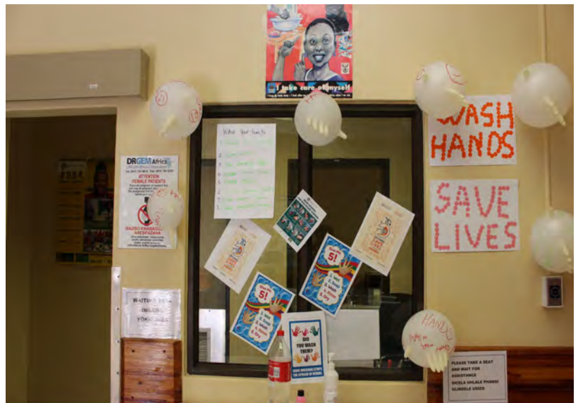
Rehab Hand Hygiene display

The march continued to the CHC wards and all units and each unit had to participate in the hand hygiene puzzle. Two sections received certificates of recognition and trophies. The Pharmacy section had