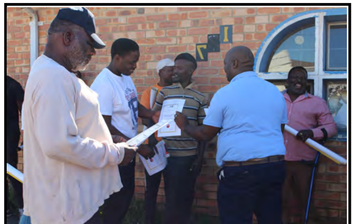
Taxi Drivers joining the campaign against TB