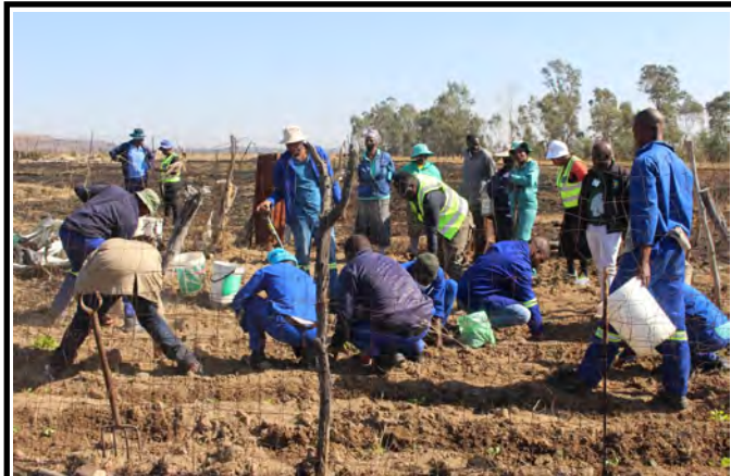
Serving with love and compassion