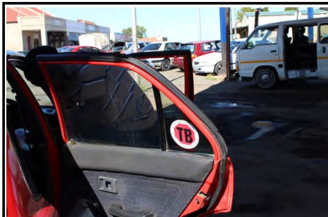
TB does not discriminate, but together we can make a difference