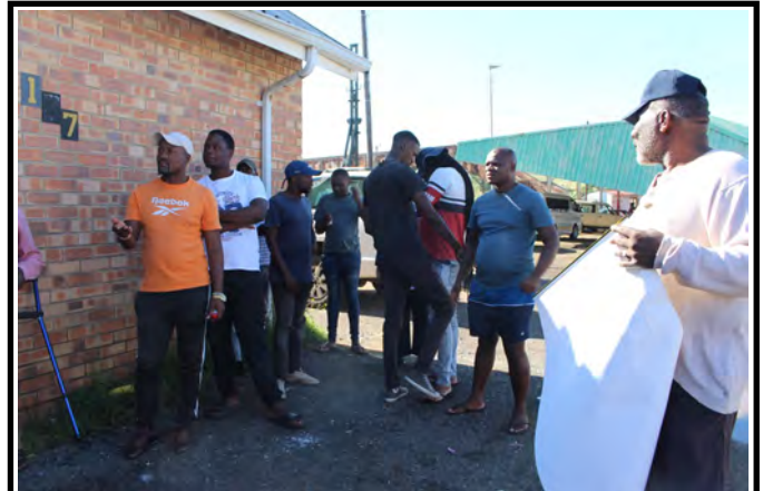
Breaking the stigma: let us talk openly