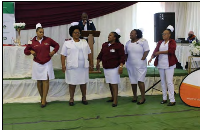
Our Nurses the Heart beat of Healthcare Sector