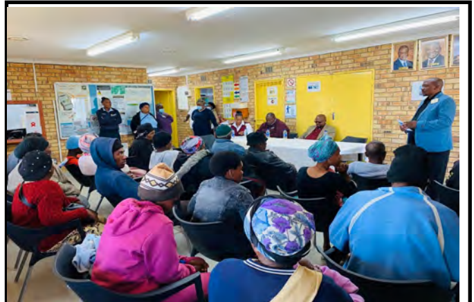
Building connections & fostering community spirit