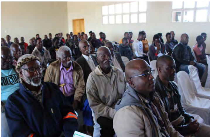
Amadoda elalele izinkulumo eziwakhayo.