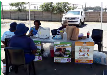
OUTREACH PROGRAMMES READ MORE ON PAGE 4