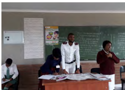
TEENAGE PREGNANCY READ MORE ON PAGE 3