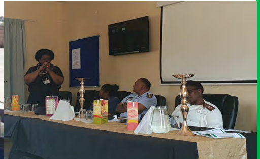
GENDERBASE VIOLENCE PRAYER READ MORE ON PAGE 8