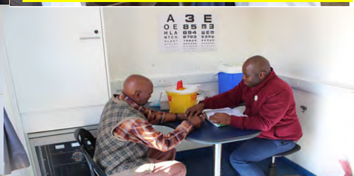
uEN Ngwenya enza adumengazo, kuwona umcimbi njengoba kwakutholakala usizo olunhlobo.