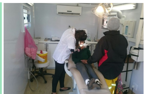
DENTAL SERVICES AT SCHOOLS READ MORE ON PAGE 5