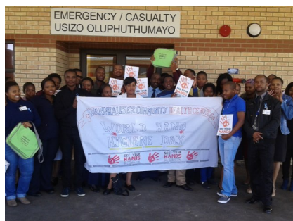
WORLD HAND HYGIENE DAY READ MORE ON PAGE 4