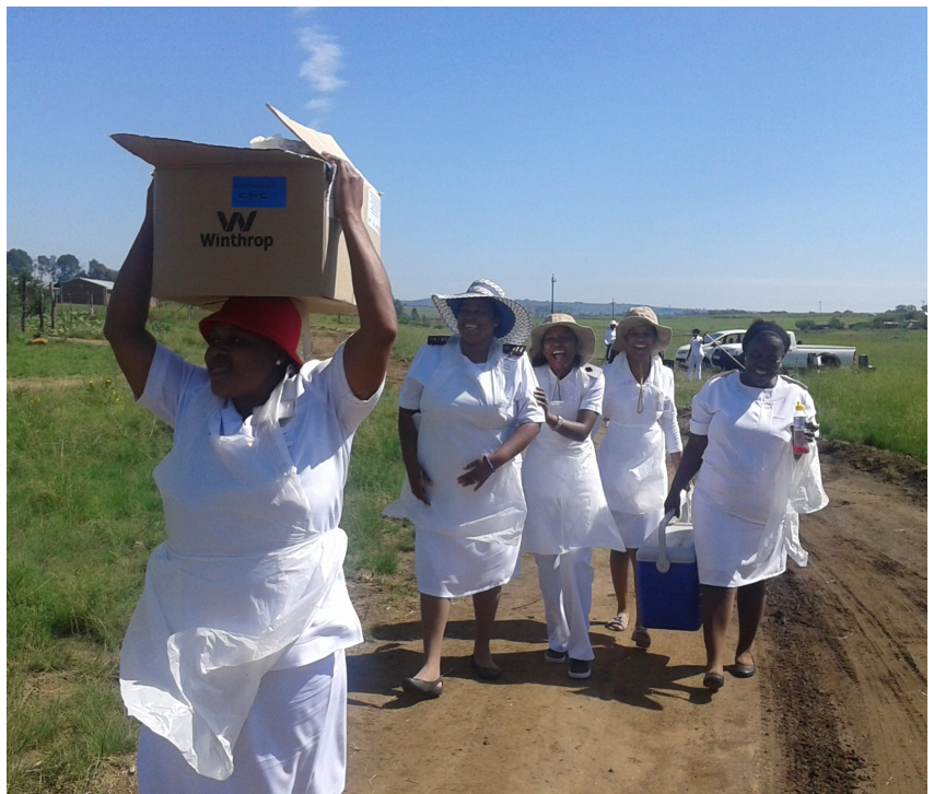
Nurses moving from house to house in Hattang-spruit offering services at the comfort of clients homes.

Tuberculosis (TB) is a global disease, found in every country in the world. It is the leading infectious cause of death worldwide. The World Health Organization estimates that two billion people—one third of the world's population—are infected with Mycobacterium tuberculosis (M.tb), the bacteria that causes TB. Each year, 9.6 million fall ill from TB and 1.5 million die. TB is an airborne disease that can be spread by coughing or sneezing and is the leading cause of infectious disease worldwide. It is responsible for economic devastation and the cycle of poverty and illness that entraps families, communities and even entire countries. Among the most vulnerable are woman , See page 2 for a full story