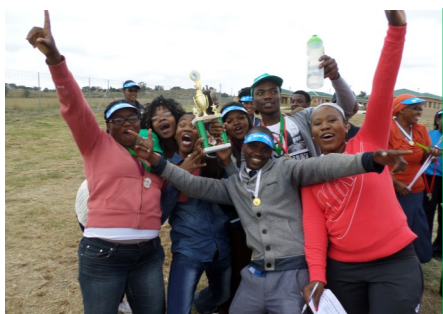
FUN DAY READ MORE ON PAGE 3