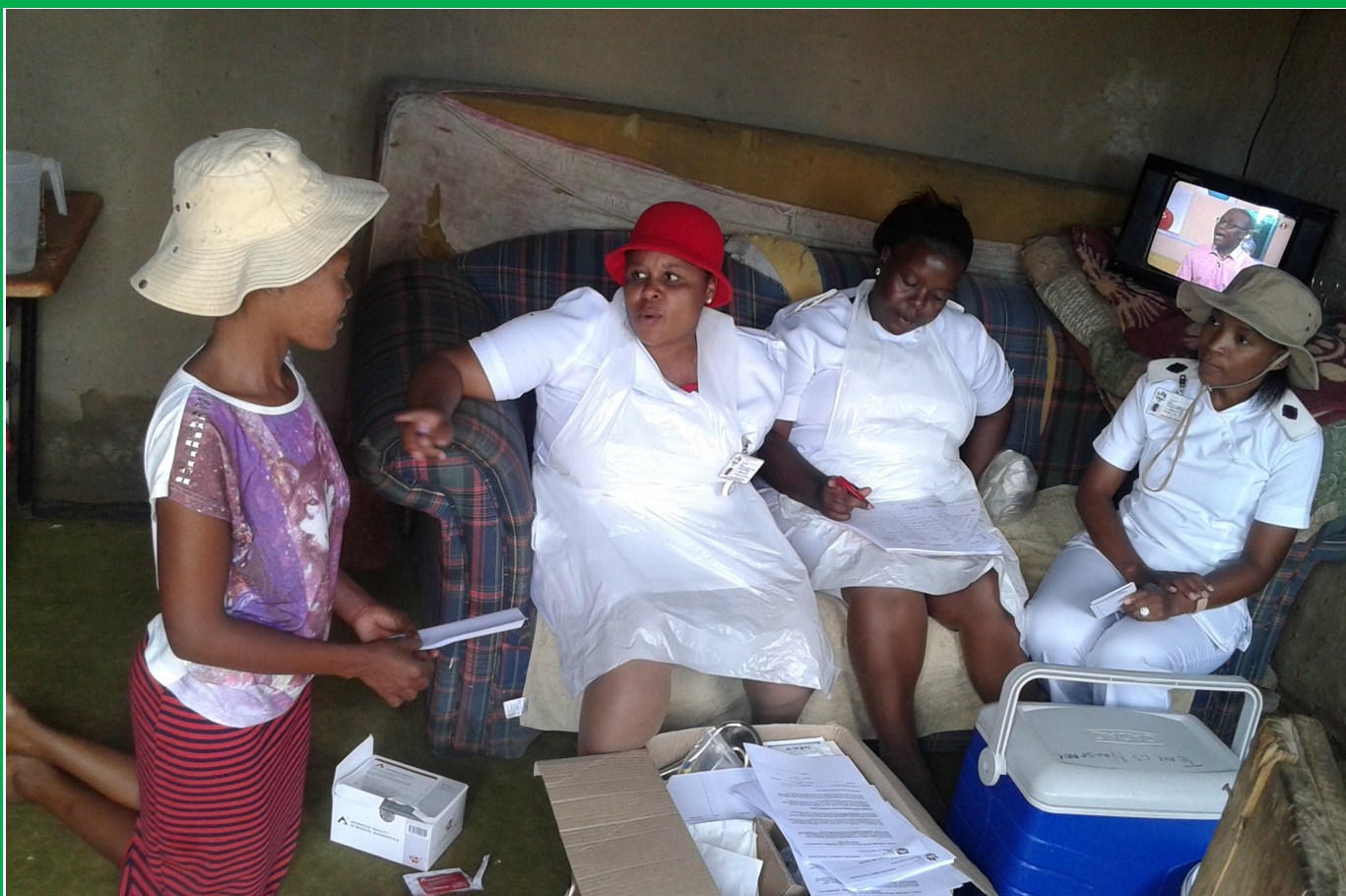
Nurses providing services to a young woman in the comfort of her home.

Children, and those with HIV/AIDS. There is growing resistance to available drugs which means the disease is becoming more deadly and difficult to treat. Dannhauser CHC took TB awareness to the community by doing a door to door campaign in Hattingspruit on the 1st of March and Koppie Allen on the 8th of March 2016. The theme of the campaign was “FIND TB. TREAT TB. WORKING TOGETHER TO ELIMINATE TB” . A total number of 88 people were screened for TB and HIV on both the days, MMC was also promoted to young boys and man in the areas. Management would like to all staff members who were part of the outreach. Masiqhubeke nokulwa nezifo, nokulwa nobubha, nokunika ithimba.