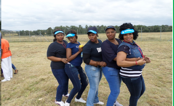
Pictures below and above show different activities of the day as staff members gave their all to win.