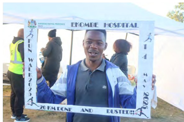
20 km Fun Walk Page 4