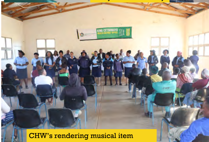
CHW's rendering musical item