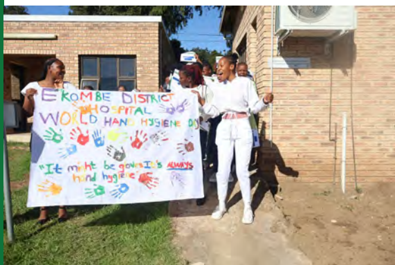
Hand washing day Page 2