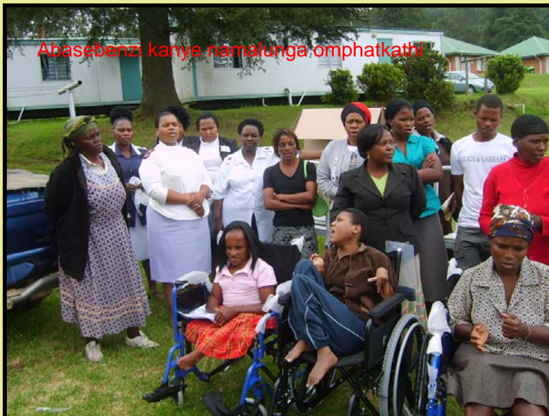
Abasebenzi kanye namalunga omphakathi