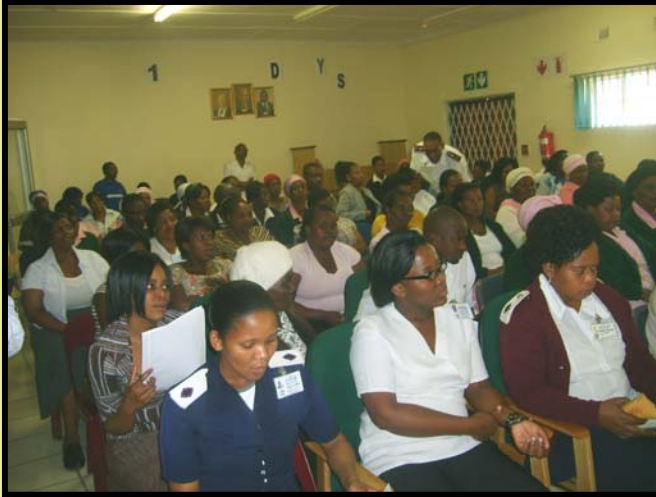
Abasebenzi belalele izwi leNkosi