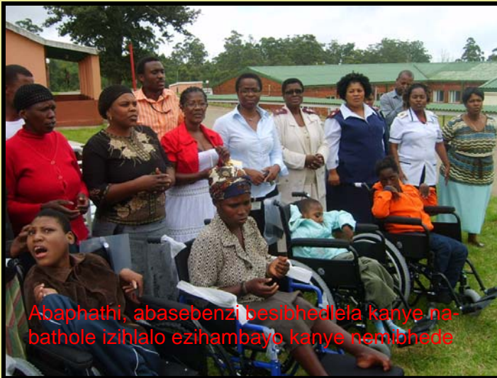
Abaphathi, abasebenzi besibhedlela kanye nabathole izihlalo ezihambayo kanye nemibhede

Sithanda ukubonga uSonhlalakahle kanye nabaphathi besibhedlela ngokuhlela lolusuku.