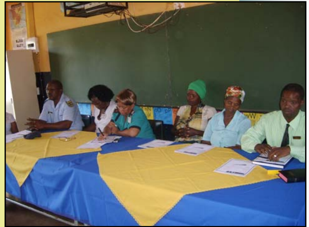
Dignitaries that were present

The Deputy Principal and SGB appreciated the work done by the parties concerned. We would like to thank all stakeholders who made this initiative to be a great success.