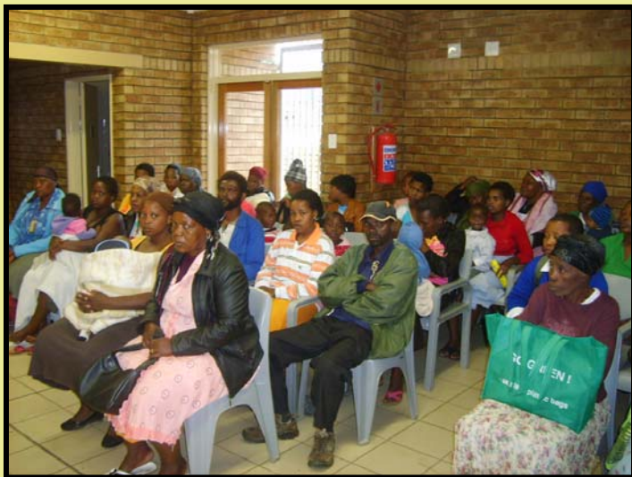
Members of the community listening attentively

Members of the community were also given an opportunity to ask questions about services and topics presented to them. Pamphlets, flyers, booklets and brochures were also distributed. Community members were delighted with such information which will make them to live a healthy life style. Well done to all the stakeholders who contributed to the success of this day.