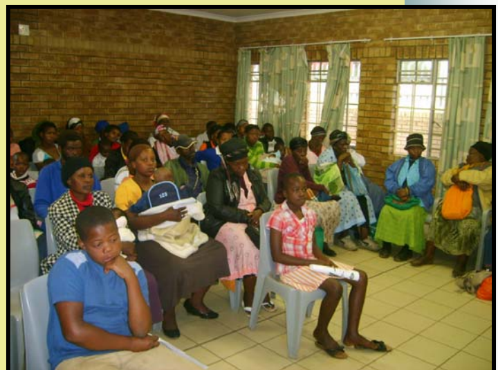
Members of the community listening attentively