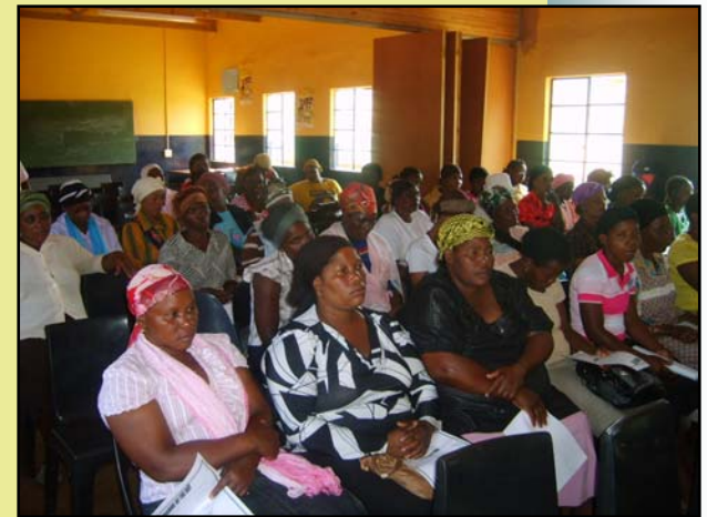
Parents listening attentively