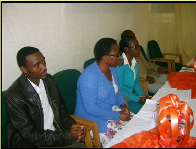
Abaphathi besibhedlela nabo belalele

Ikwaya lesibhedlela lasipha umculo omtoti. Ngingabashiya kanjani Abaphikeleli - ( Ekombe HCF) beholwa phambili uXabhashe, benza usuku lwabamnandi. Sithanda ukubonga uMdali ngokuthi lolusuku lube yimpumelelo. Siphinde sibonge abaphathi besibhedle ngombono walolusuku, abasebenzi ngokubamba iqhaza kanye naBaphikeleli ngokuphikelela. UNkulunkulu anibusise.