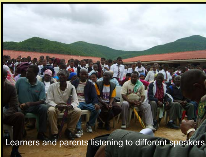
Learners and parents listening to different speakers