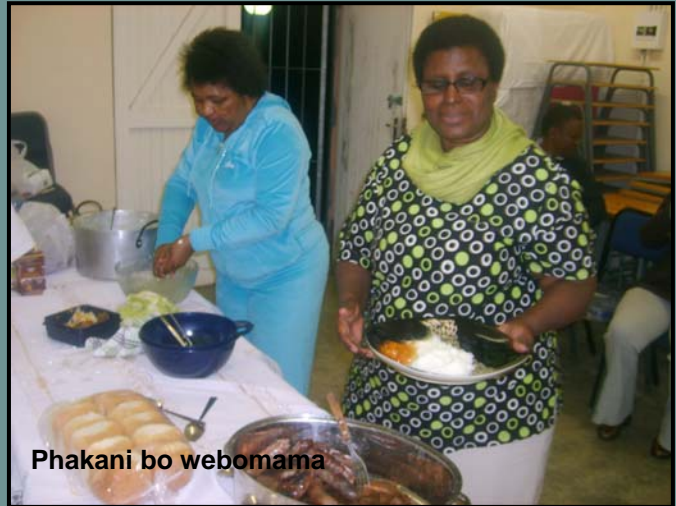
Phakani bo webomama