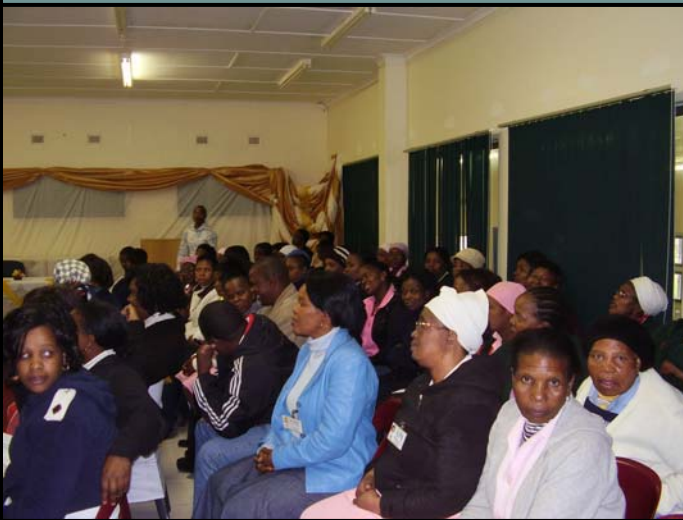
Izimenywa zilalele izikhulumi