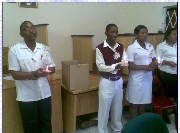
Abasebenzi bekhanyise amakhandlela