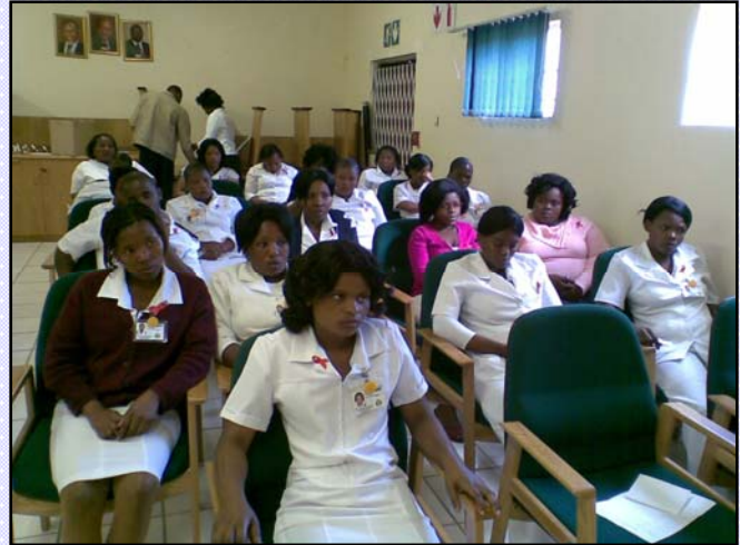
Abasebenzi bethamele izinkulamo ezinhlobonhlobo

Njengoba sazi ukuthi umhlaka 01 December usuku lwe-World AIDS Day, nathi njengeSibhedlela sase-Kombe salugubha lolusuku. Lapho khona esasikhumbula khona asebasishiye emhlabeni ngenxa ye-sifo sengculazi. Kwakukhanyiswe amakhandlela kufakwe ama-Ribbon abomvu. Kwafundiswa ngeHIV & AIDS, kwakuhanywa nezinkondlo.