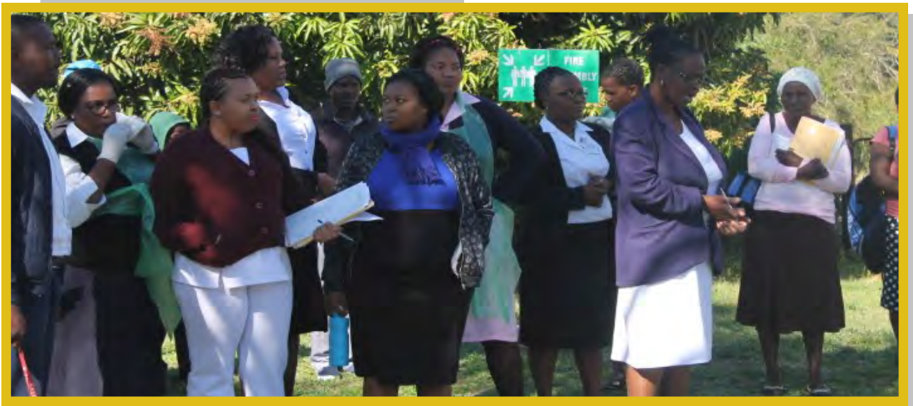
Staff from Nkwalini Clinic responding to fire alarm and gathered at the assembly area