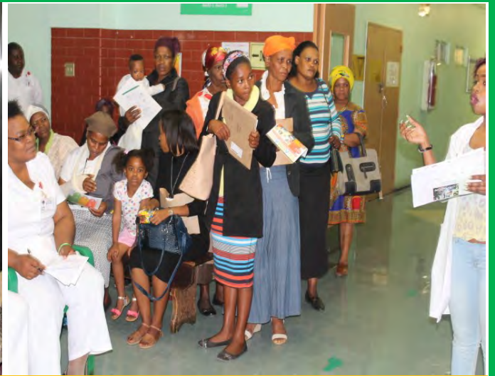
Left: Pharmacy team doing presentation to patients