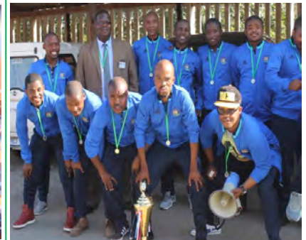
SPORTS NEWS READ MORE ON PAGE 09