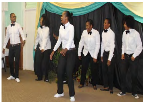
HERITAGE CELEBRATION READ MORE ON PAGE 03