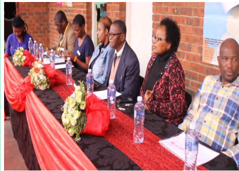
PHC CORNER READ MORE ON PAGE 06-08