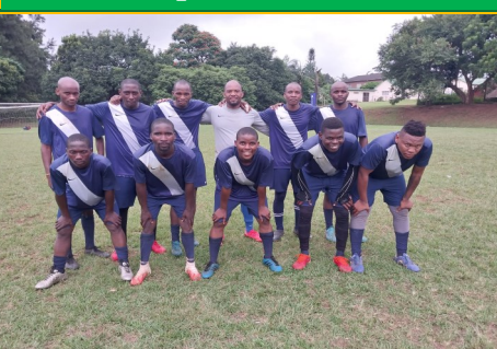
Mbongolwane Hospital got position two at Eshowe Hospital 2023 Healthy Life style games