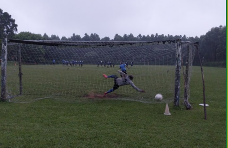
Eish labhajwa enethini