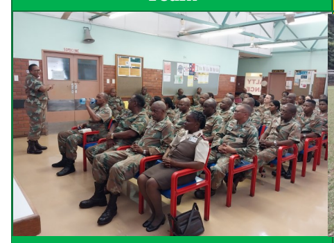
Did you know that military members do also pray before starting their day?