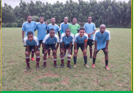
The Champions of Eshowe Hospital 2023 Healthy Lifestyle games were Ngwelezane Hospital