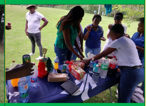
Inyama iyinyama ngokunyamalala, sekusele izinkwa zodwa