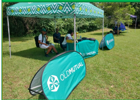
Old Mutual Financial Advising