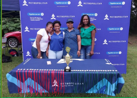
Medals and Trophy awaiting for the champions to be crowned