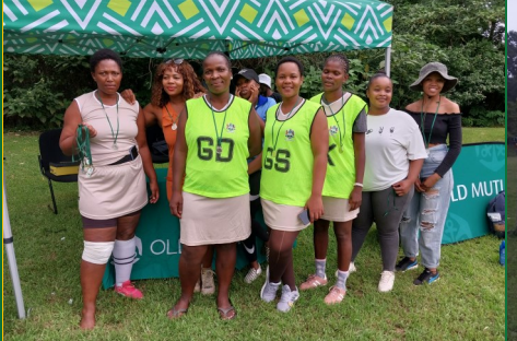
CBH Netball team got second position at Eshowe Hospital Health lifestyle games

We humbly request staff members to share with us any stories or photos of any activity they would like to be considered in our next publication.