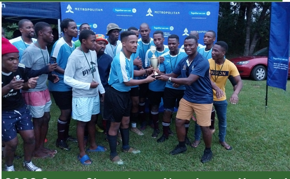
2023 Soccer Champions—Ngwelezane Hospital

Netball Champion was Eshowe Hospital leaving Catherine Booth on second position.