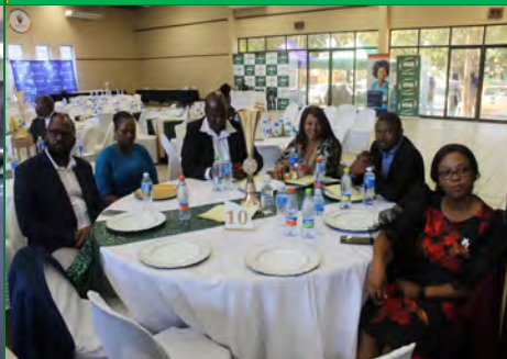
Uyahlonishwa uNo.10, even during DASEA Table Number 10 was for Eshowe Delegates.