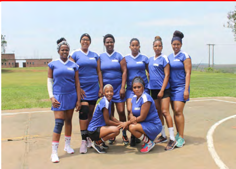
Eshowe District Hospital Netball team

Our teams are promising to be there on the knockouts, watch the space!