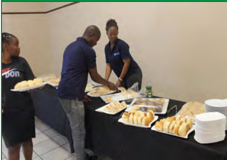
Khululekani Ningangimemi mina uma umcimbi ungenayo le Item KwiAgenda