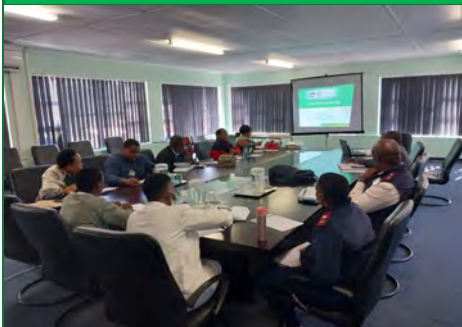
Engaging OSS-LTT Leadership on Community Health Workers Scope of practice.