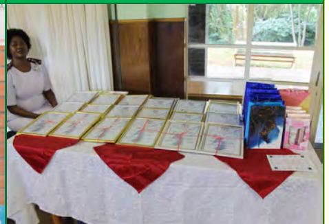
Akavele bakithi zisencane kabi izingane zami.