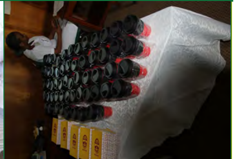
Nurses Day Tokens of appreciation from DENOSA