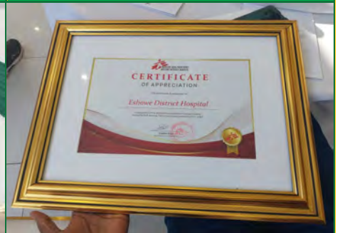
MSF has gone but will never be forgotten