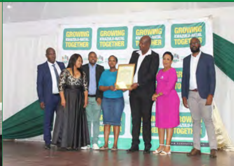
Kukhona Abazokhumbula Eshowe Ngokushesha, Nibuye bangani bami .