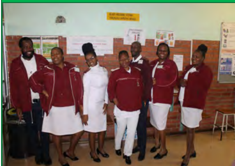
Nivumelekile ukugeza amehlo ngapha ngase MOPD