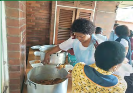
Lapho okuno MCWH khona Kuhlale kunamabhodwe

We humbly request staff members to share with us any stories or photos of any activity they would like to be considered in our next publication.