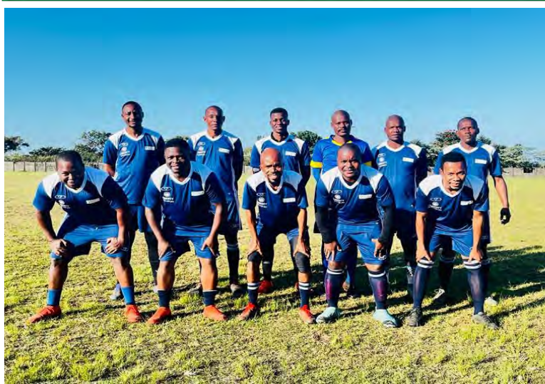
Eshowe District Hospital Soccer Team

Uma singakushayanga sisazokushaya! Kuyosinda owafayo ngoba owabaleka sisazomthola!