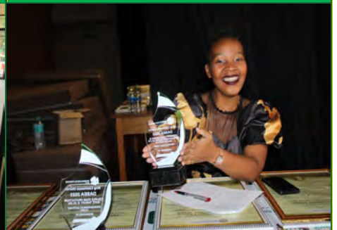
Futhi ake ngivele ngithule kungaze kuthiwe sengithena