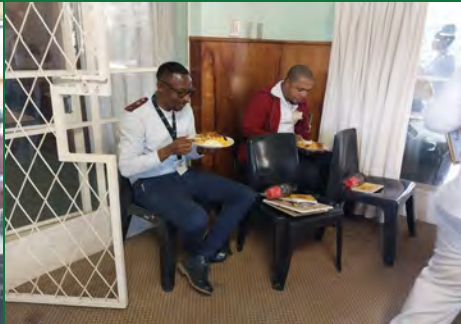
Ngisho ungabuza leziNsizwa, Ukudla kusekuningi kabi zisazoyophinda futhi.