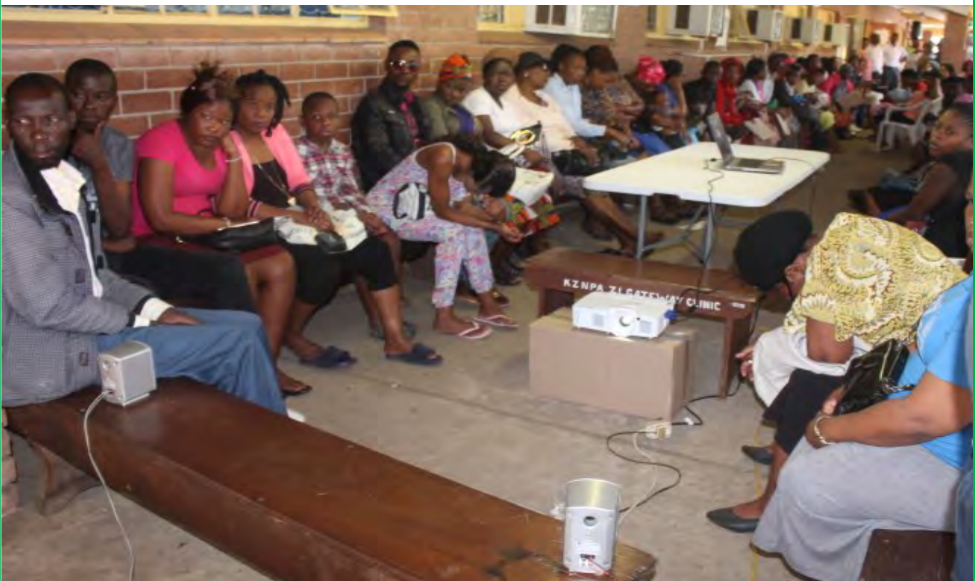
Clients from Gateway Clinic paying attention to a video clip on Rabies