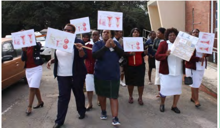
GOPD Team during the Cervical Cancer march at the hospital