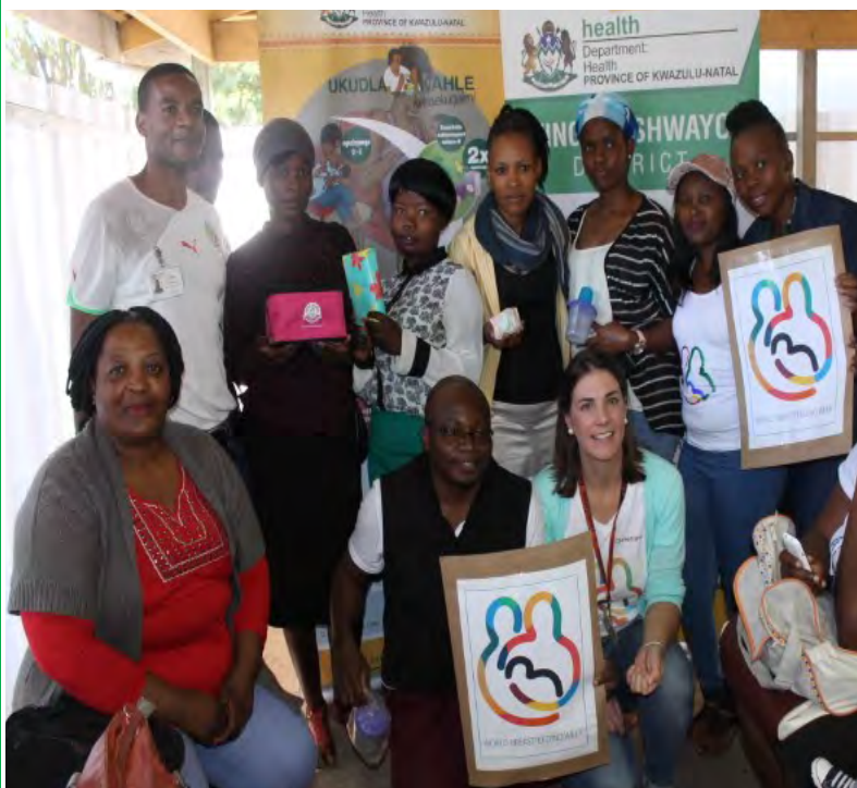
Dieticians with Nutritional Advisors and Mothers that won some gifts during the Breastfeeding Roadshow

Eshowe Hospital celebrated breastfeeding week through various events held within the hospital and surrounding clinics. Posters, pamphlets and information messages highlighting the theme, were distributed throughout the wards and departments. On the 1 st and 3 rd of August 2017, Awareness Talks were held in GOPD and Postnatal wards, with a question and answer session at the