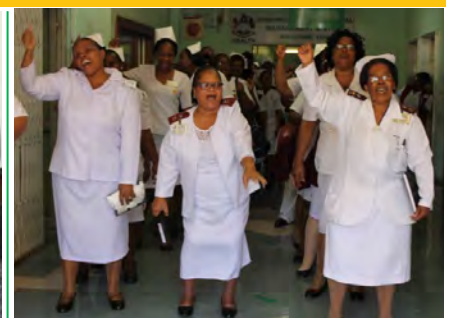
Nurses Day READ MORE ON PAGE 08