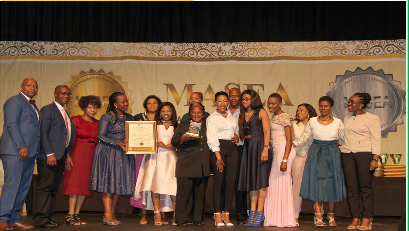
Hospital Staff with Hospital Board Chairperson and District Office celebrating victory during MASEA AWARDS in Durban