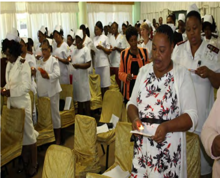
Staff that attend the Nurses Day Ceremony

If the hospital is dirty, nurses take the blame. Patients have faith in nurses in such a way that everything that occurs in the Department of Health is associated with the nurses. This is why it is crucial for the nurses to take lead towards bringing in service delivery.