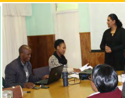
Batho Pele Training READ MORE ON PAGE 04