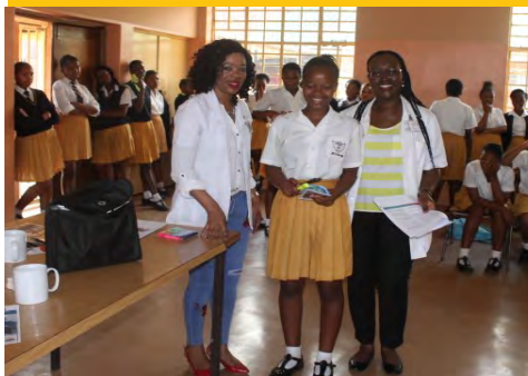
Pharmacy Month READ MORE ON PAGE 03

Praise must be given where due within the resource constrained environment, one needs to be mindful that it is not only the Department of Health that is facing this predicament but this is a global phenomenon and the economic downturn makes matters worse. We do not need many staff members to touch the hearts of our patients. May I remind you once again that November is Quality month and we will continue as Eshowe Hospital Management to reward all those who performed their duties with dedication and commitment.