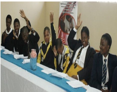
Teenage Pregnancy Dialogue READ MORE ON PAGE 5