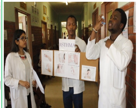
Pharmacy Week READ MORE ON PAGE 9