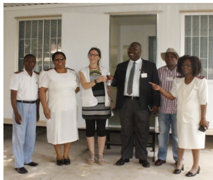
New on-site Gateway Clinic READ MORE ON PAGE 3