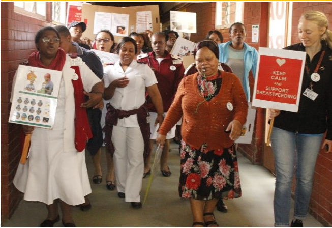
Hospital Staff during Breastfeeding March

Kusukela mhlaka 01-07 kuNcwaba umhlaba wonke usuke unomkhankaso wokugqugquzela omama ngokubaluleka kokuncelisa ubisi lwebele. Ekuqaliseni lomkhankaso abasebenzi basesibhedlela baba nemashi mhla zingu 03 ku Ncwaba ngaphakathi esibhedlela lapho babecula besho neziqubulo eziphathelele nokugqugquzela ukuncelisa ibele.