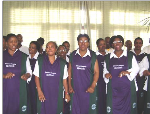
Ubani obengathinta thina. Ungathi Lemizwiilile yayisho kanjola. I Estcrou Hospital Choir iyakwazi ukukwenza edume ngako, uma nje uzozinika isikhathi sokulalela.

Ukuphumelela kwezemidlalo nomculo esibhedlela kusezandleni zabasebenzi kanye nabaphathi besibhedlela, ngakho akuboniswa ukuze kuphunyelwe.