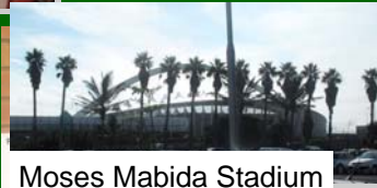
Moses Mabida Stadium