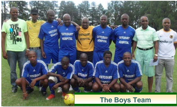
The Boys Team