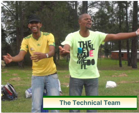
The Technical Team