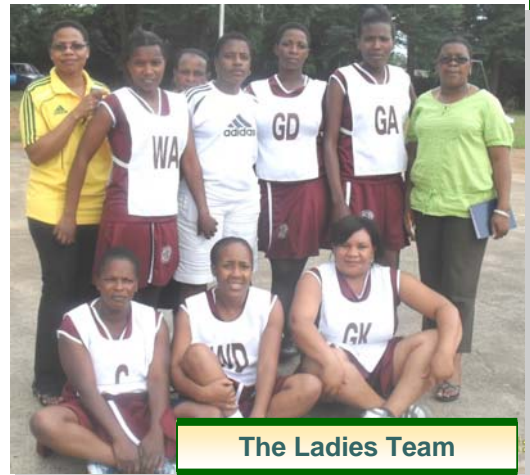
The Ladies Team