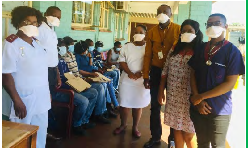
MDR team ready to assist lucky patients to be first ones to be assisted at Ladysmith outreach point

It is for that reason that MDR started on outreach project with the aim of making services accessible to those that need it the most. The outreach team comprises of a doctor and nursing staff, and they only visit Ladysmith hospital for now as many patients are coming from there. All patients are still initiated on MDR treatment at Estcourt hospital then the outreach team assists only the follow up of