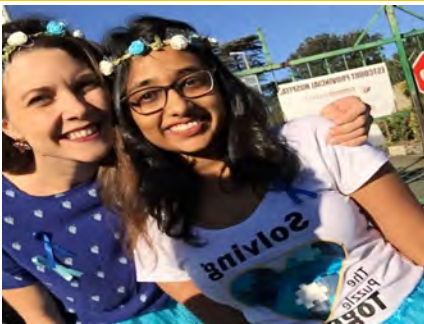
AUTISM AWARENESS..... READ MORE ON PAGE 3