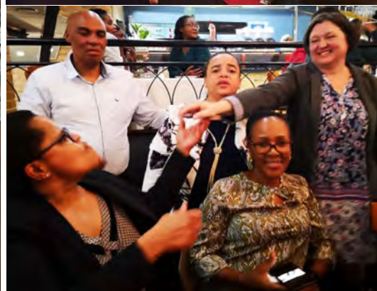
Estcourt hospital staff members came to bid farewell to their CEO on the 24 May 2019 at the Golden Horse in Pietermaritzburg.