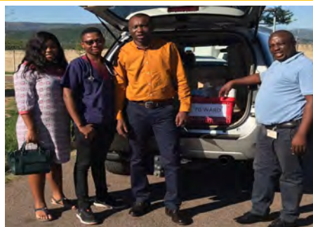
MDR TEAM OUTREACH..... READ MORE ON PAGE 4