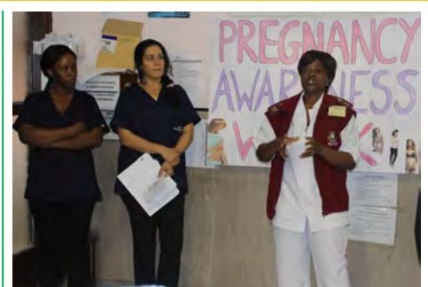
PREGNANCY AWARENESS WEEK READ MORE ON PAGE 5