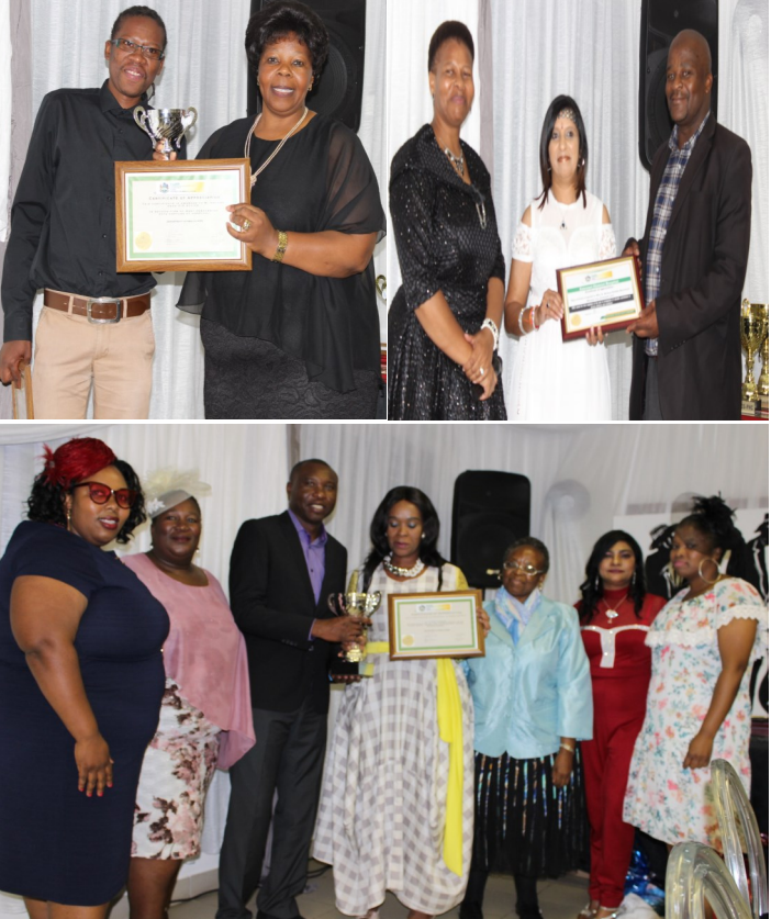
Pictures of some of employees that were rewarded for their hard work .

To all those rewarded for their hard work, well done and keep up the good work.