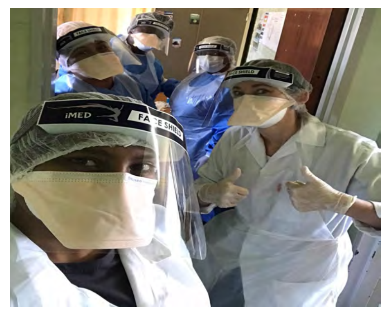
Staff getting ready to test a patient