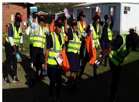
MASS SCREENING&TESTING READ MORE ON PAGE 2