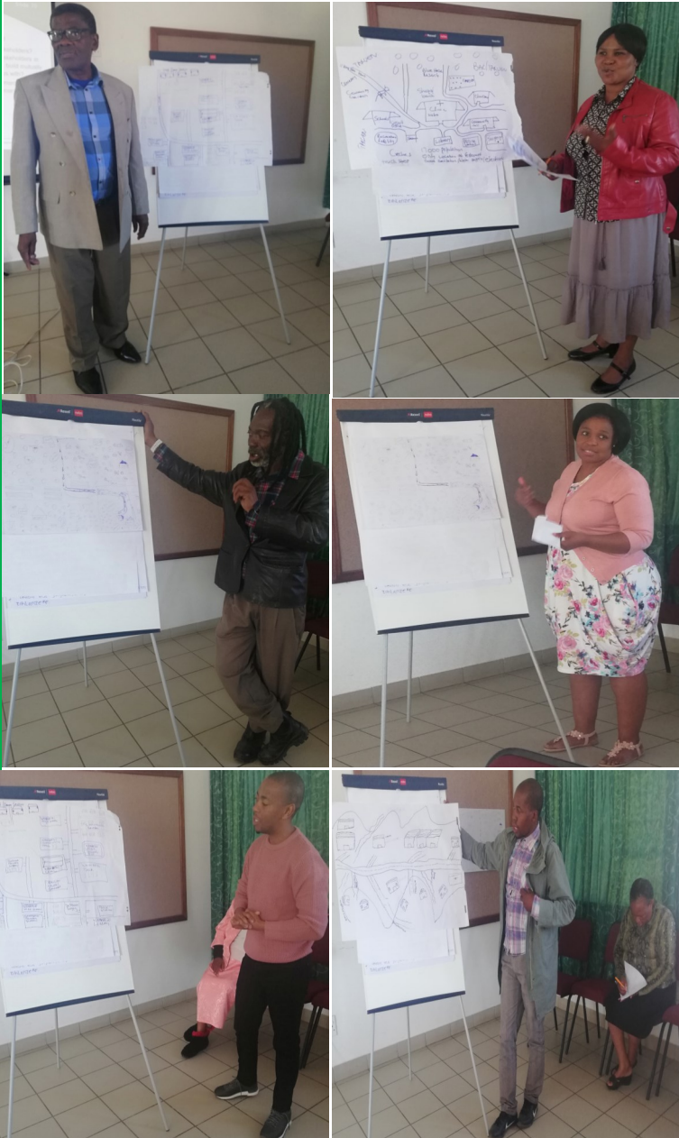
Top: Committee members and OM's doing presentations on different topics Below: Group photo for committee members & OM's that attended training

Estcourt Hospital successfully appointed its clinic committees in December 2017 and the commencement of duties started shortly after that. Challenges regarding clarification of roles were reported by clinic management and committee members. It was also noted that this governance structure was not as effective as it should be in undertaking the responsibility at hand and needed to be capacitated.