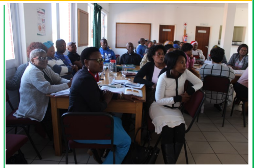
TRAINING FOR CLINIC COMMITTEES.... READ MORE ON PAGE 5