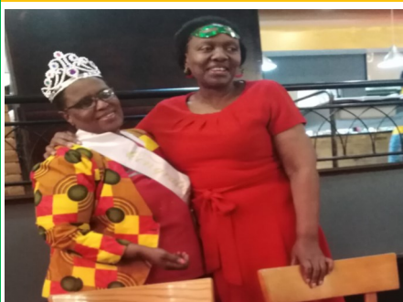
NURSING MANAGER'S ..... READ MORE ON PAGE 2