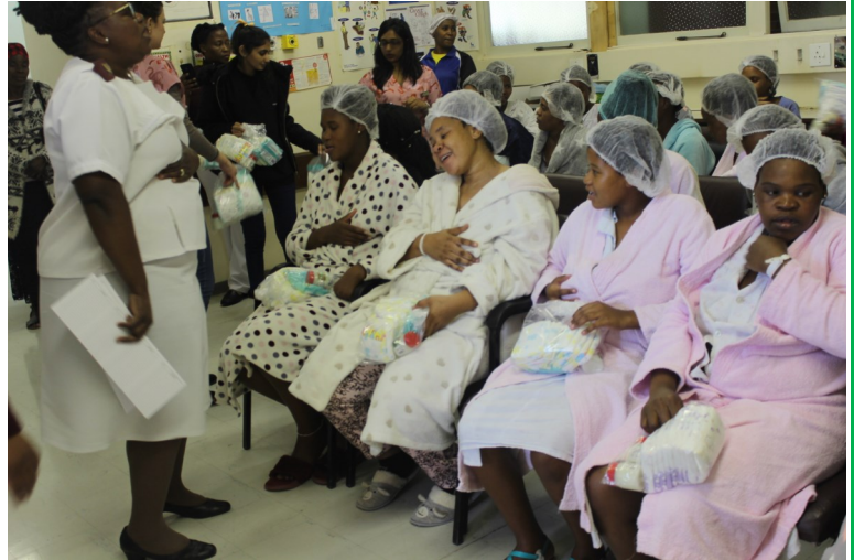
Mothers singing songs that encourages breastfeeding

Estcourt hospital took its campaign to different clinics including maternity ward to educate mothers and the community at large about the benefits of breastfeeding to both the mother and the baby. While mothers are encouraged to breastfeed, there is still a lot of myths surrounding breastfeeding while the mother is living with HIV. One of the myths is that if a mother is HIV positive, she should not breastfeed at all. It is questions like these that the team had to answer during the