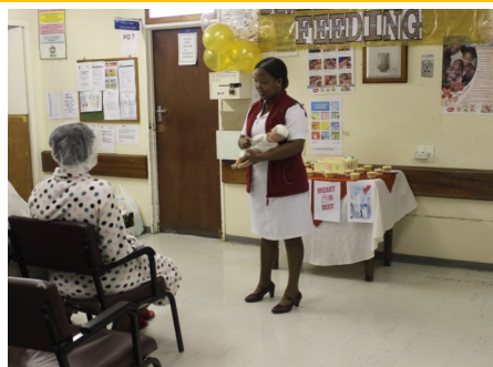
BREASTFEEDING WEEK ..... READ MORE ON PAGE 4