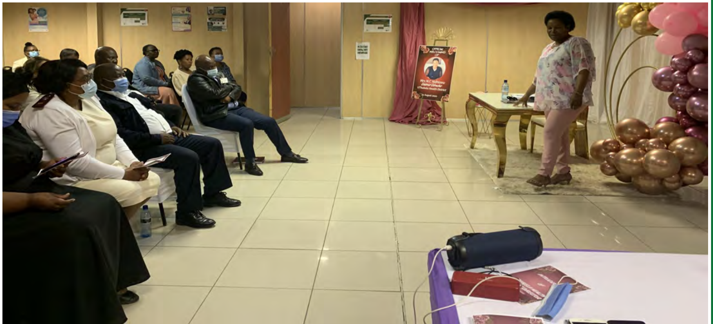
Newly appointed District Director addressing management teams from different sub-districts