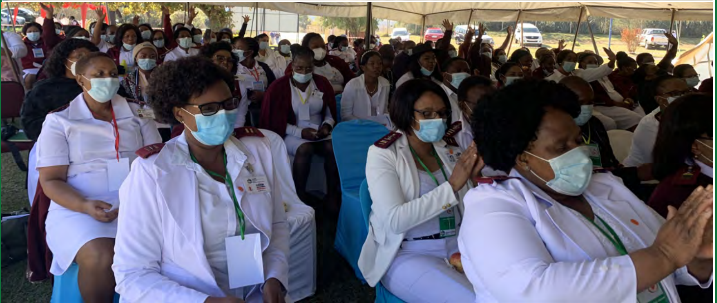
Nurses from hospital, clinics and neighboring hospitals listening attentively to the guest speaker during Nurses Day