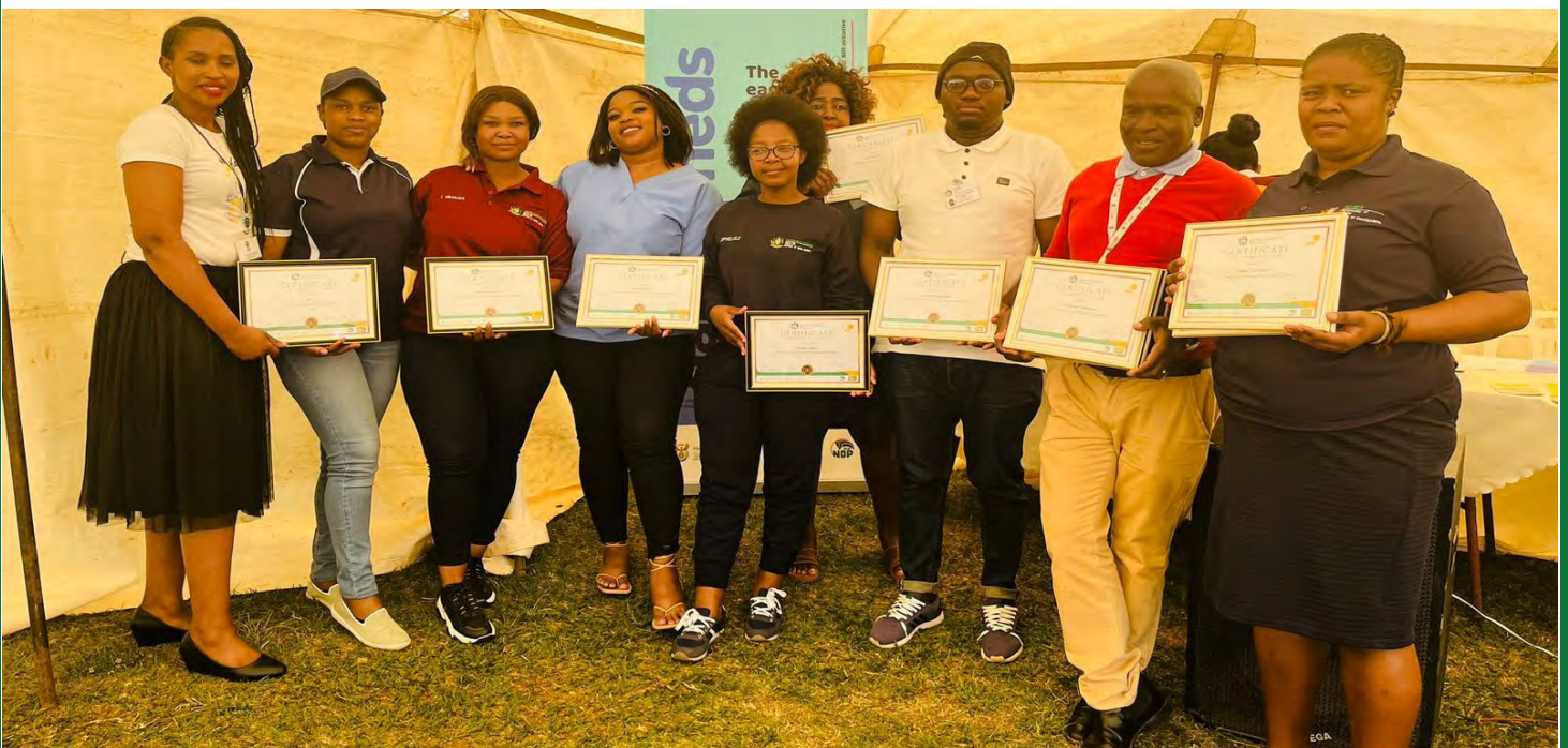
Recipients of certificates of appreciation for their commendable strides in the implementation of CCMDD