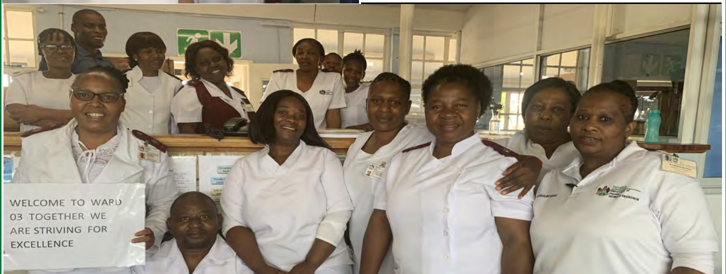
Ward 3 staff made a commitment to continue working as a team to provide quality care to patients