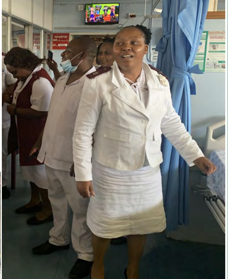
Team rejoicing during team building