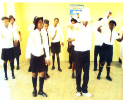
Ithemba Lesizwe group entertaining patients at GJC

C ommunities are now beginning to understand the role they ought to play in ensuring successful treatment of patients within the healthcare facility.