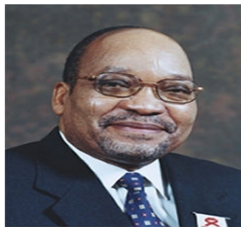
dent , Jacob Zuma.