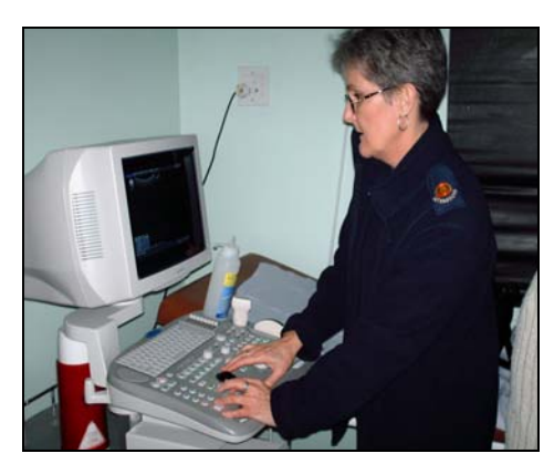
Above : Technician Showing x-ray department how to explore features in their new machine