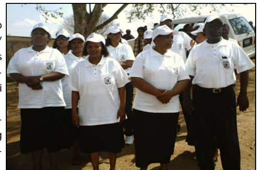
Yibo laba bafundi baka ABET abebekhambela umgubho obuse Mgungundlovu ngoSeptemba

Lo mcimbi ohlelwe abenhlango i-National organization of people living with HIV/AIDS (NAPWA), ozoba ngomhlaka 17 November, uhlose ukuveza iqhaza umufi abanalo ukulwa negciwane lesandulela ngculazi.