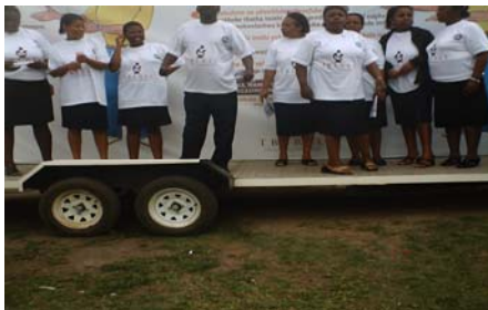
...and the health workers will make sure the community is TB Free !!!