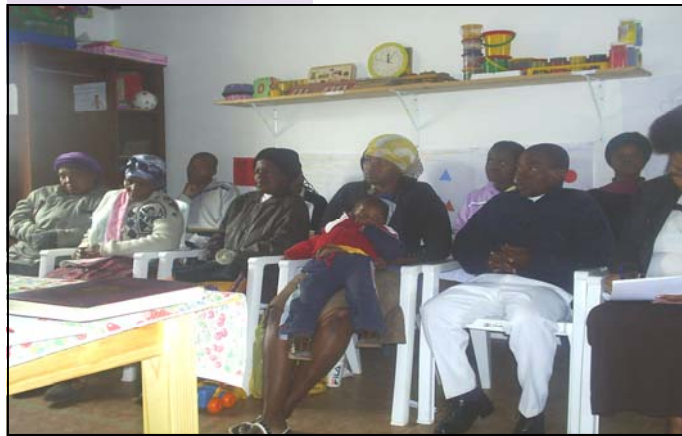
Dududu community is happy after receiving food parcels

This comes after the Minister of health Ms Peggy Nkonyeni had