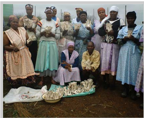
It was good for South Africa to benchmark from China, now we know mushrooms can be grown from the garden.

A campaign to promote healthy lifestyles has paid dividends to the community of KwaCele area. They had initially planned to grow a small garden for vegetables but due to the interest that community had shown the project was extended, and it is now a business opportunity for the community. See page 3 for a full story