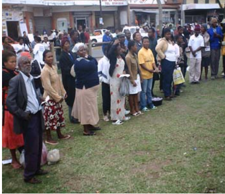
People at Umzinto town will now take TB seriously.....

We can say without any doubts that the Dududu people would have appreciated the team staying a little bit longer than they did, since they couldn't stop asking questions about TB and how to use TB treatment.