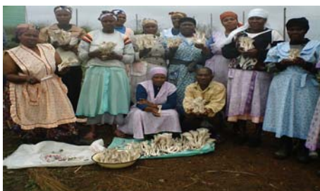
Above: Fresh Mushrooms from the garden

Thanks to the department of agriculture, the community can now access vegetables from the clinic.