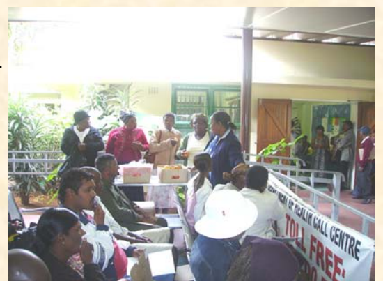
Our patients receiving an apple—to keep the doctor away

Dairy products, clean and safe water, low fat and low sodium food were all praised as being good for the body and for fighting deases and obesity. The community was given apples after the speeches.