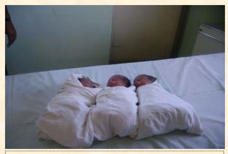
The lovely triplets at our maternity department