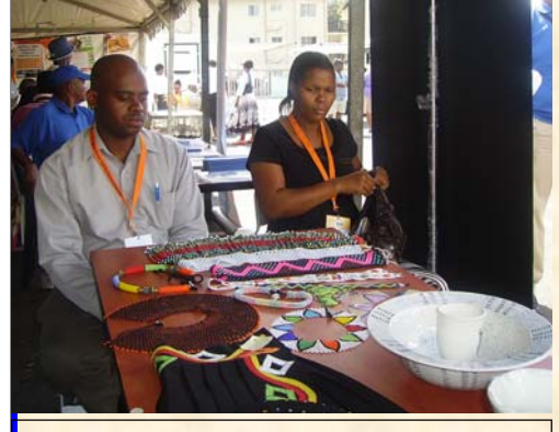
The community was encouraged to use their hands

The department of health (G.J Crookes hospital) gave information on Primary Health care, Hospital services, Referral systems, HIV/AIDS and TB, Home based care (UVHAA), Emergency Medical Rescue services and Clinic Upgrading & Building programme.