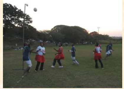
Netball in action

A friendly game was organized between our hospital and the local team of police on the 23rd of July 2008. Unfortunately the women did not pitch for the game because of unforeseen commitments and we could not cancel the games.