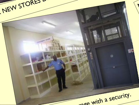
Stationary storage with a security.