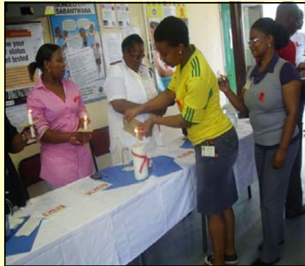
Everyone was lighting the candle and do the moment of silence

If you are following the hospital instruction, by taking your medication as you have directed to do so and also eat healthy food like fruits and vegetables, exercise your body and say no alcohol and cigarettes, by doing so you can still live a healthy life even if you are HIV positive.