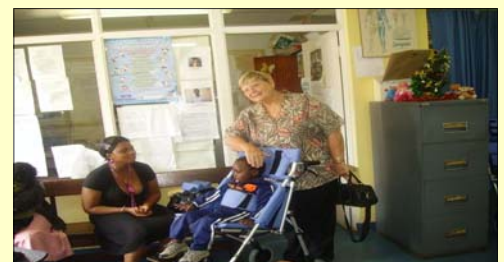
A Donor with a child who received a wheelchair and his mother

We as G.J Crookes Hospital expresses appreciation for the gifts of wheelchairs for our patients because of the Donors caring and generosity 3 children have blessed with the best Christmas gifts, They now can be able to move staying in beds at every time.