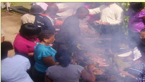
LEFT: Staff was having a braai after a function