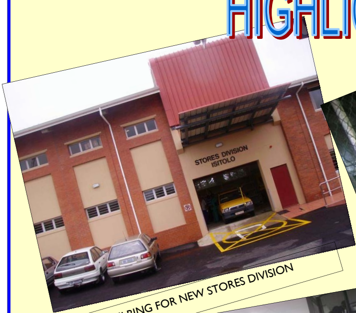
A NEW BUILDING FOR NEW STORES DIVISION