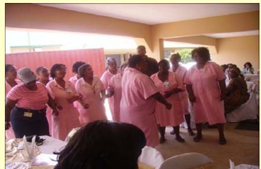
RIGHT: Hospital choir entertained the audience