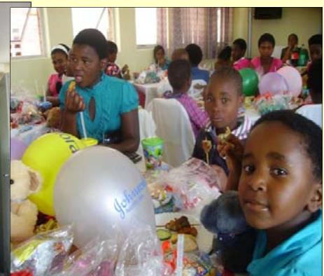
Children enjoyed themselves in their christmas party.

It should be noted that rape and abuse do not only affect victim but also the families and relatives. Ongoing counseling is advised to learn how to cope and deal with such a serious issue .Many victims suffer emotional break-downs with recurring floods of guilt that affect their future relationship such as friendship and marriage. The centre offers victims as much support as possible.