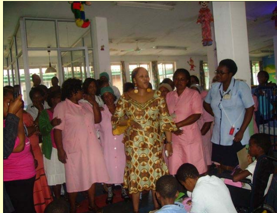
Mrs Thobeka Madiba Zuma, staff of G.J Crookes Hospital and some of children who received the gifts from the first lady.

Mrs Zuma gave us a much appreciated speech stating that she wishes the children a speedy recovery so that they can celebrate Christmas in their homes with their families. She also encourages mothers to take a very good care of their kids she said she was very embarrassed to see the child admitted in the hospital reason being heated by boiled water ,this is called the carelessness of mothers to their Childs, how can you leave your baby with boiled