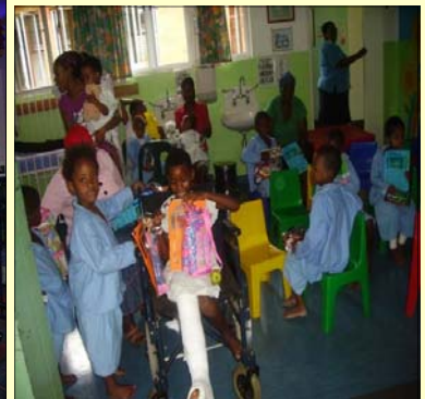
H ward children were very happy after receiving their gifts.

The gifts and visit were appreciated by the management , the whole staff at the ward and mostly the recipients, who are the kids at the ward.