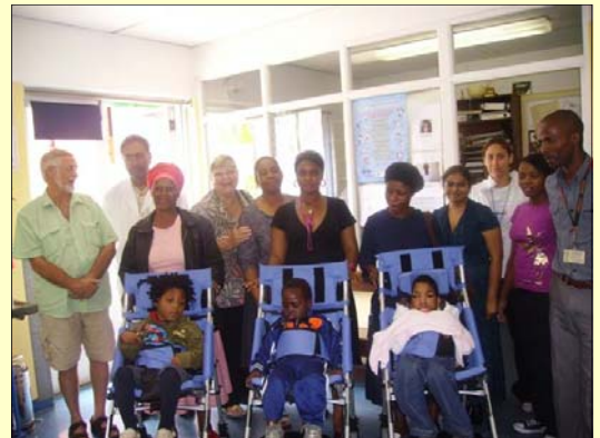
3 children who received wheelchairs and their mothers, Physiotherapists, Donors and Hospital management

We as G.J Crookes Hospital expresses appreciation for the gifts of wheelchairs for our patients because of the Donors caring and generosity 3 children have blessed with the best Christmas gifts, They now can be able to move staying in beds at every time.