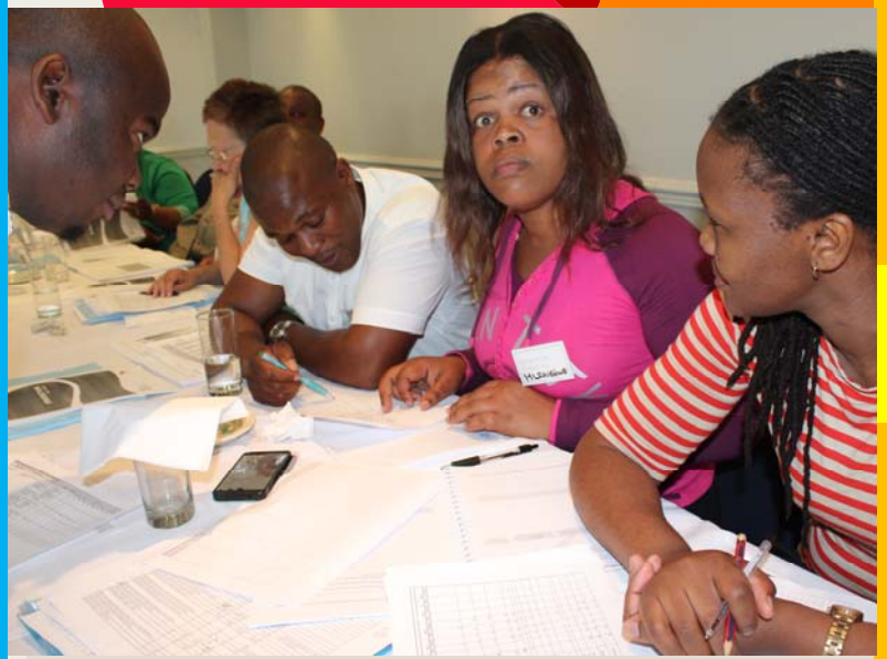
GJC Staff doing an exercise on day 2 at the workshop

This workshop helped to paint a new picture in everybody's eyes about how much we are dependent on each other as separate departments in one institution. With everybody happy about the workshop and what they learned from it, there is now hope for even better provision of our services to the community.