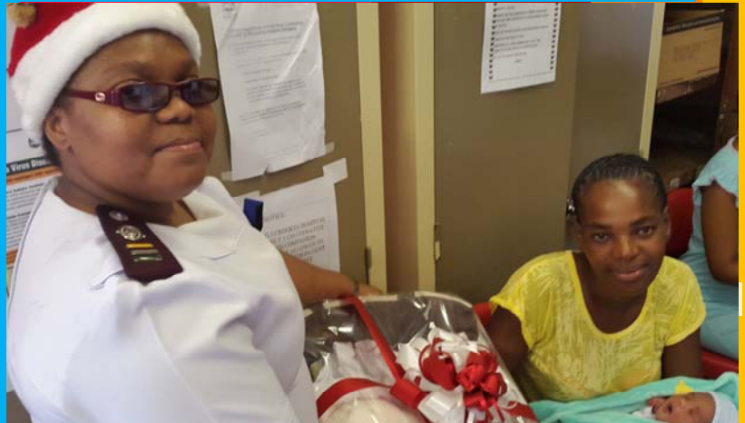
Professional Nurse at Maternity with New Mother

The MEC's message to all the mothers was "The time of giving birth should be a happy event, but that can only be achieved if mothers, when they suspect that they have fell pregnant, they should attend the Ante Natal Clinic from the first month of throughout their pregnancy. The clinic is coordinated by healthcare professionals to ensure that mothers have a healthy pregnancy and successful delivery"