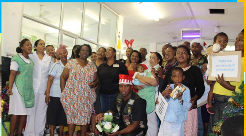
H Ward Staff, Mayor of Ugu District, CEO, Impi Bikers and H ward Children