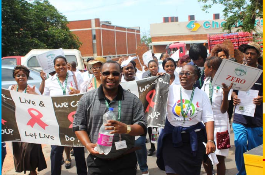
The HAST Team singing their way to the community hall in Scottburgh