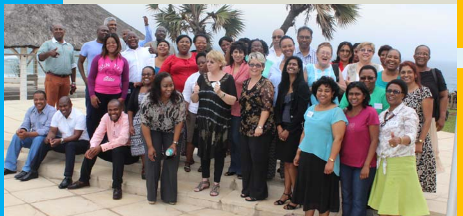
GJC Staff on Day 3 at the end of the workshop