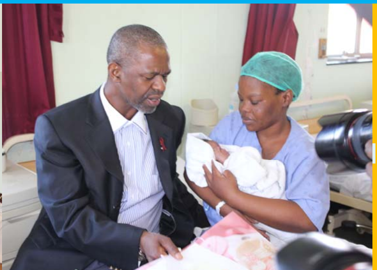
MEC giving the new mother a baby Hamper