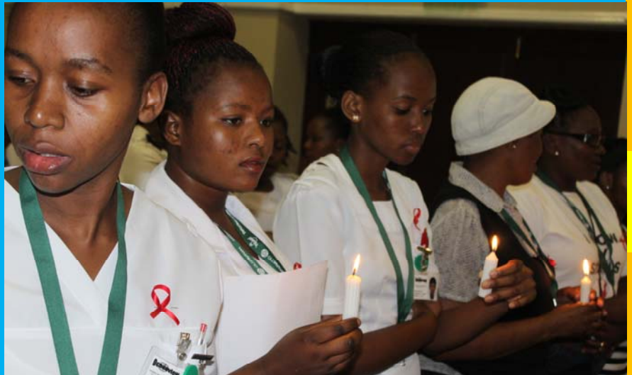
The Candle Light Ceremony in the memory of people who died with Aids