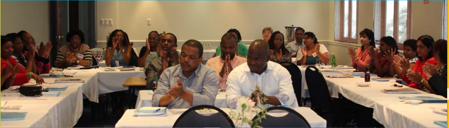
GJ Staff on Day 1 at the Workshop

On the 25th to 27th November 2014 thGJ Crookes Hospital Extended Management Committee was invited to a 3 day Data Management, Monitoring and Evaluation workshop which at Blue Marlin Hotel