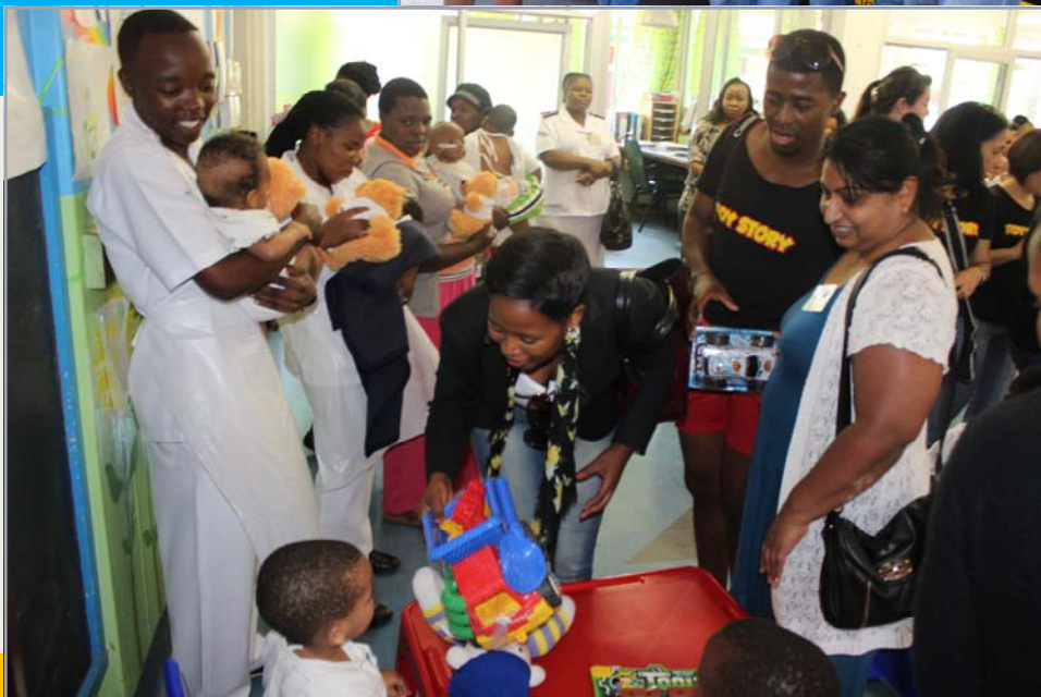
H Ward Staff with the ECR Toystory Ream giving presents to kids