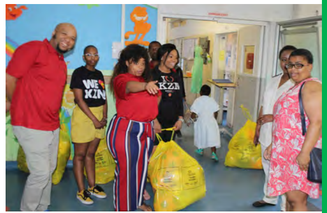
East Coast Radio Toys R Us Campaign READ MORE ON PAGE 03