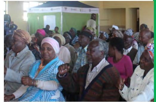
Eyesight Awareness.... READ MORE ON PAGE 02