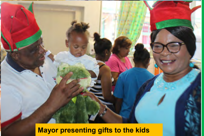
Mayor presenting gifts to the kids