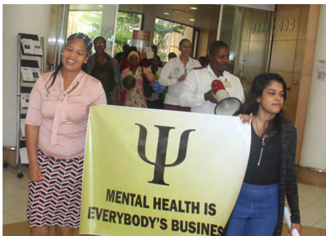
HAND HYGIENE AWARENESS DAY.... READ MORE ON PAGE 04