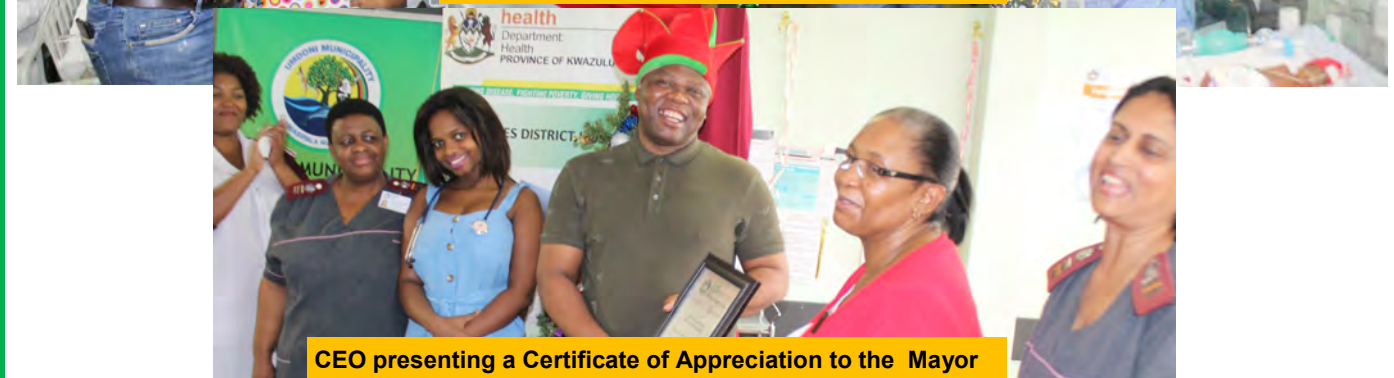
CEO presenting a Certificate of Appreciation to the Mayor