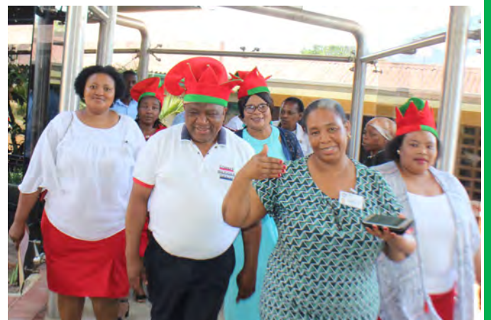
WELLNESS DAY EVENT.... READ MORE ON PAGE 13