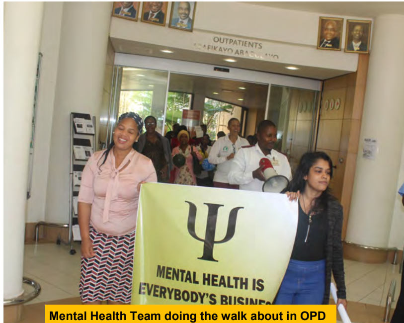
Mental Health Team doing the walk about in OPD

On the 10th of October 2018 the Psychiatric Clinic held an Awareness campaign in the Outpatients Areas of GJ Crookes Hospital. The Theme for the day was “ Young People and Mental Health in a Changing World ”. The departments involved in this campaign were Psychiatric Clinic, Social worker, Crisis Center Team, Physiotherapy Department and Outpatients Department. Topics that were covered on the day were :