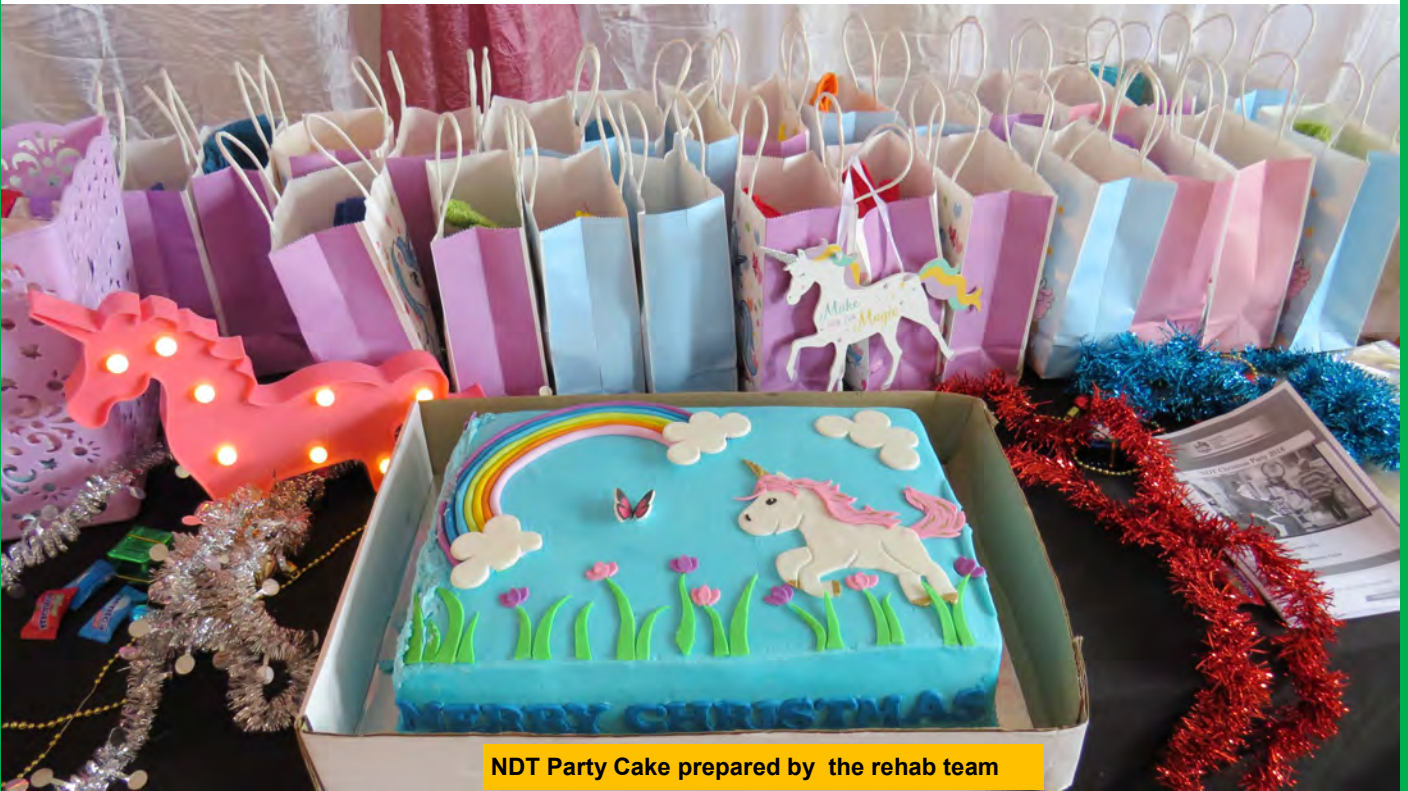
NDT Party Cake prepared by the rehab team