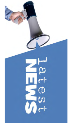
MEC for Health Isibhedlela Kubantu READ MORE ON PAGE 02