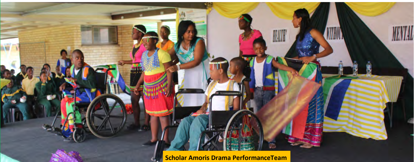
Scholar Amoris Drama Performance Team