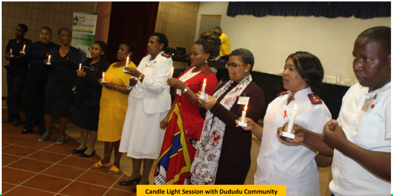
Candle Light Session with Dududu Community