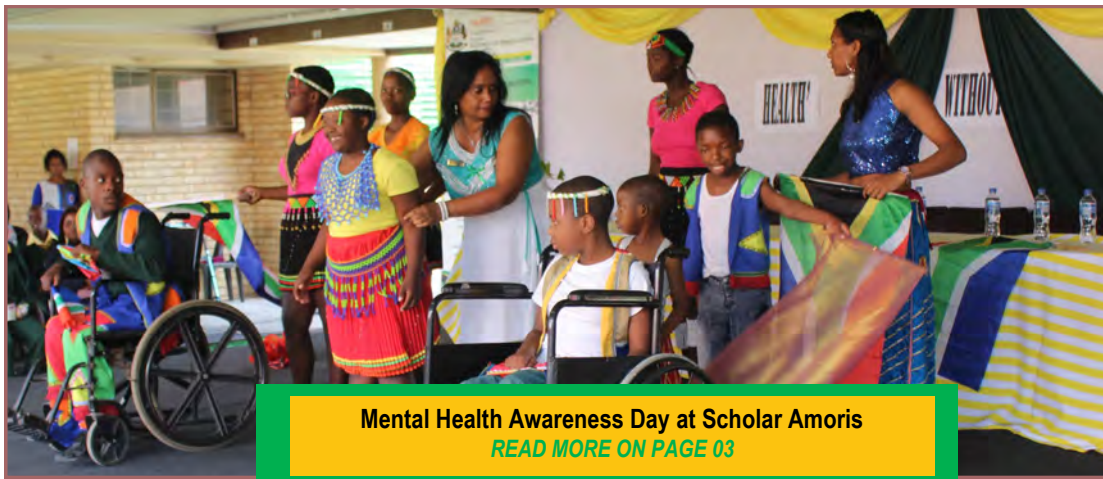
Mental Health Awareness Day at Scholar Amoris READ MORE ON PAGE 03