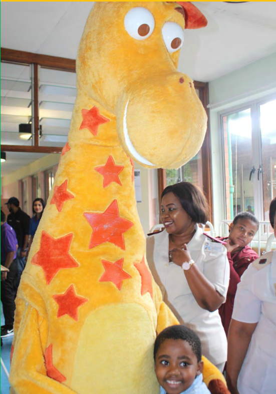
Children happy to Pose with Giffy brought by Toy story