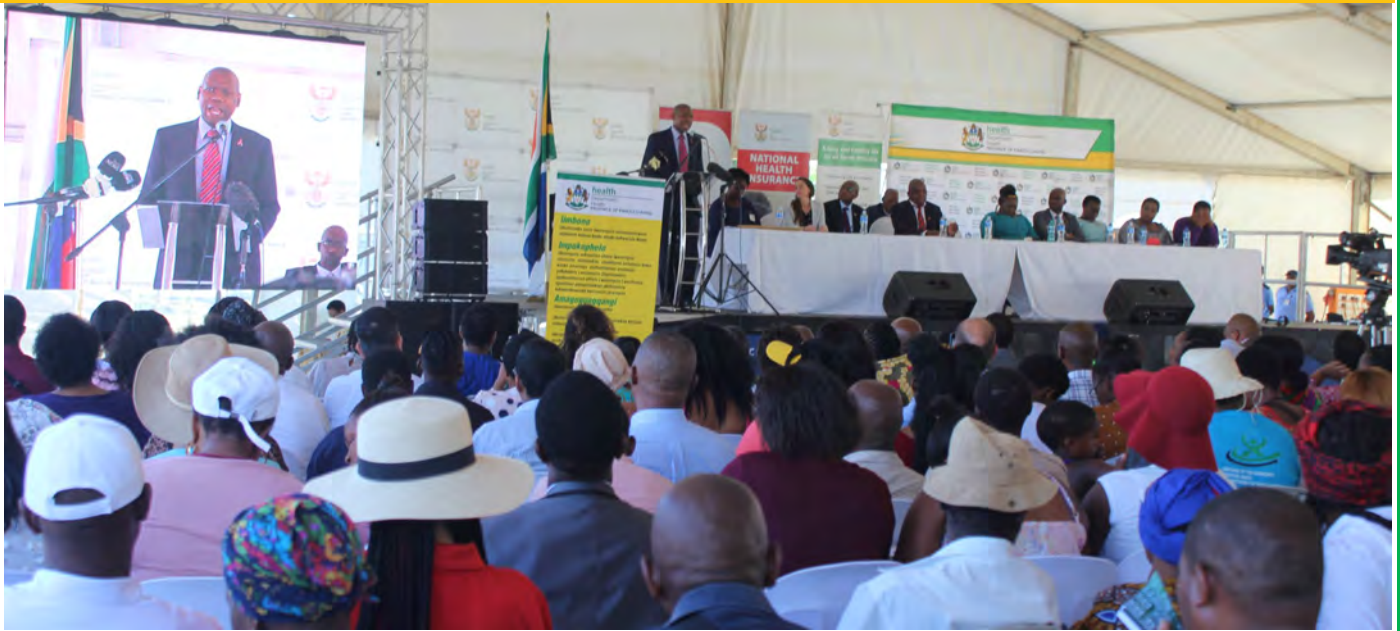
Minister of Health Launching The New TLD Drug for HIV/Aids

On the 27th of November 2019 Ugu North Health Sub-district was part of the National Minister of Health Dr. Zweli Mkhize and MEC for Health KZN Ms. Nomagugu Simelane Zulu visit to the Community of Umzumbe starting at Turton CHC for a clinic walkabout and proceeded to Umzumbe sports field where he launched a new TLD drug for HIV was presented and welcomed by many. The Minister also presented a 909090 strategy certificate of achievement to Ugu Health District for meeting and exceeding the 909090 targets way ahead of time set. This meant a great deal Ugu District Primary Health Care as it meant more and more clients are screened, initiated on treatment and their viral load suppressed.