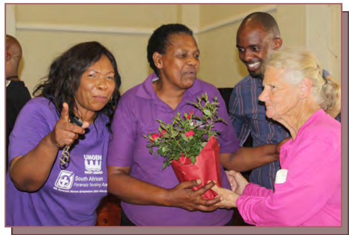
Survivors Christmas Party.... READ MORE ON PAGE 06