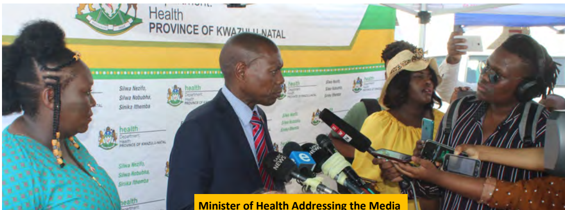
Minister of Health Addressing the Media

On the 27th of November 2019 Ugu North Health Sub-district was part of the National Minister of Health Dr. Zweli Mkhize and MEC for Health KZN Ms. Nomagugu Simelane Zulu visit to the Community of Umzumbe starting at Turton CHC for a clinic walkabout and proceeded to Umzumbe sports field where he launched a new TLD drug for HIV was presented and welcomed by many. The Minister also presented a 909090 strategy certificate of achievement to Ugu Health District for meeting and exceeding the 909090 targets way ahead of time set. This meant a great deal Ugu District Primary Health Care as it meant more and more clients are screened, initiated on treatment and their viral load suppressed.