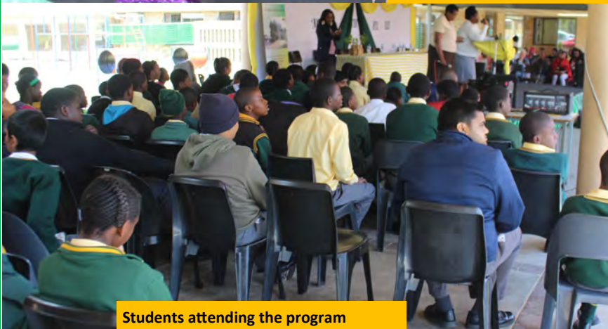
Students attending the program