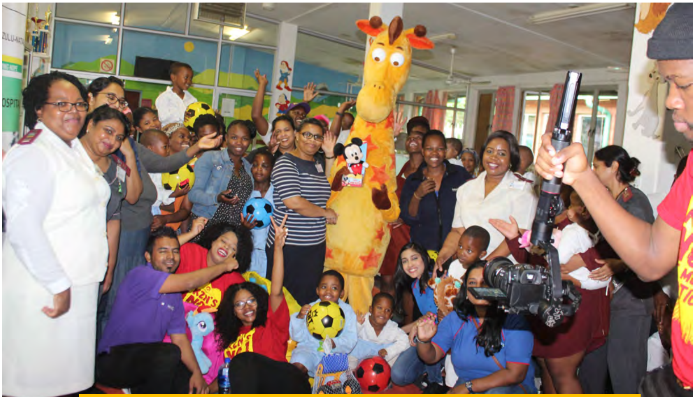
Hospital Management with Toy story and Children of H Ward with their parents happy for the gifts received

On the 25th of November 2019 the East Coast Radio and Toy story Team visited GJ Crookes once more to provide gifts for children admitted at the Pediatrics ward. This has been an annual activity by East Coast Radio and Toystory which the hospital receives with such appreciation as it comforts the babies during their time of admission. The Mothers and guardians of patients were happy of the generosity by East Coast Radio and Toy Story. Each and every child in the ward received a toy which they liked and were happy.