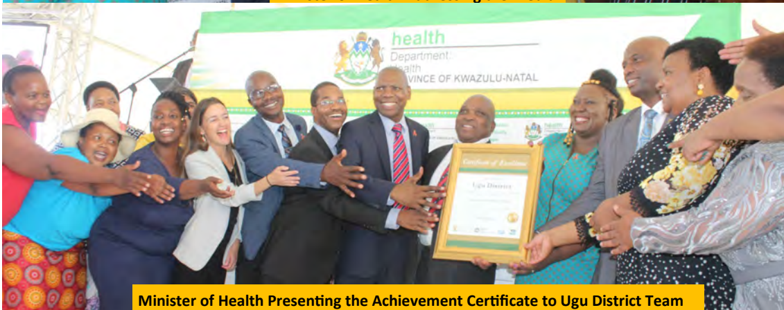
Minister of Health Presenting the Achievement Certificate to Ugu District Team