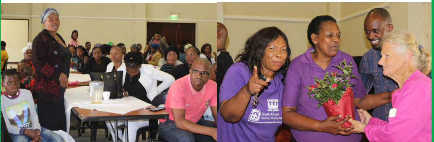
Guardian giving a vote of thanks on behalf of parents of survivors

During the event, the children received brand new school shoes as a sign that education is the key to success and there is still hope for a brighter future; they also received toys, gifts, food, refreshments etc.