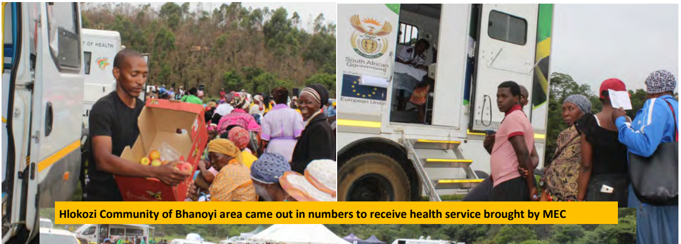
Hlokozi Community of Bhanoyi area came out in numbers to receive health service brought by MEC