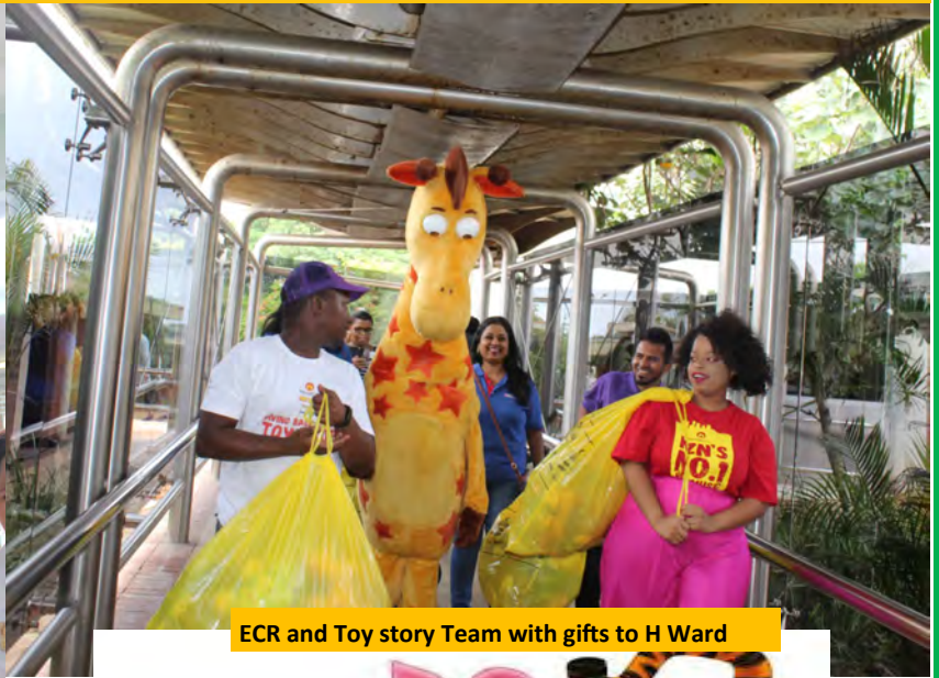
ECR and Toy story Team with gifts to H Ward