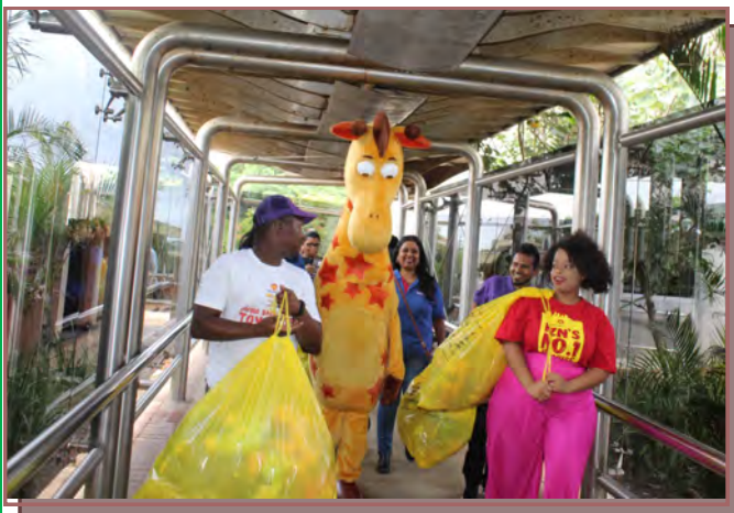
East Coast Radio Toy Story.... READ MORE ON PAGE 04