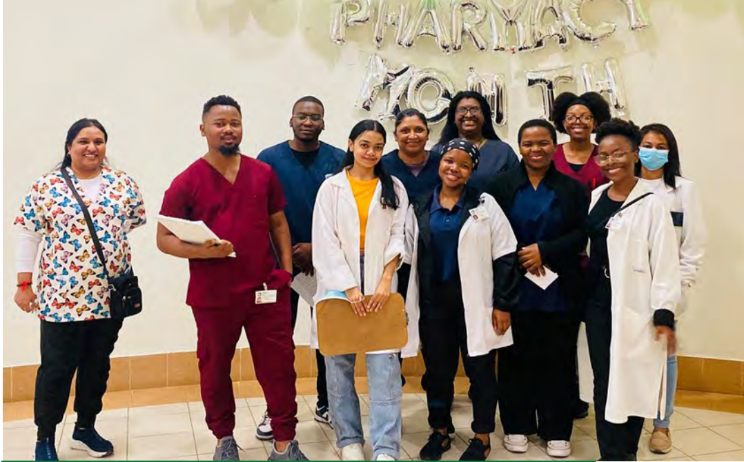
GJ Crookes Hospital Pharmaceutical Team

Pharmacy month is an annual health awareness campaign held every September, focusing on the rational use of medicines. The theme for 2024 was 'Lets talk about Vaccines'. This initiative aims to promote informed discussions and education about vaccines, their importance and their role in preventing diseases.