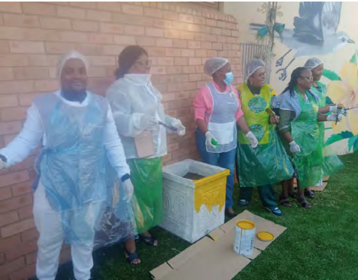
GJ Crookes Senior Management Team decorating the pot plants in crisis center