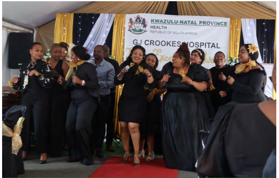
GJ Crookes Hospital :Events Committee