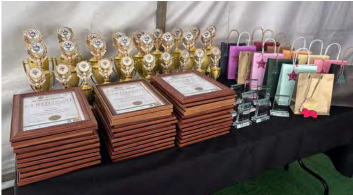
PHOTO GALLERY 2024 SERVICE EXCELLENCE AWARDS