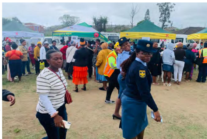
Umzinto SAPS team attended Isibhedlela Kubantu at Malangeni Area

Isibhedlela Kubantu gained significant support from sister departments and traditional leadership, who joined the GJ Crookes team in visiting different areas. The communities were deeply appreciative of the event with many attending in large numbers to access essential healthcare services. Management of GJ Crookes Hospital and PHC would like to extend their sincere gratitude to all sponsors who contributed to the success of Isibhedlela Kubantu. Their generosity which included sponsoring marquees, food and other essentials was invaluable in making these events a success .