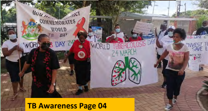
TB Awareness Page 04