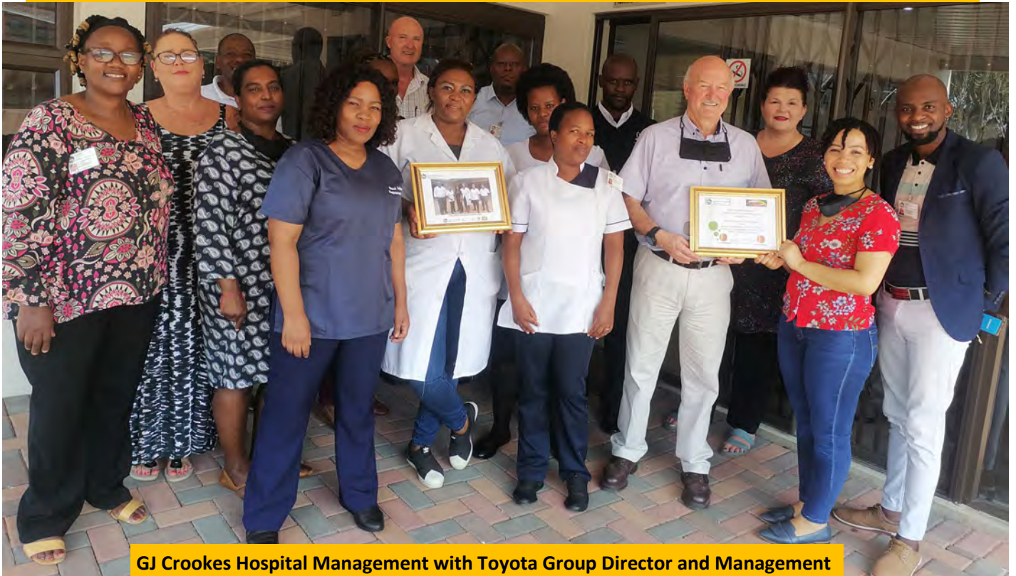
GJ Crookes Hospital Management with Toyota Group Director and Management

In November 2021 Halfway Toyota partnered with GJ Crookes Hospital in provision of a site for vaccinations. This made things easy for the community of Umdoni and surrounding areas as it came as another fixed station for a limited time to provide vaccinations. The community of Scottburgh, Parkrynie, Renishaw, Pennington and other surrounding areas were excited to have another accessible point other than the few clinics, which vaccination was only confined in at the time. Vaccination at this station went on for a full five months which was of great assistance to Umdoni Health Sub-district. The last day of vaccinations at Toyota Halfway was on the 31 st of March 2022.