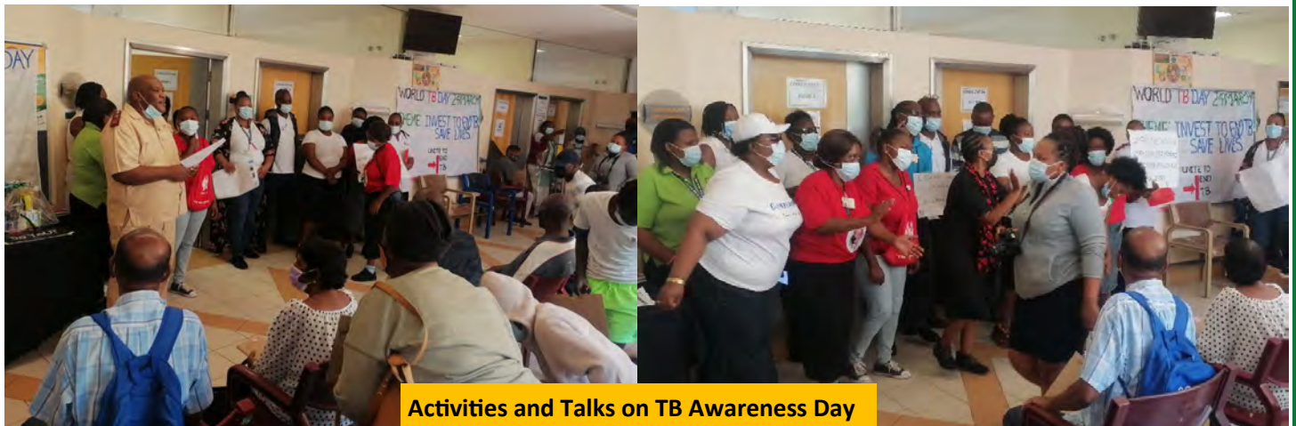
Activities and Talks on TB Awareness Day

The program consisted of health education songs, and slogans to end TB. Following health education and presentations a question and answer session was done, where clients who provided correct answers would be rewarded with appreciation tokens.