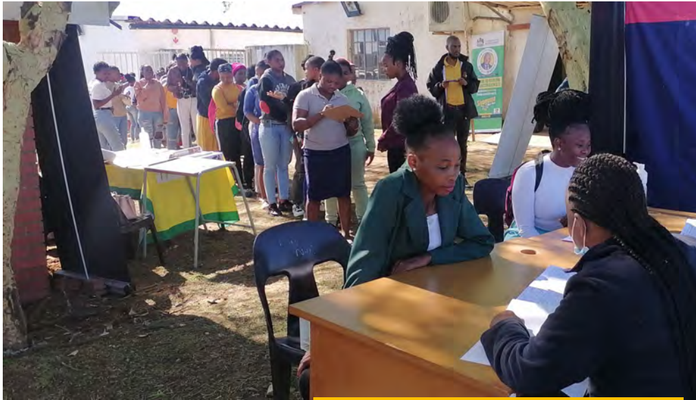
Students queuing for services