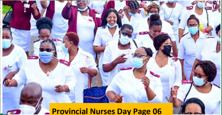
Provincial Nurses Day Page 06