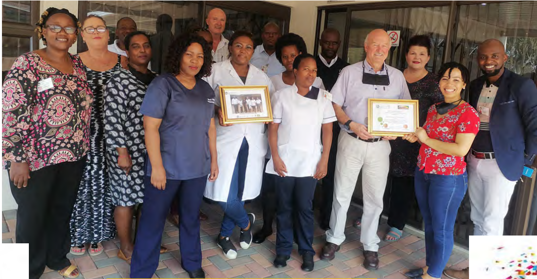
Appreciation to Toyota Halfway Group pg.3