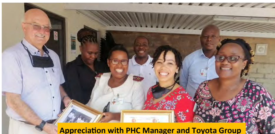
Appreciation with PHC Manager and Toyota Group