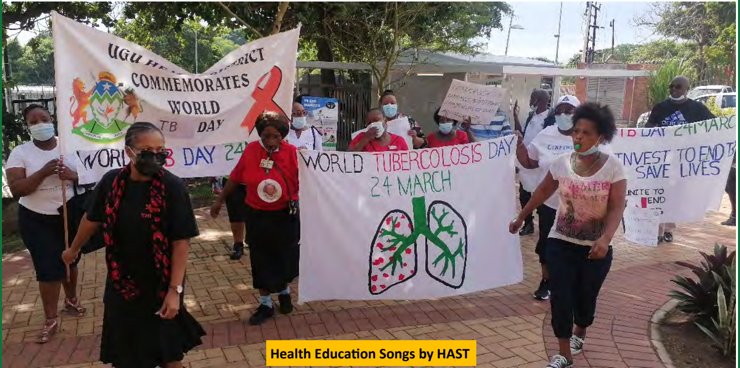
Health Education Songs by HAST

On the 24th May 2022 the HAST Unit of GJ Crookes Hospital held a TB Awareness Day Event at the Outpatients Department. This event is held to raise awareness to communities that TB is one of the main killer diseases in South Africa as per statistics. It is also done to remember the people who passed away from this disease. During this event, people were informed that TB is preventable and curable. In addition health education about signs and symptoms, utilization of their local facilities and the importance of screening and testing was given. Adherence to treatment in preventing complications such as MDR, was emphasized during health education.