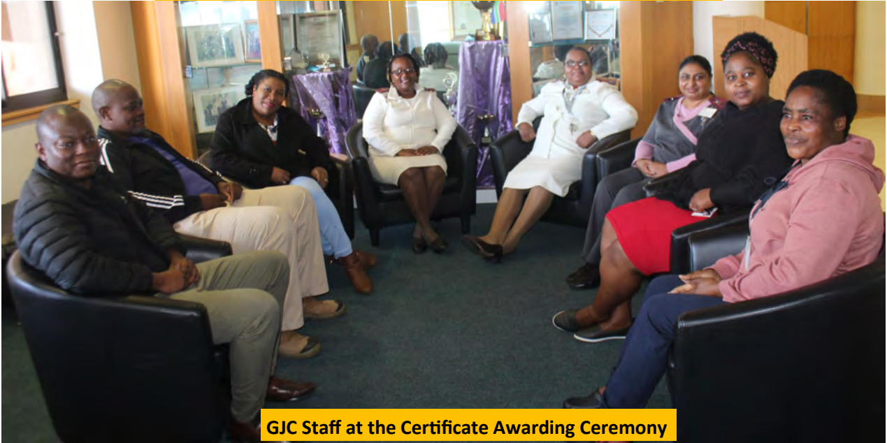
GJC Staff at the Certificate Awarding Ceremony

The floods that affected KZN in April 2022 resulted in disruption of water supply for the North and South Coasts. The flood related water disruption was a major challenge for the hospital. The staff and stakeholders made great efforts to decrease the risks and prevent disasters within the facility as a result of no water.