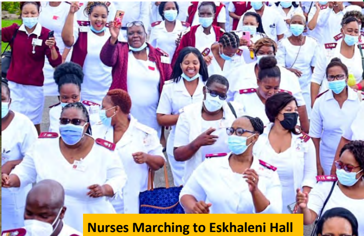
Nurses Marching to Eskhaleni Hall