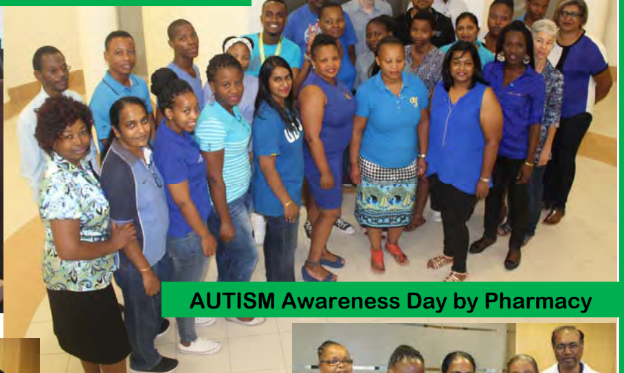
AUTISM Awareness Day by Pharmacy