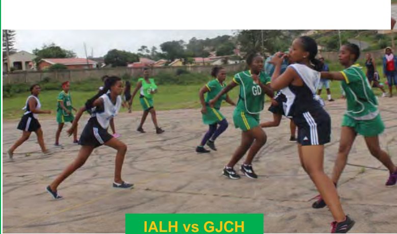
IALH vs GJCH