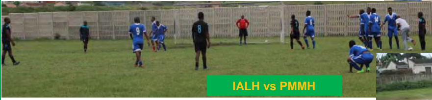
IALH vs PMMH