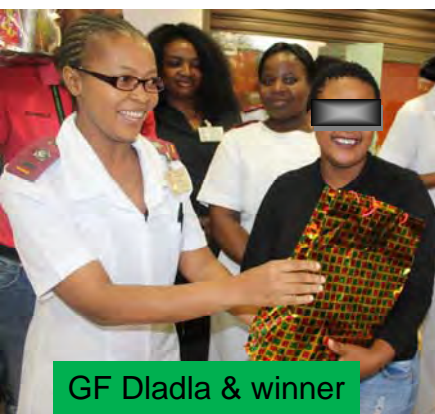
GF Dladla & winner