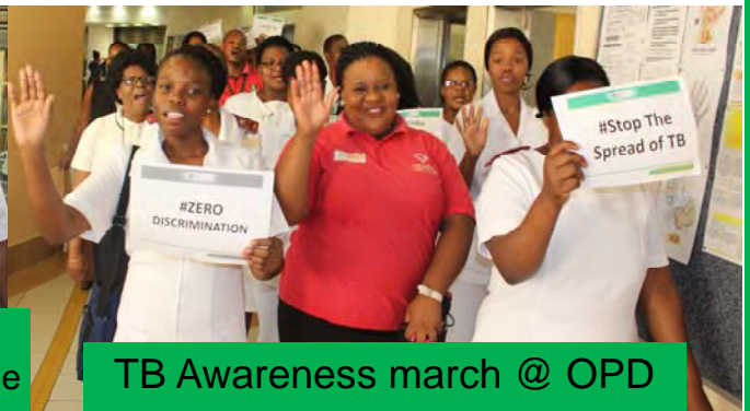
TB Awareness march @ OPD