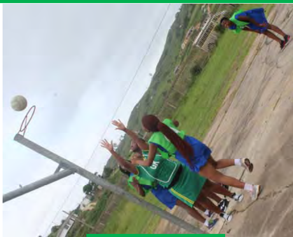
PSH vs GJCH