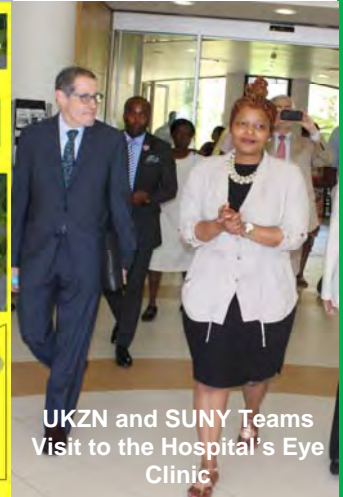
UKZN and SUNY Teams Visit to the Hospital's Eye Clinic