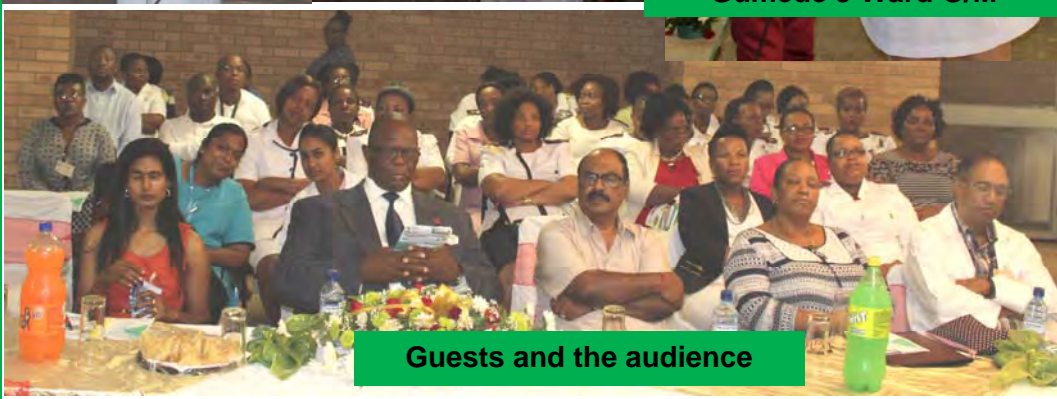
Guests and the audience