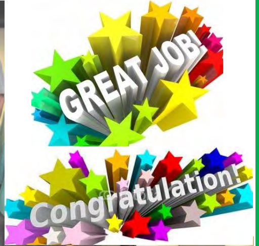
GJ Crookes District Hospital Maternity ward receives Zero Maternal Deaths Certificate for the 2015/2016 financial year