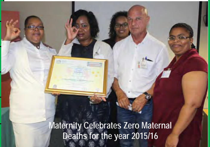
Maternity Celebrates Zero Maternal Deaths for the year 2015/16