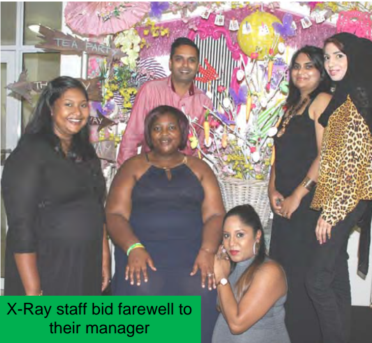
X-Ray staff bid farewell to their manager