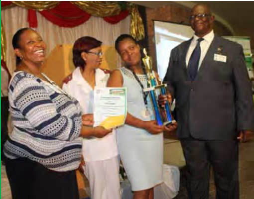
2nd position Waste Management