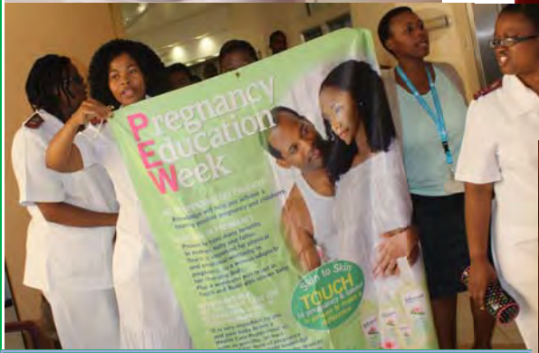
NURSES MARCHING AT THE HOSPITAL