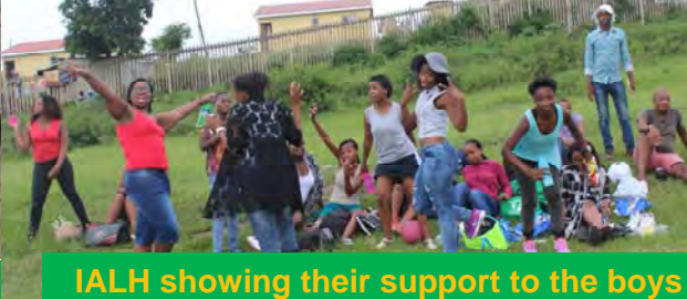
IALH showing their support to the boys