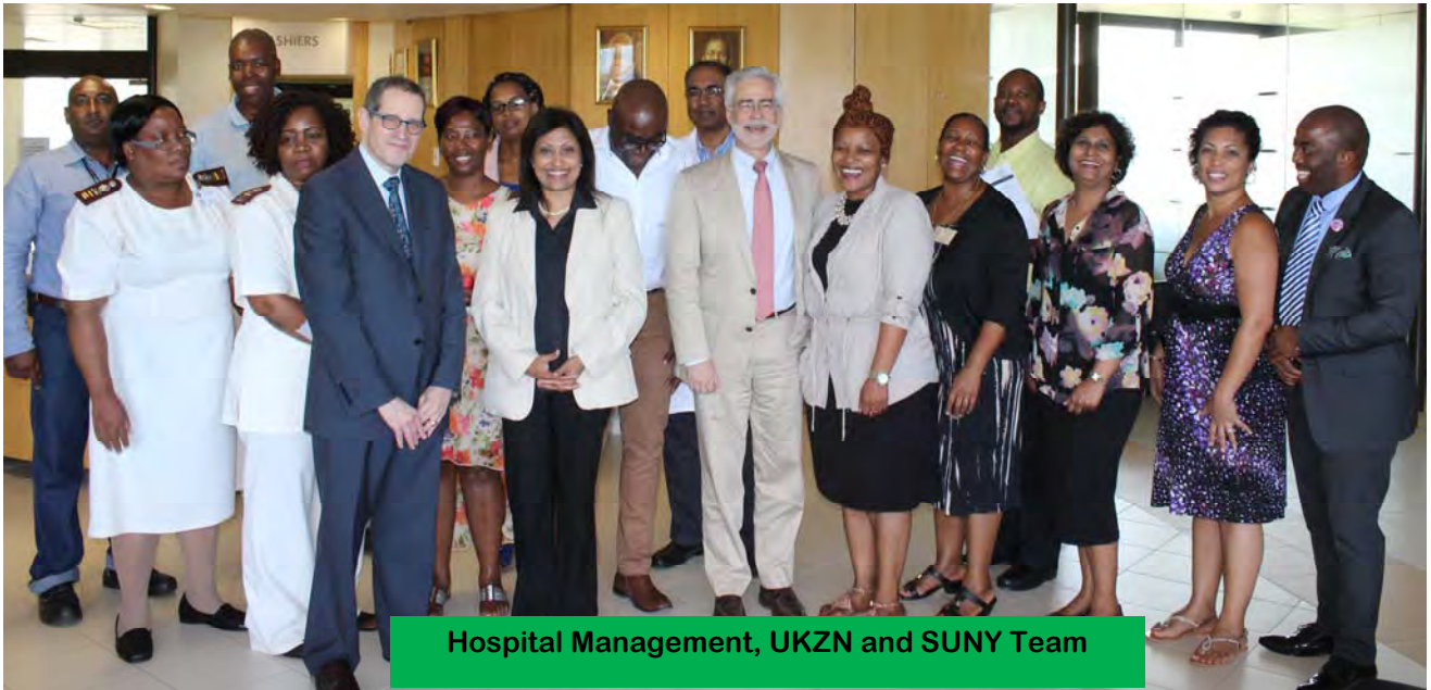
Hospital Management, UKZN and SUNY Team