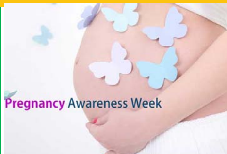
Pregnancy Awareness Week