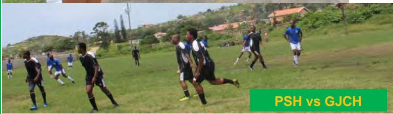
PSH vs GJCH