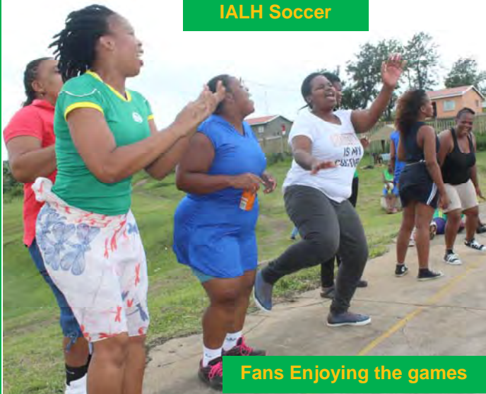
Fans Enjoying the games