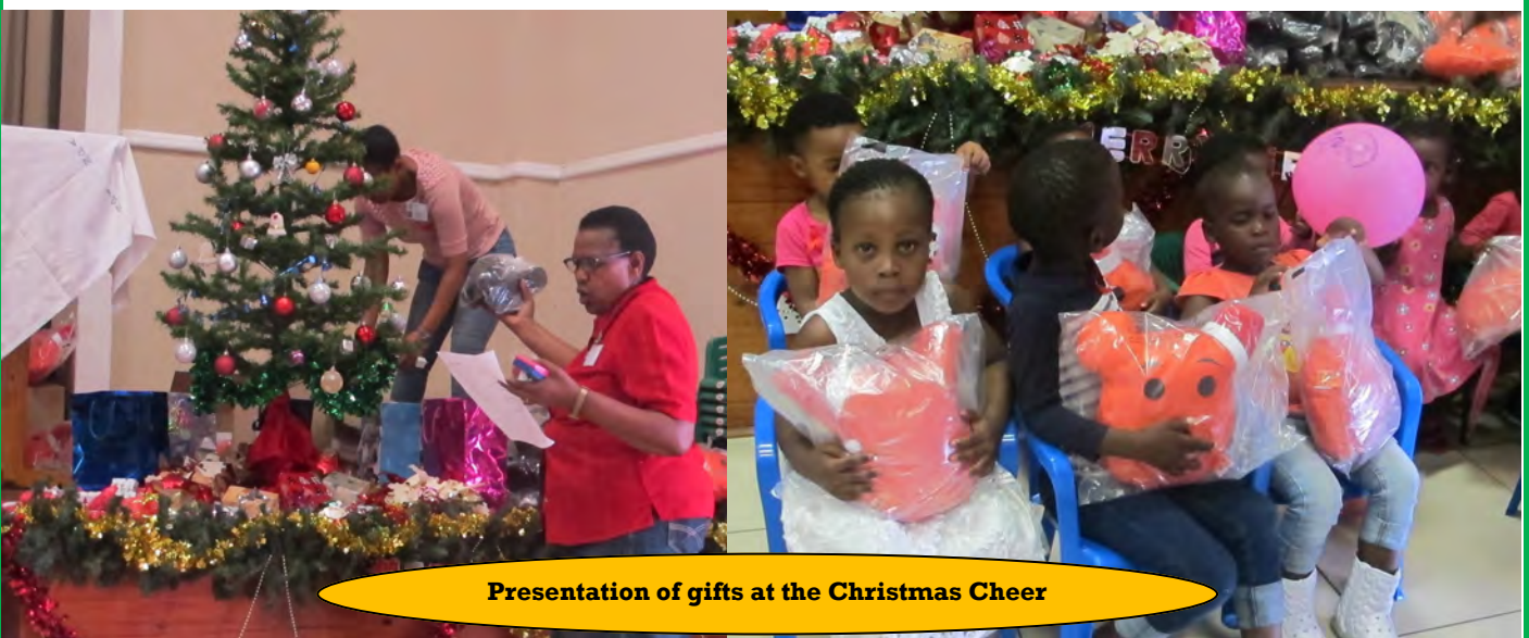
Presentation of gifts at the Christmas Cheer