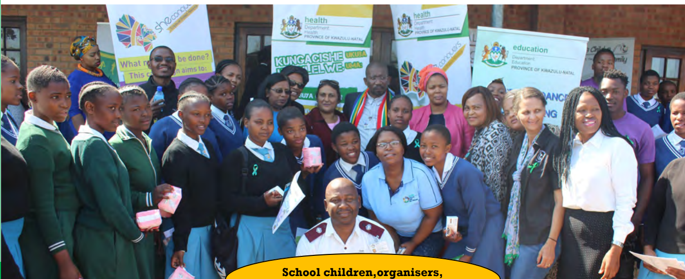
School children,organisers, guests and staff