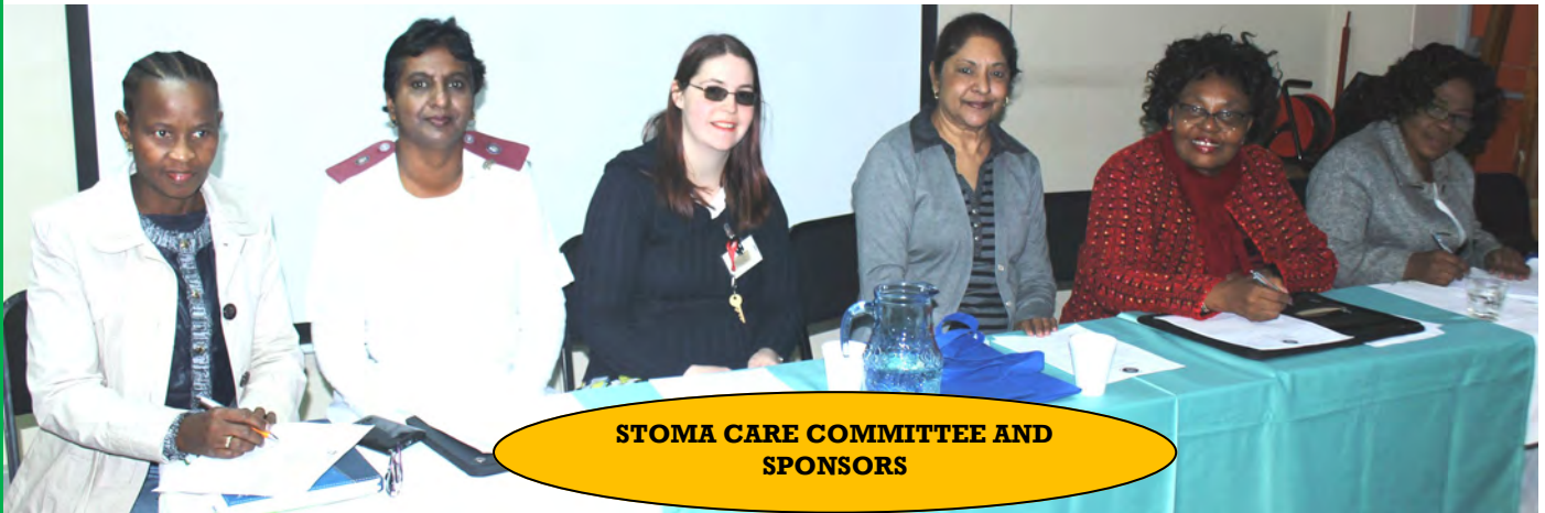
STOMA CARE COMMITTEE AND SPONSORS