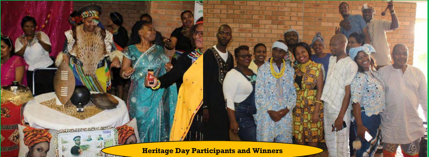
Heritage Day Participants and Winners