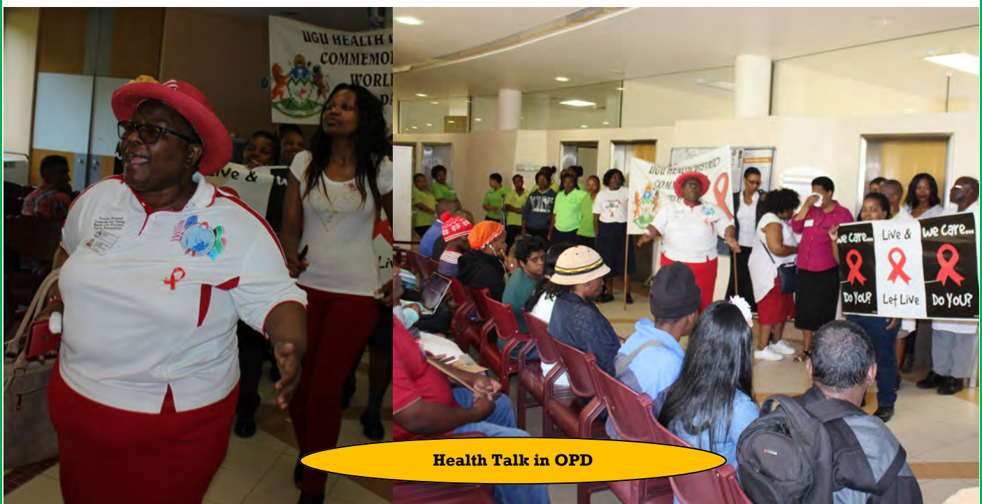
Health Talk in OPD

On the same day at Amahlongwa Community Hall another team went there and did health education on HIV/AIDS, UTT, PEP, STI and TB Screening and follow-ups on pregnant women and PMTCT including Cervical Screening and MMC. This day and all these activities were motivated by the theme which said "its my right to know my status", "HIV prevention is my responsibility" and "Count me in"