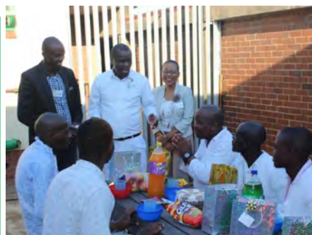
Mandela Day Celebration.....