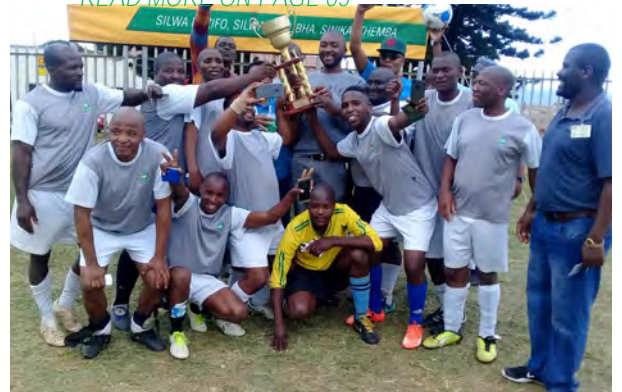
GJC Soccer Team Victory at Tournaments.....