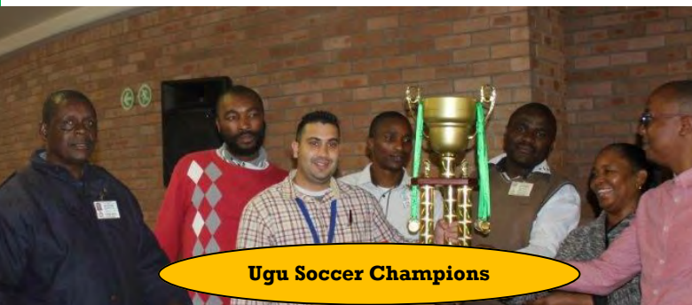
Ugu Soccer Champions