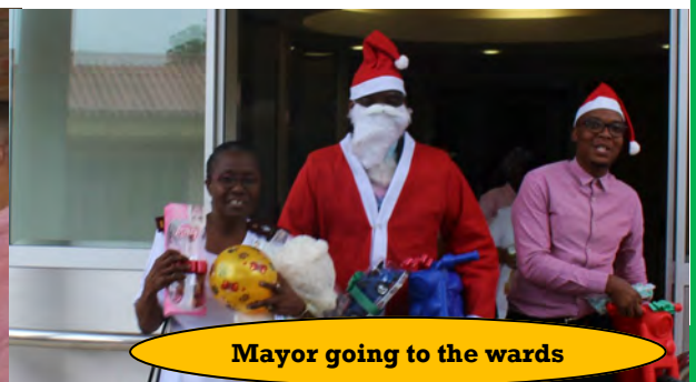
Mayor going to the wards