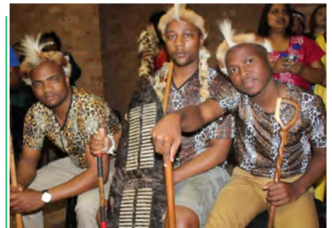
Heritage Day Celebration.....