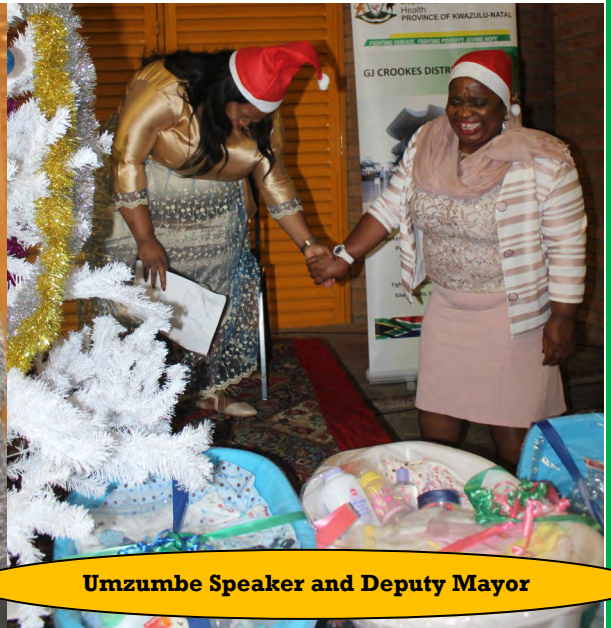
Umzumbe Speaker and Deputy Mayor