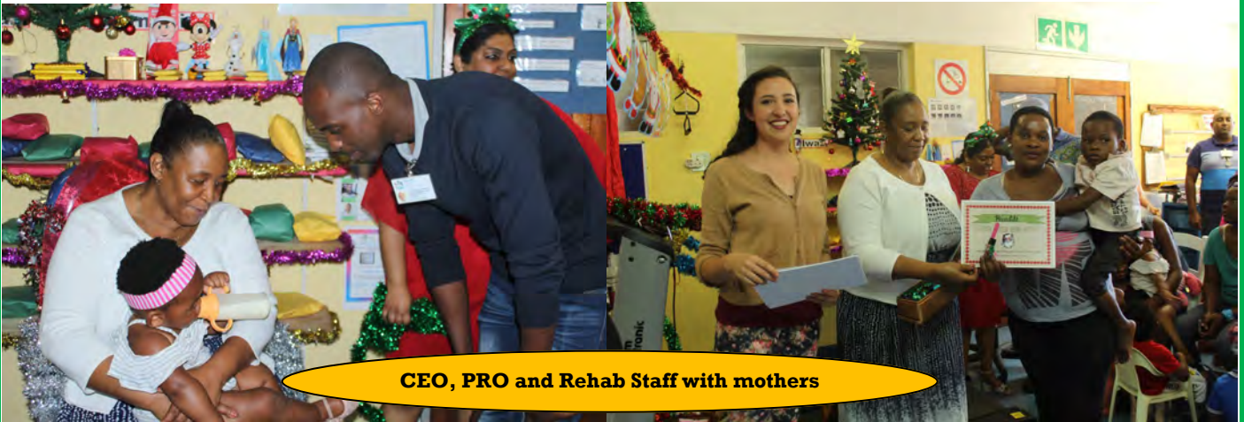
CEO, PRO and Rehab Staff with mothers

On the 8th of December 2017 the Rehab team which consists of Physiotherapy, Occupational Therapy, Speech Therapy, and Psychologist held a Christmas Cheer for Children with Cerebral Palsy and Down Syndrome. This was a day where children were coming to get special treatment and to thank all the mothers for the good work they do with the children and always looking after them.