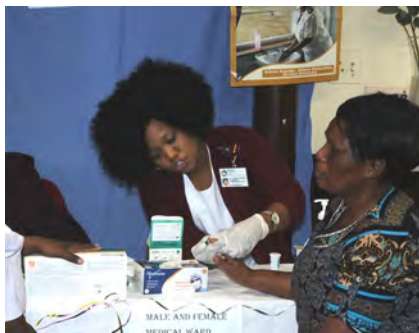
Open Day Event.....