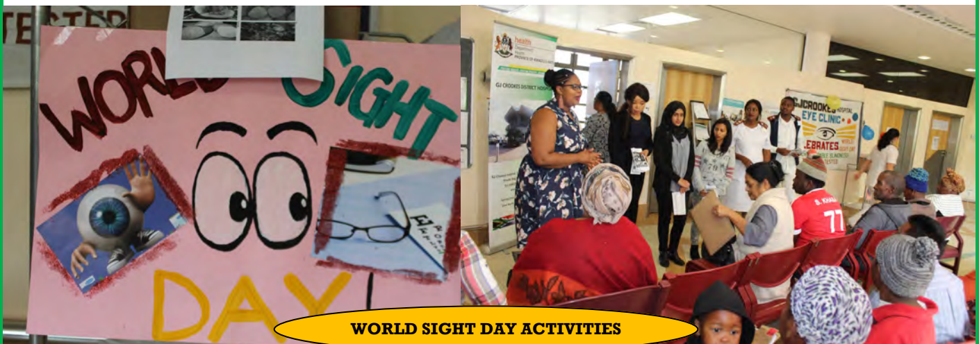
WORLD SIGHT DAY ACTIVITIES