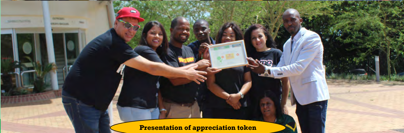
Presentation of appreciation token