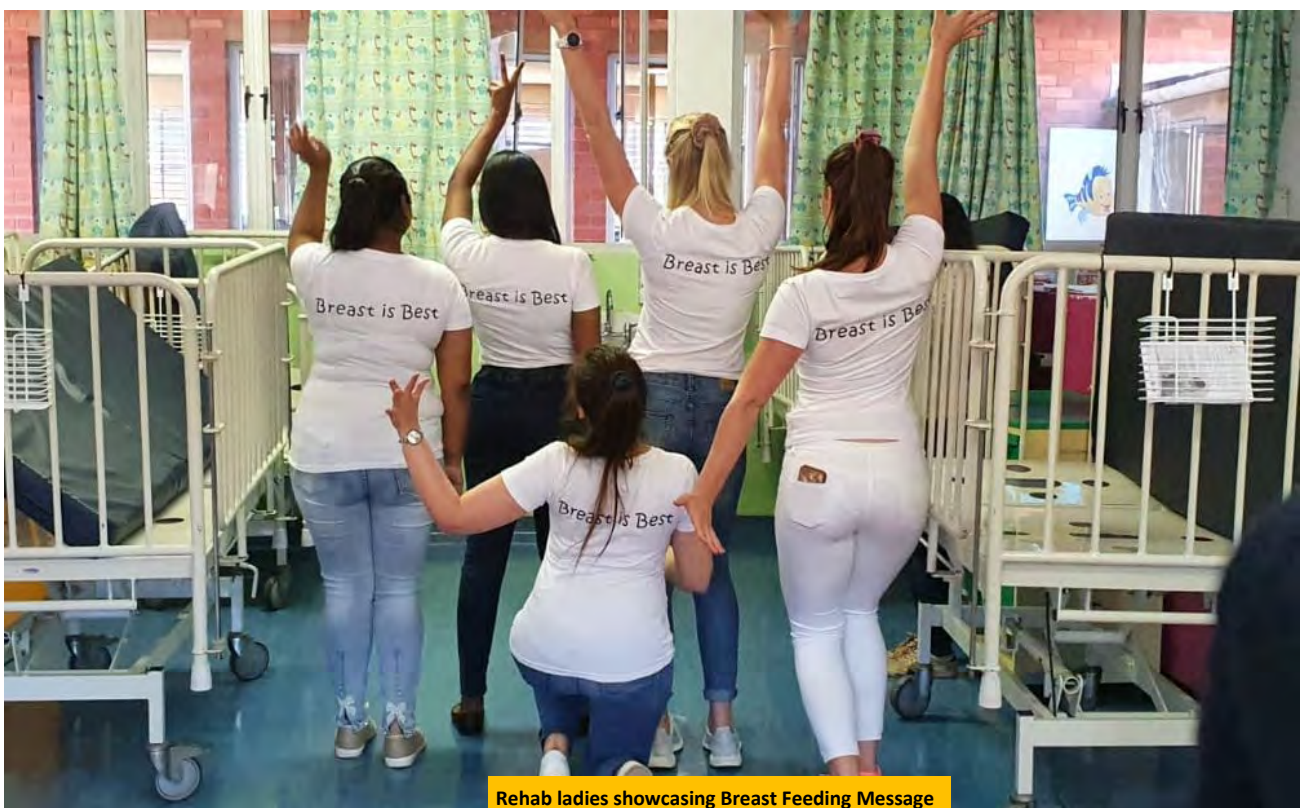
Rehab ladies showcasing Breast Feeding Message

The promotion on breastfeeding via the Televisions at OPD, POPD, Maternity and H-ward using the digital health education videos was on: - Breastfeeding; Complimentary feeding; Grow great; The Road to health Booklet; Covid-19 hygiene precautions.