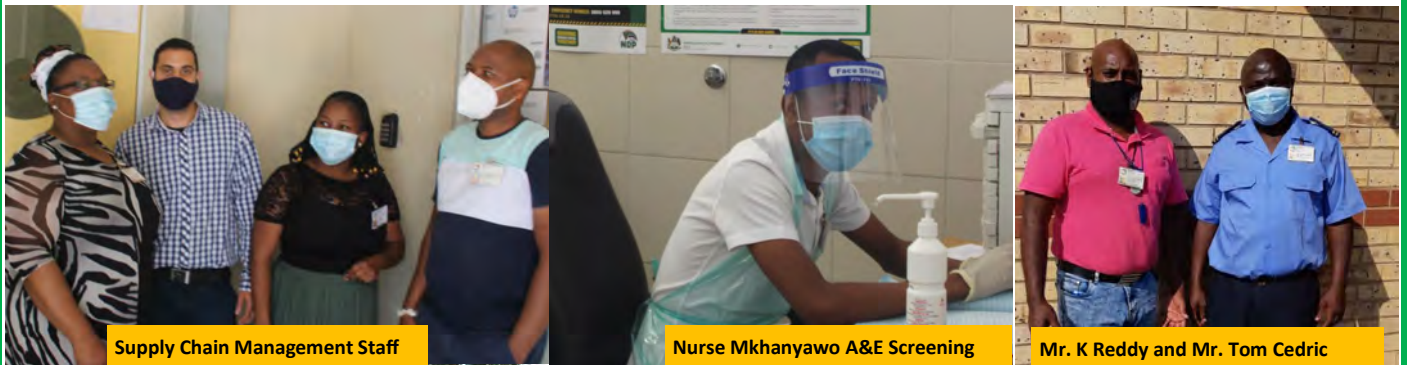
Supply Chain Management Staff