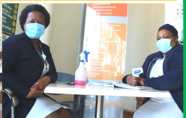
Appreciation to Staff by Senior Management READ MORE ON PAGE 03