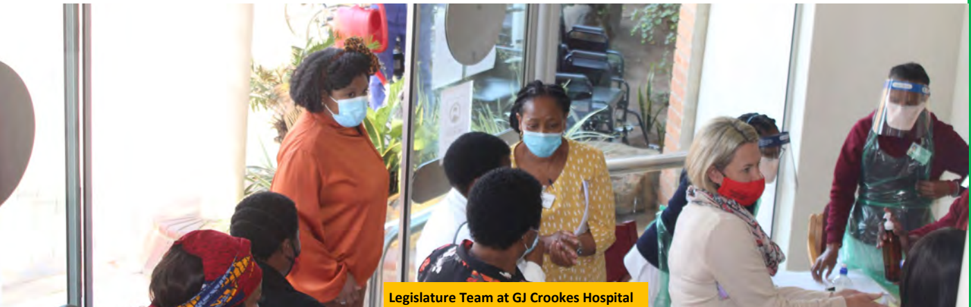
Legislature Team at GJ Crookes Hospital

The purpose was to ensure that all health care facilities are compliant with Covid-19 Guidelines and protocols. The team was Welcomed by Ugu District Director and CEO for GJ Crookes Hospital on the 26th of June 2020, they were addressed on the current status and progress on construction and activities regarding Covid-19 and took a walkabout around the institution and to the isolation wards being constructed.