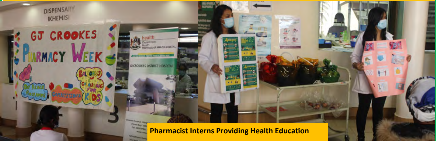
Pharmacist Interns Providing Health Education

On the 18th of September 2020, pharmacy month was only celebrated internally at Out Patients Department and Pediatrics ward due to the Covid-19 Pandemic. Patient contact was minimized to prevent exposure and spread of the disease. The South African Pharmacy Council (SACP) had cancelled Pharmacy Month for 2020.