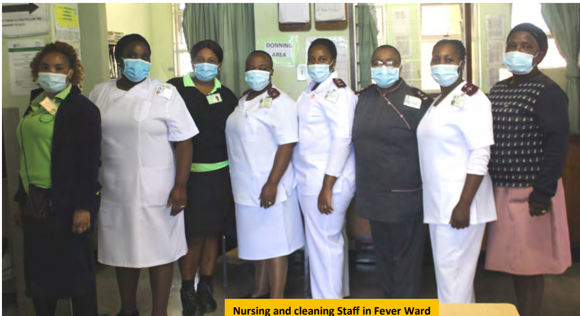
Nursing and cleaning Staff in Fever Ward