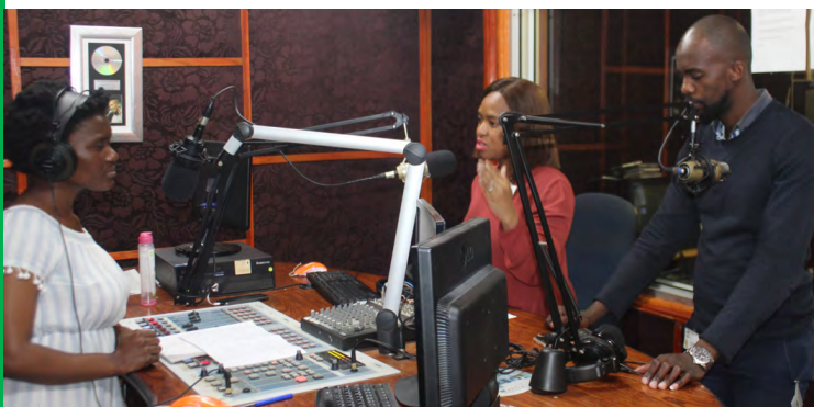
Oral Hygiene Awareness Month READ MORE ON PAGE 07