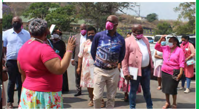
Pink Drive with Deputy Minister for DSD READ MORE ON PAGE 09