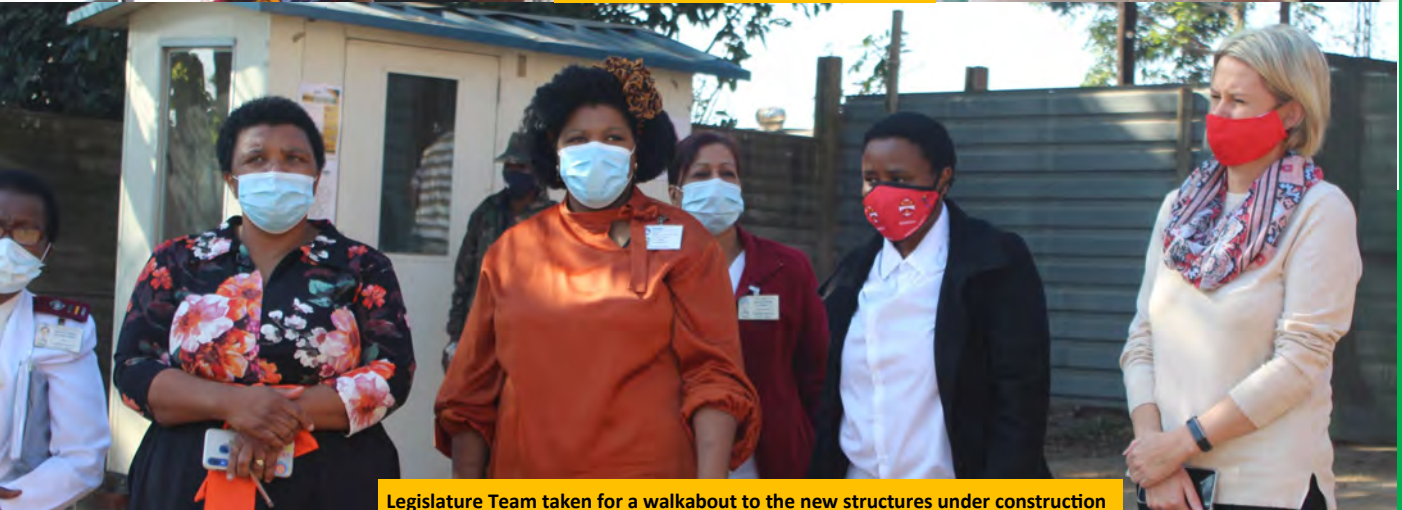
Legislature Team taken for a walkabout to the new structures under construction