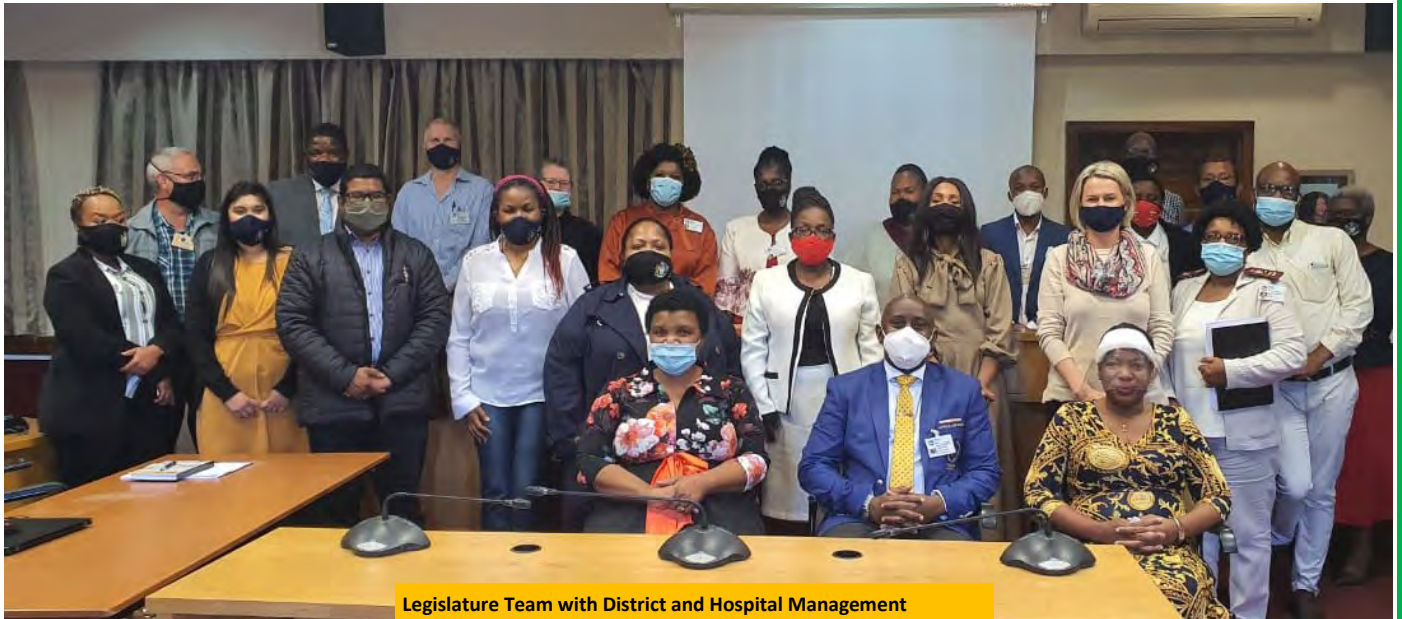
Legislature Team with District and Hospital Management

KZN Legislature embarked on oversight inspections at health institutions as part of the Provincial Legislature Health Visits.