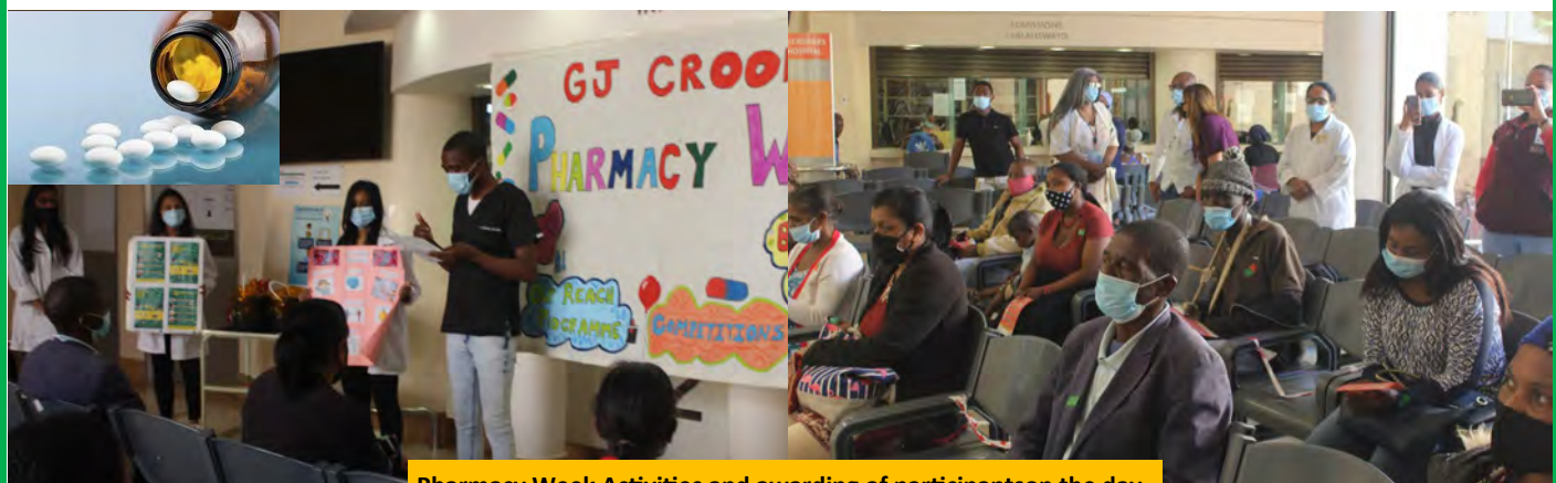
Pharmacy Week Activities and awarding of participantson the day

In keeping with tradition in G.J. Crookes Pharmacy, the interns prepared hampers for the patients presents at the talk. Questions were asked and patients were given these hampers as prizes. Apples were also given to the pediatric ward. Kindly note all Covid 19 protocols were observed during the entire process.