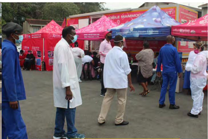
Clients lining for services on the day