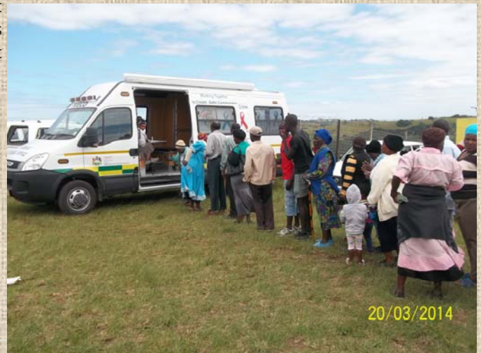
Mistake farm Residents, lining for TB and HIV Testing

was said that Tuberculosis is curable and preventable, but if untreated, it may cause death. TB is spread from person to person through air when a person with lung TB is coughing or sneezing without covering the mouth. People with HIV are most likely to get TB.