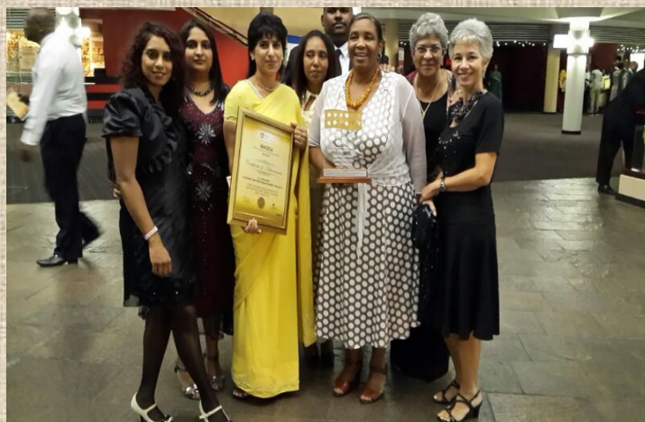
GJ Crookes Pharmacy's Chronic Medicine Project was awarded a gold award for outstanding achievement, for innovation and best practice.