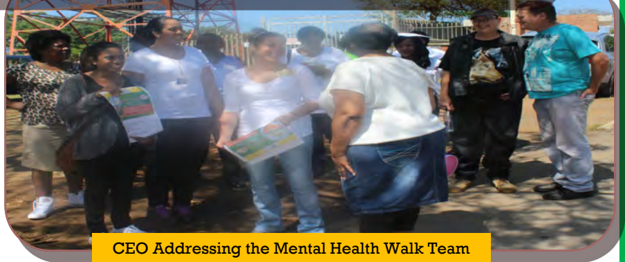
CEO Addressing the Mental Health Walk Team