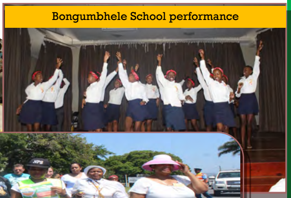
Bongumbhele School performance