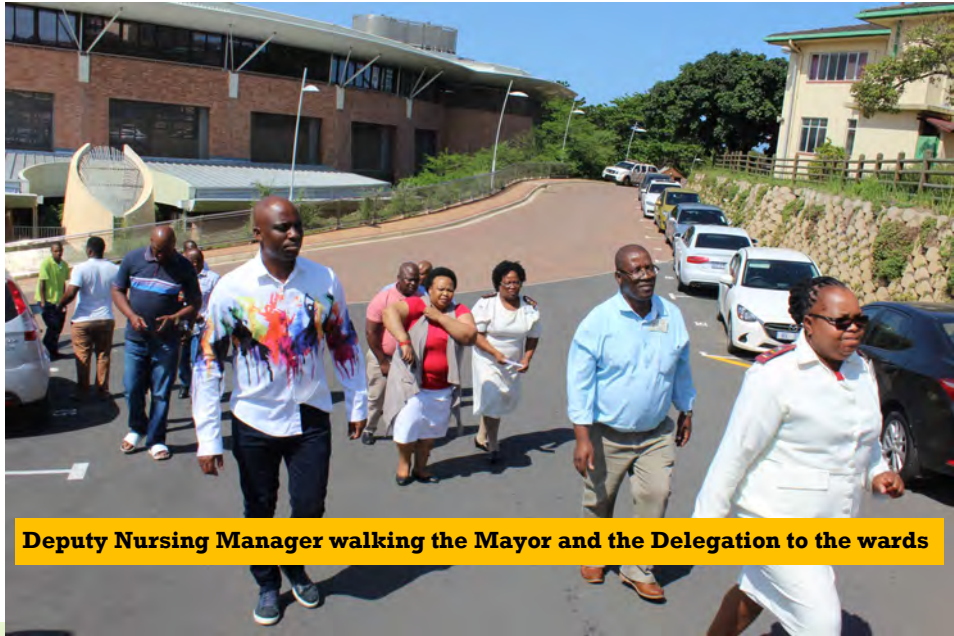
Deputy Nursing Manager walking the Mayor and the Delegation to the wards