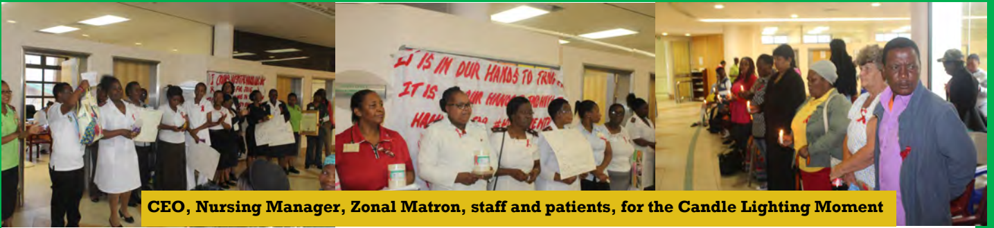
CEO, Nursing Manager, Zonal Matron, staff and patients, for the Candle Lighting Moment