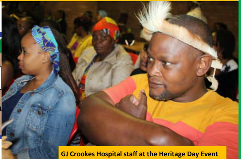
GJ Crookes Hospital staff at the Heritage Day Event

On the 25th of September 2019 GJ Crookes Hospital Wellness Committee held a Heritage Day Event for the staff of GJ Crookes Hospital. The program was directed by the Hospital PRO Mr. TM Mbanjwa and Nurse NBM Mkhize. The staff gathered on this day wearing different garments representing their tribes and tradition.