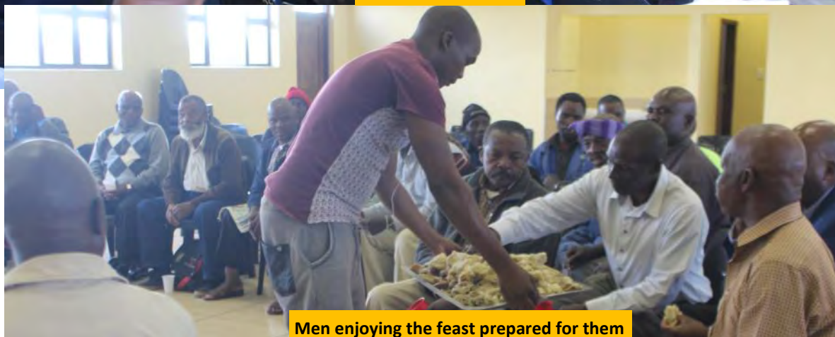
Men enjoying the feast prepared for them