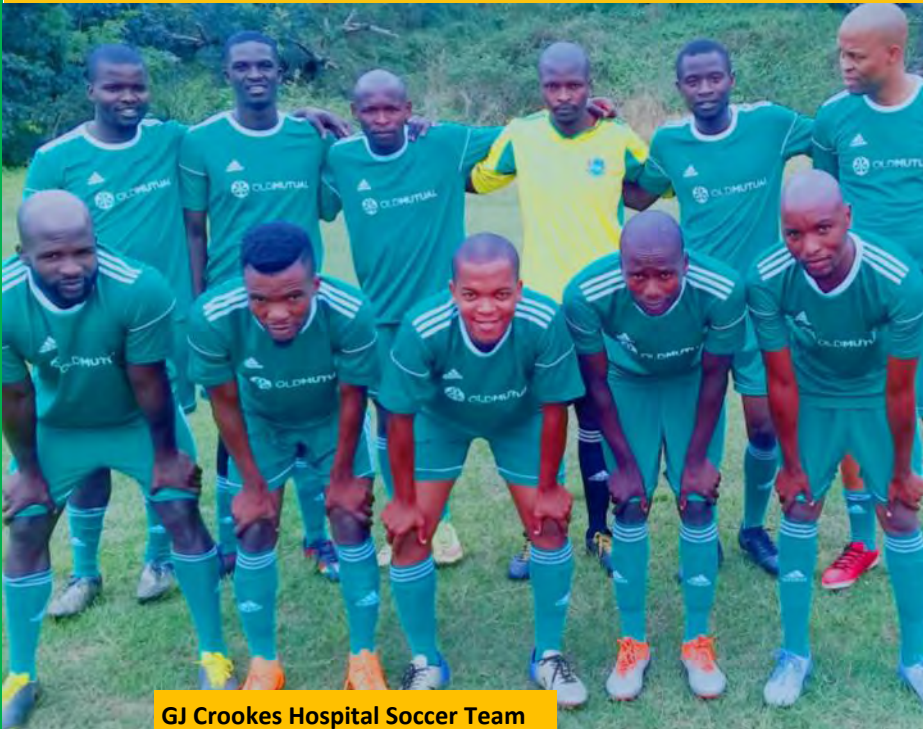
GJ Crookes Hospital Soccer Team