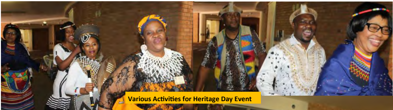
Various Activities for Heritage Day Event