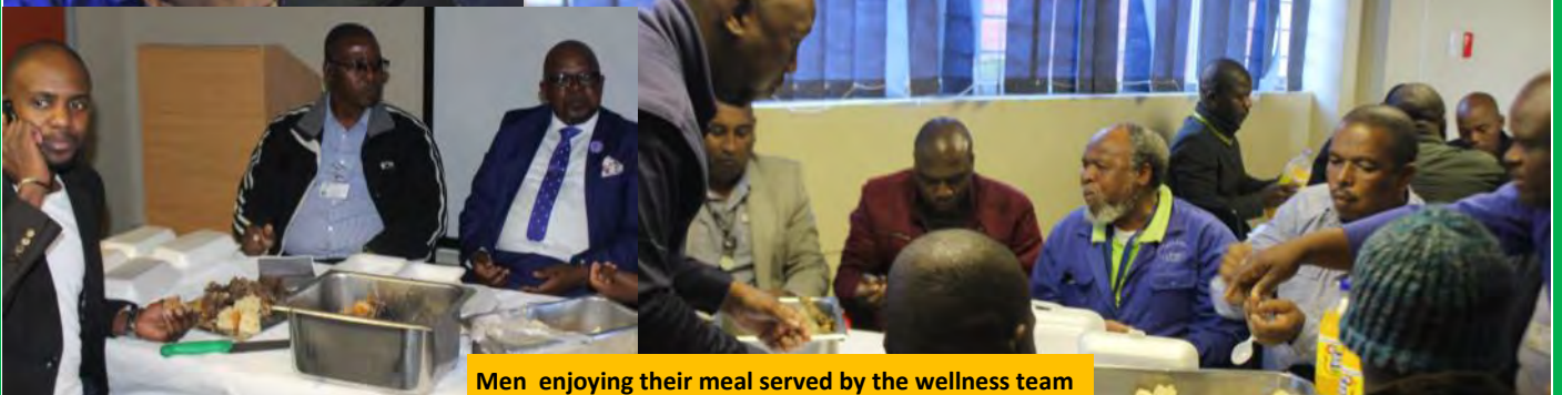
Men enjoying their meal served by the wellness team