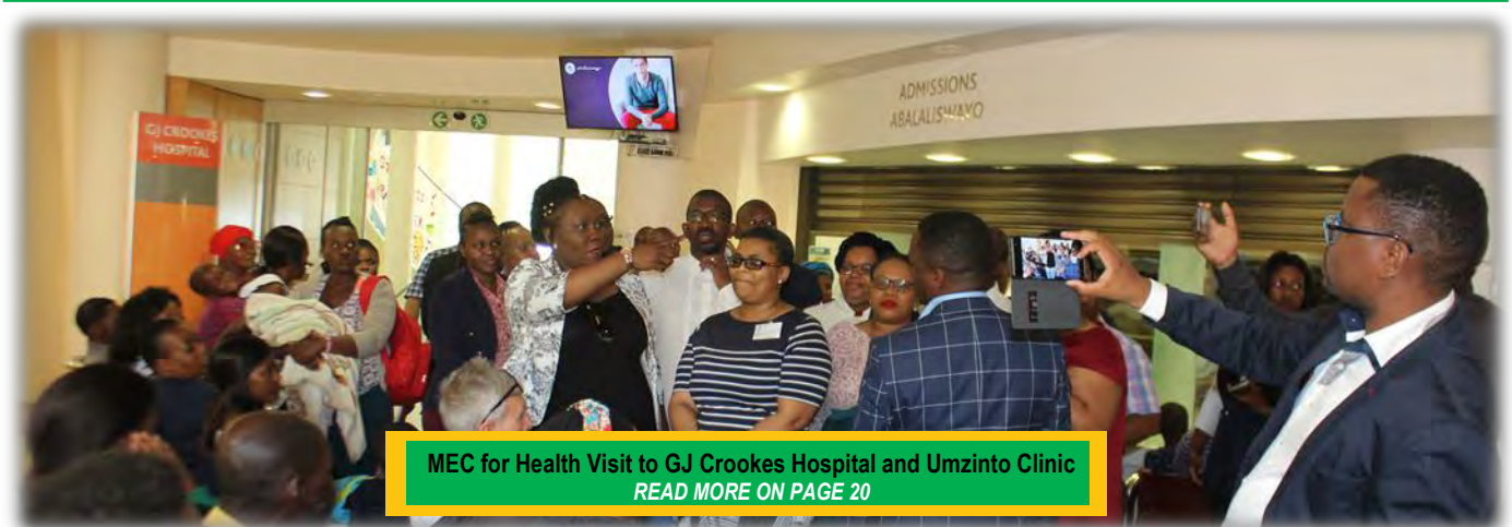
MEC for Health Visit to GJ Crookes Hospital and Umzinto Clinic READ MORE ON PAGE 20