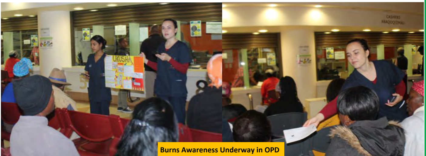
Burns Awareness Underway in OPD

1) To create an informative poster including information on causes of burns, preventative measures to avoid burns, types of burns and initial management when one does acquire a burn; 2) To produce a large amount of fliers which can be taken off the poster (These containing brief but impactful information on preventing burns as well as initial management); 3) To present the information numerous times throughout the OPD in GJ Crookes Hospital; 4) To distribute fliers to those who wish to have the information on hand and 5) To leave the informative poster up in the OPD for patients who are waiting/community members who walk past it to read. The physiotherapy students presented the information numerous times throughout the OPD in GJ Crookes Hospital. The audience was very enthusiastic and appreciated the information and education.