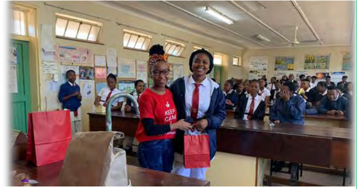
Pharmacy Month.... READ MORE ON PAGE 18