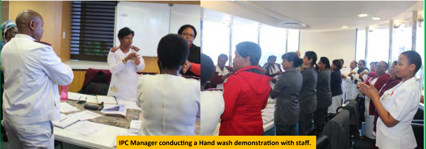
IPC Manager conducting a Hand wash demonstration with staff.