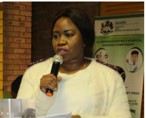
Mrs Muthwa leading the reading of the nurses pledge