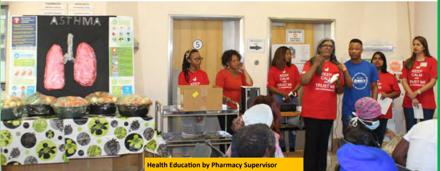
Health Education by Pharmacy Supervisor

September is celebration of Pharmacy as a profession and GJ Crookes Hospital Pharmacy takes this opportunity yearly to showcase pharmacy as a practice to the community and assist patients in educating them on disease conditions and their medication. In preparation for pharmacy month, sponsorships were requested from various pharmaceutical companies and local businesses and fund raising activities were conducted throughout the year. Activities for the month included two visits to the community of UMDoni and talks within the hospital weekly on the common diseases encountered in the community. The last week of the month was reserved for a surprise party in the paediatric ward marking the end of this year's Pharmacy Month!!