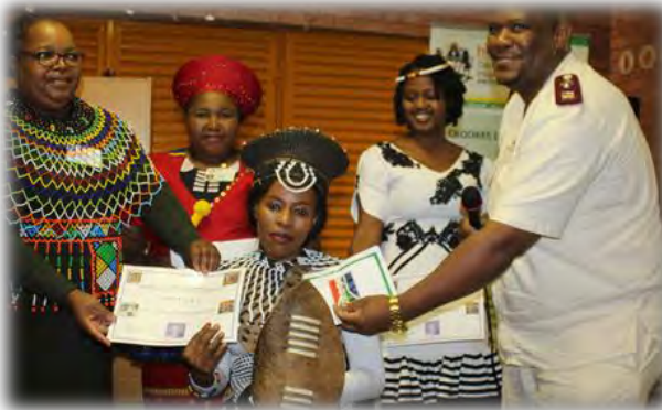
Heritage Day Celebration READ MORE ON PAGE 22