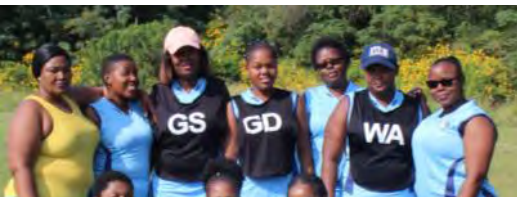
GJ Crookes Hospital Netball Team

A final took place between GJ Crookes Hospital and Turton CHC where Turton Won by 2-1 leaving Turton CHC as the Wellness Champions for the GJ Crookes Wellness Games of 2019. In Netball Gamalakhe CHC became No.3, GJ Crookes Hospital was No.2 and Murchison became the champions in Netball for the 2019 Wellness Games. The GJ Crookes Hospital would like to thank all the sponsors who helped for this event to be a success.