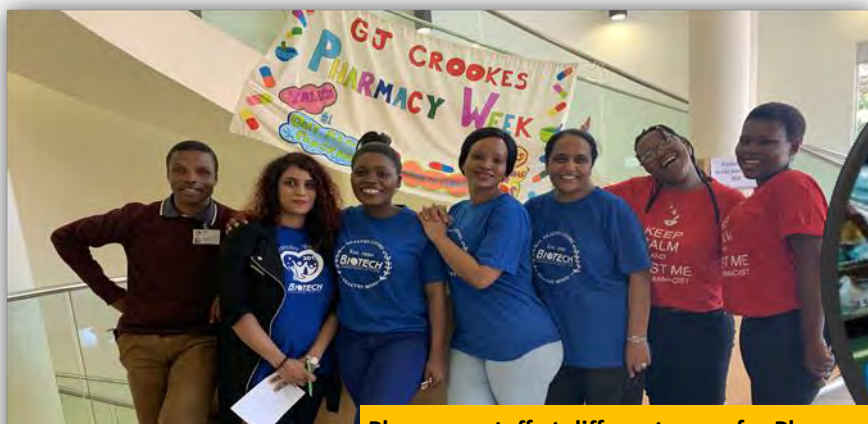
Pharmacy staff at different areas for Pharmacy Month awareness

September is celebration of Pharmacy as a profession and GJ Crookes Hospital Pharmacy takes this opportunity yearly to showcase pharmacy as a practice to the community and assist patients in educating them on disease conditions and their medication. In preparation for pharmacy month, sponsorships were requested from various pharmaceutical companies and local businesses and fund raising activities were conducted throughout the year. Activities for the month included two visits to the community of UMDoni and talks within the hospital weekly on the common diseases encountered in the community. The last week of the month was reserved for a surprise party in the paediatric ward marking the end of this year's Pharmacy Month!!