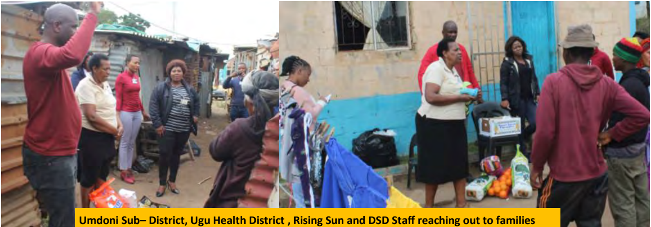
Umdoni Sub– District, Ugu Health District , Rising Sun and DSD Staff reaching out to families

“By giving a little of your time each day to making a change that’s close to your heart or by giving a little of your time to make a difference to the life of someone else, you can start changing the world around you” #Make everyday a Mandela Day . This is what the staff of GJ Crookes Hospital were doing on the 12th of September 2019 where the Ugu District TB Coordinator and staff, with Umdoni Health Sub-District and Department of Social Development went to the residents of Malangeni that are clients of TB Clinic to offer health education for them and their families. The families were also given food parcels.