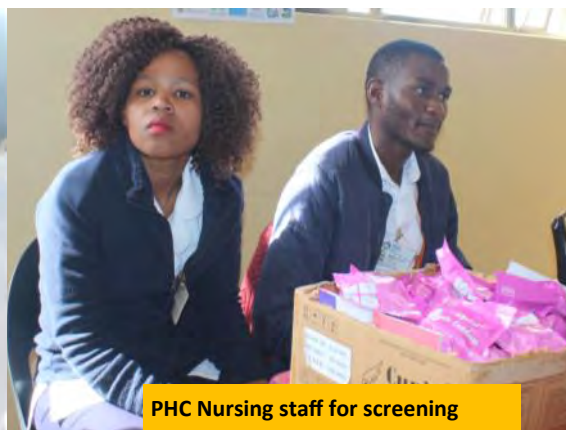
PHC Nursing staff for screening