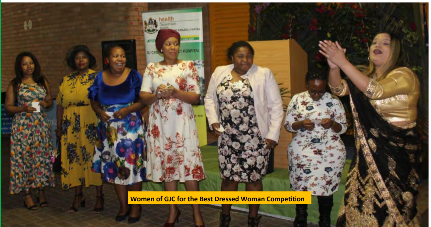
Women of GJC for the Best Dressed Woman Competition