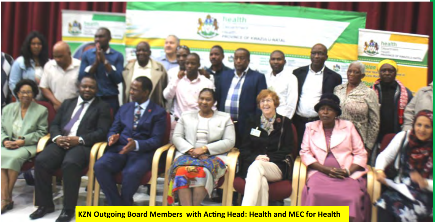
KZN Outgoing Board Members with Acting Head: Health and MEC for Health