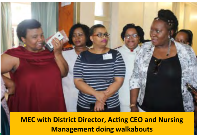
MEC with District Director, Acting CEO and Nursing Management doing walkabouts