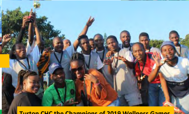
Turton CHC the Champions of 2019 Wellness Games