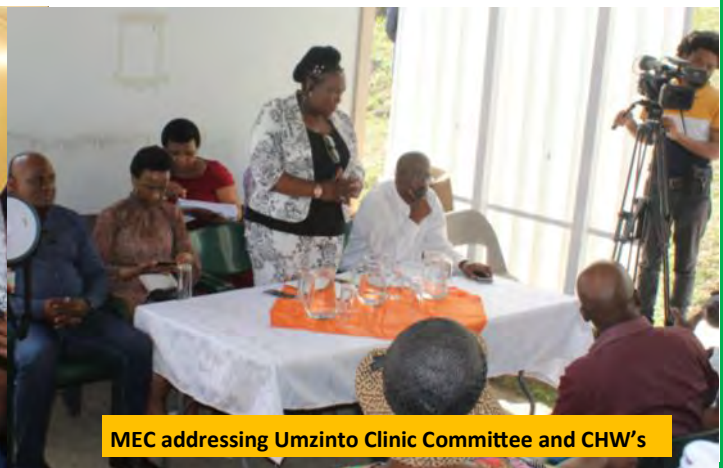
MEC addressing Umzinto Clinic Committee and CHW's