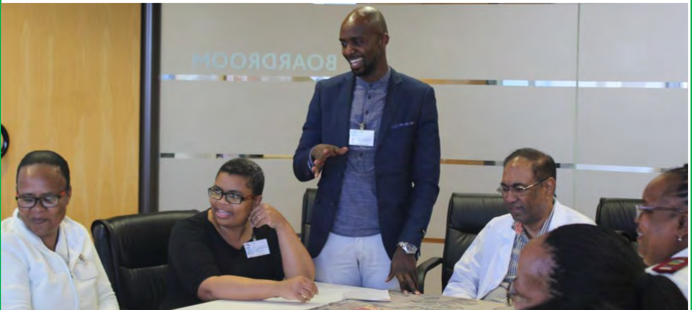
Heads of Departments giving their individual farewell messages to the outgoing colleagues