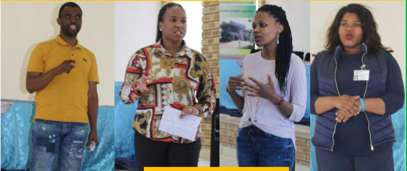
Health Talks given by Dental and Nursing staff

On the 16th and the 23rd of August, the Dental department held a Zero Cavity Awareness Campaign for Dududu and Mgangeni communities. The aim behind the awareness was to stress the importance of oral health amongst these communities. Both these areas have the privilege of dental services (Extractions) which are brought to them every Monday and Thursday.