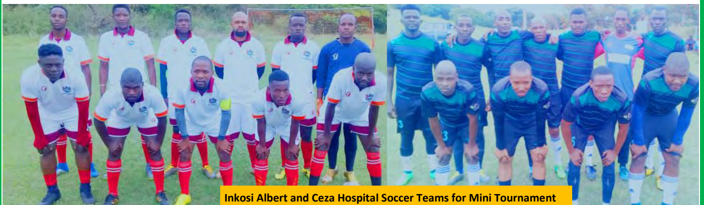
Inkosi Albert and Ceza Hospital Soccer Teams for Mini Tournament

The teams were thanked for their participation and involvement. Metropolitan was also thanked for sponsoring the games and supporting the practice of healthy lifestyles.