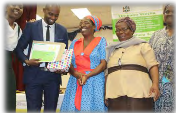
Stakeholder Awards Ceremony READ MORE ON PAGE 03