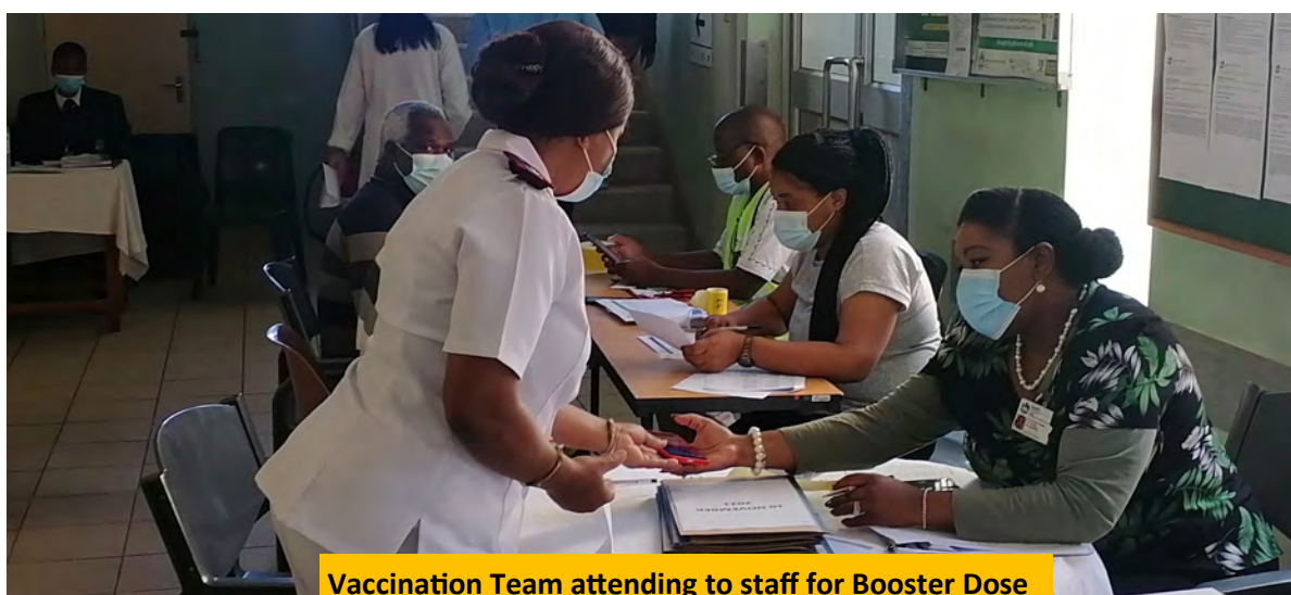
Vaccination Team attending to staff for Booster Dose

The Covid-19 booster rollout provided additional protection against severe Covid-19 disease and death. The management of GJ Crookes Hospital dedicated two weeks of Booster administration for staff, forensics, EMRS and private practitioners. Thereafter the Boosters were administered as per the community rollout.