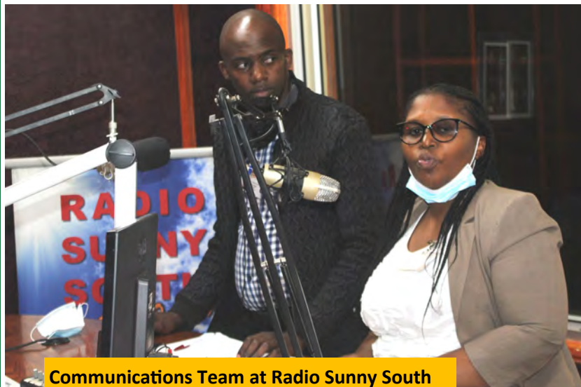
Communications Team at Radio Sunny South

On the 14 and 30th of September 2021, G.J Crookes Hospital PRO and Ugu District Communications conducted a public awareness campaigns on Covid-19 Vaccination through interviews with the Ugu Youth Radio and Radio Sunny South to reach a wide number of audiences about the importance of taking the Covid-19 vaccine.