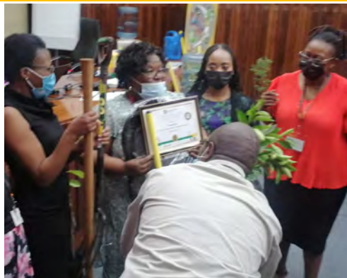
Green Awards: Page 20