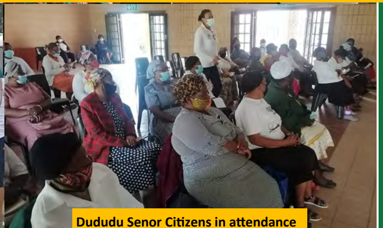
Dududu Senior Citizens in attendance