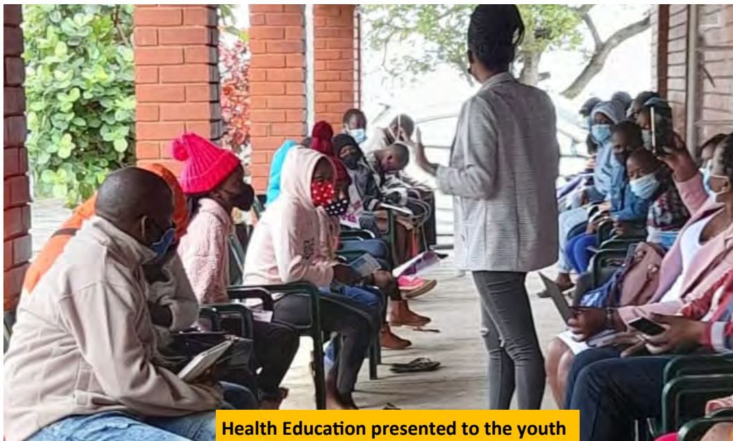
Health Education presented to the youth