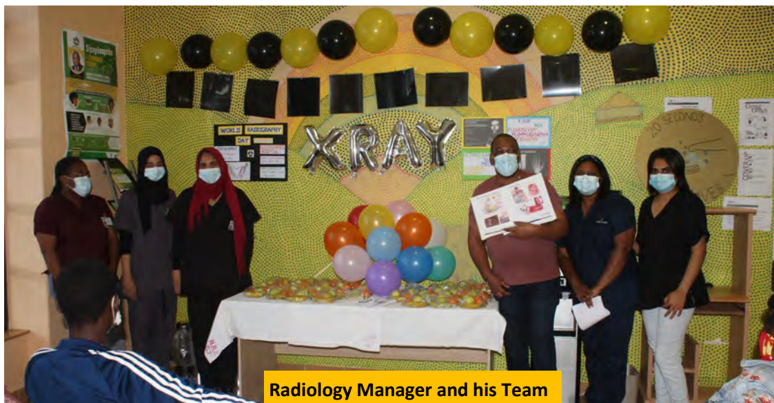
Radiology Manager and his Team