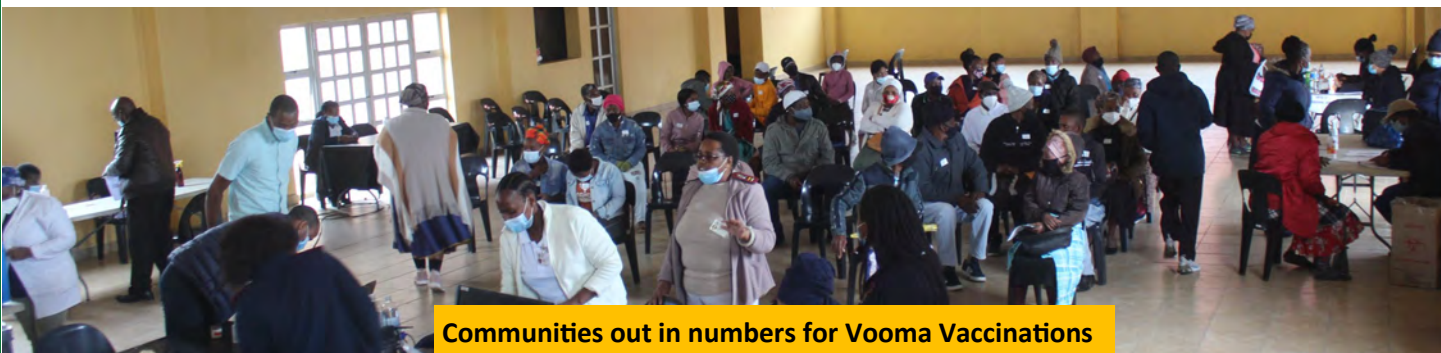
Communities out in numbers for Vooma Vaccinations

The community was advised of the Vooma Vaccination weekends as initiated by the president so as to ensure that people who are not available during the week have an opportunity of getting their vaccination during the weekends. For Umdoni Sub-district, Vooma vaccinations were commenced from the 4th of October to the 6th of October 2021 at Bremer Hall, Malangeni Hall, and Dumayo Hall. The turnout to the Vooma weekend was amazing as scores of people came in numbers some to receive their second doses of the Pfizer vaccine and others to get their first dose.