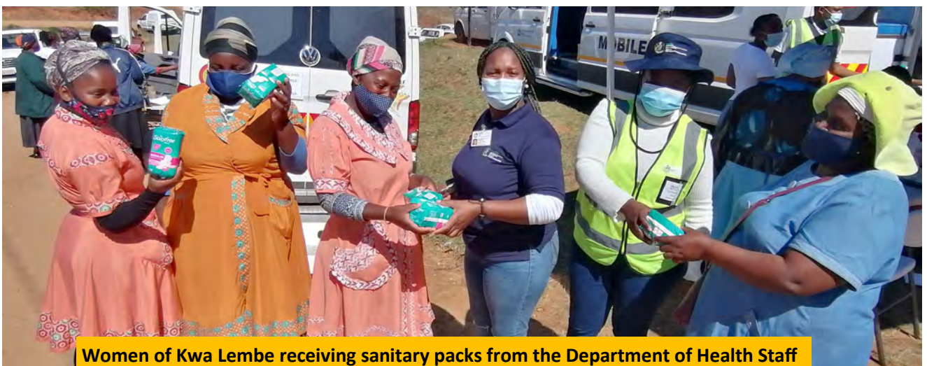
Women of Kwa Lembe receiving sanitary packs from the Department of Health Staff