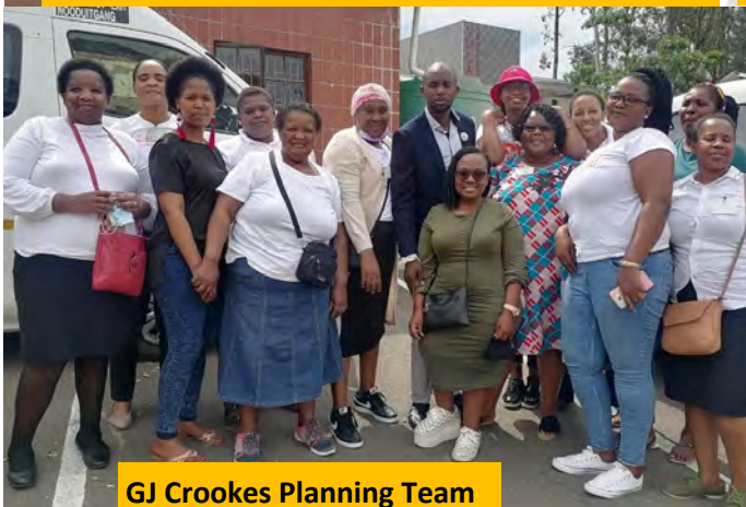
GJ Crookes Planning Team