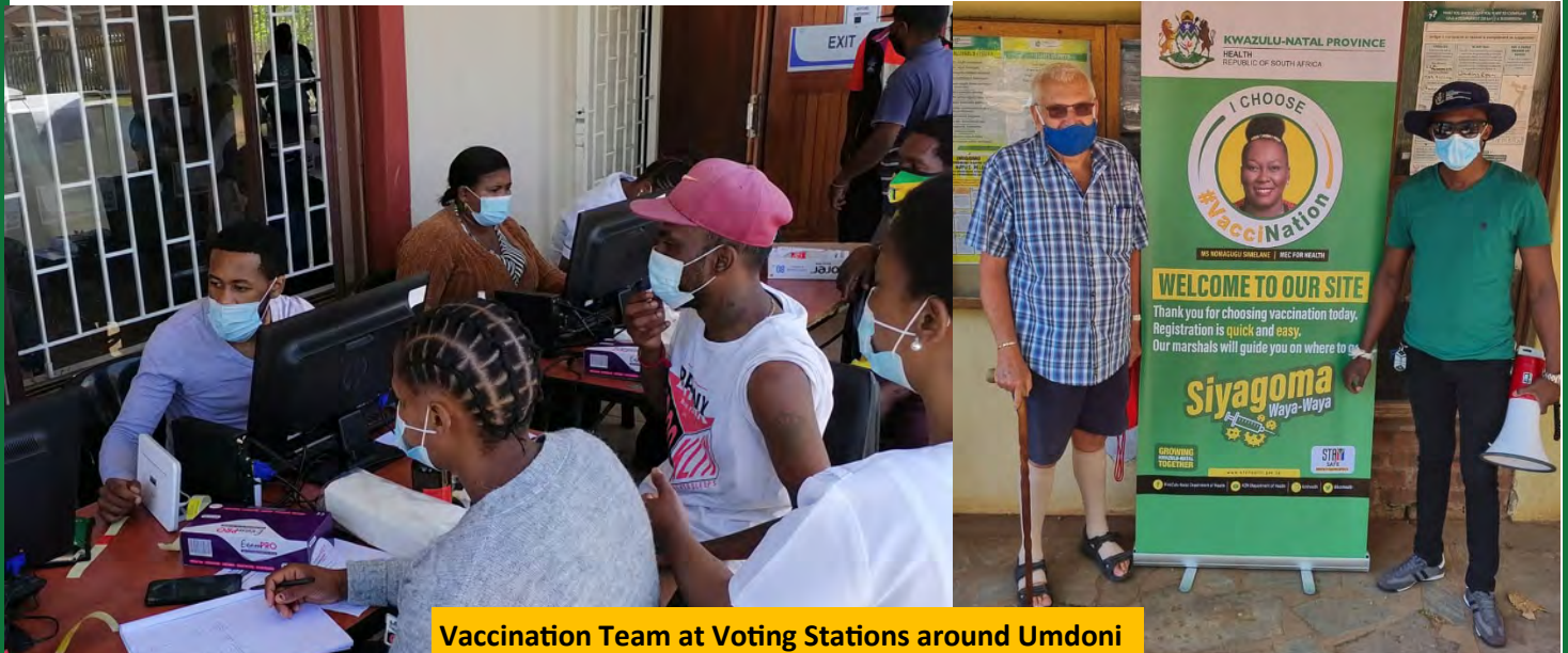
Vaccination Team at Voting Stations around Umdoni

On the 1st of November 2021 the communities of Umdoni went out in their numbers to cast their vote and the department of Health was also present in most voting stations to administer Vaccinations after the citizens had casted their votes. Campaigns like the Vooma Vaccination Weekend began at the start of October, which opened more sites and enlisted community leaders and faith-based organizations to encourage their followers to get vaccinated.