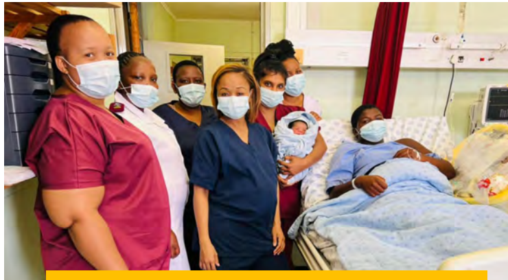
Christmas and New Years Babies: Page 23