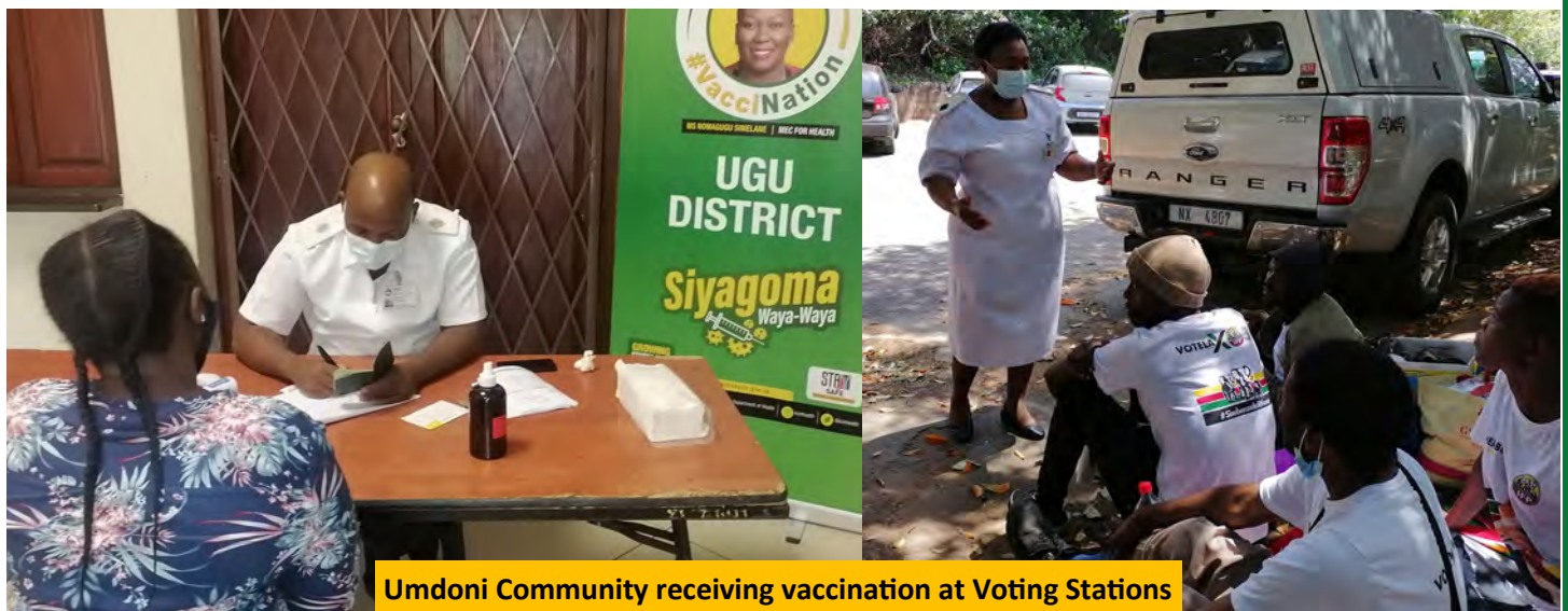
Umdoni Community receiving vaccination at Voting Stations

Minister Joe Phaahla "We hope that this arrangement will offer convenience in that people will have travelled from their homes and they'll can achieve both their vote and vaccination in one trip. We welcome the fact that political parties have no problem with this arrangement". "We thank our health workers who raised their hand to be on duty on this day and thank the IEC authorities for their support and cooperation,"