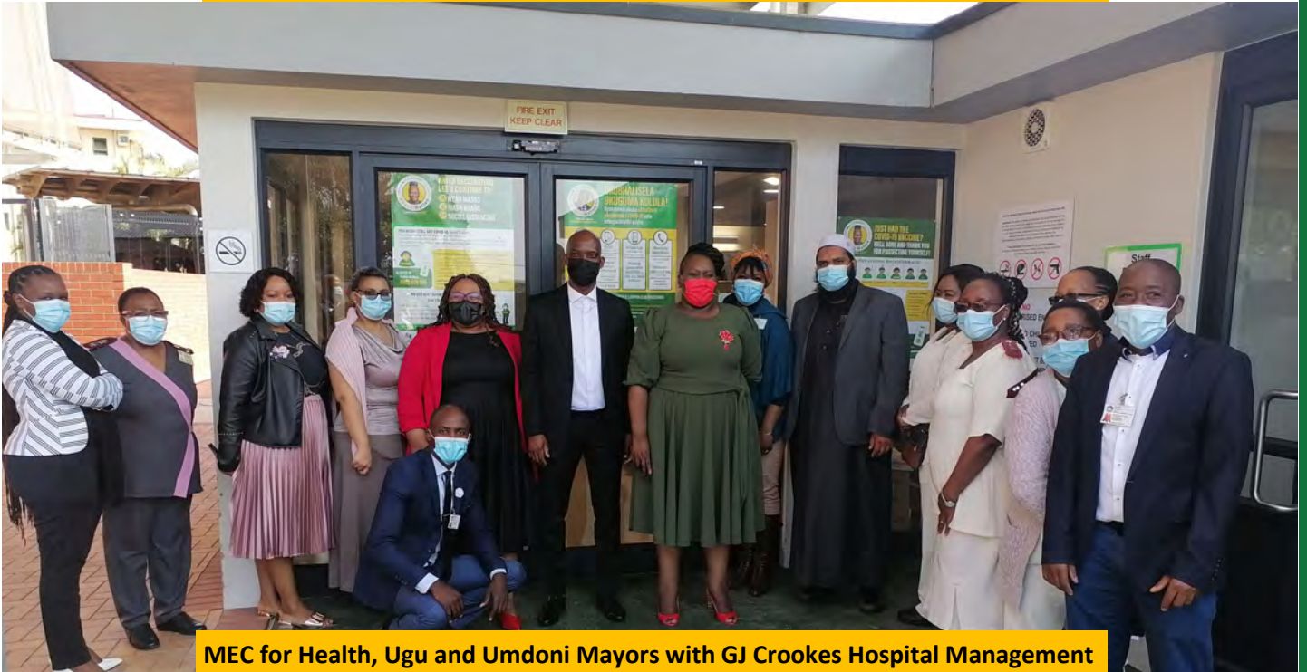
MEC for Health, Ugu and Umdoni Mayors with GJ Crookes Hospital Management

On the 2nd of September 2021 The MEC for health Ms. Nomagugu Simelane officially opened GJ Crookes Hospital's newly constructed 49 bedded Covid-19 isolation unit. "We are very happy with the work that we've seen, as well as the work that our healthcare workers are doing. We've also seen the hospital's vaccination site. We know that they have three within Umdoni; the 2nd one is in Park Rhynie, and the third one is an outreach team.