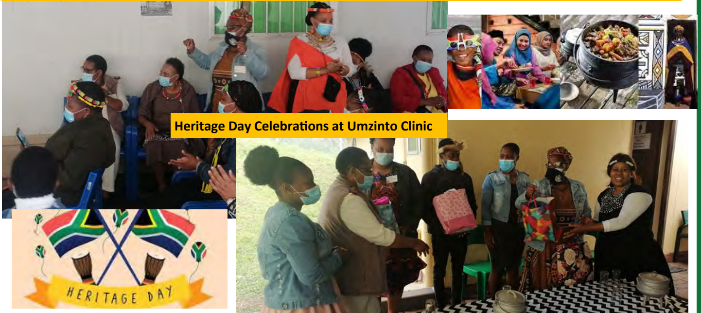
Heritage Day Celebrations at Umzinto Clinic

On the 17th of September 2021 Umzinto Clinic Held a Heritage Day Celebration and appreciation for their EPWP staff who were finishing their contract.