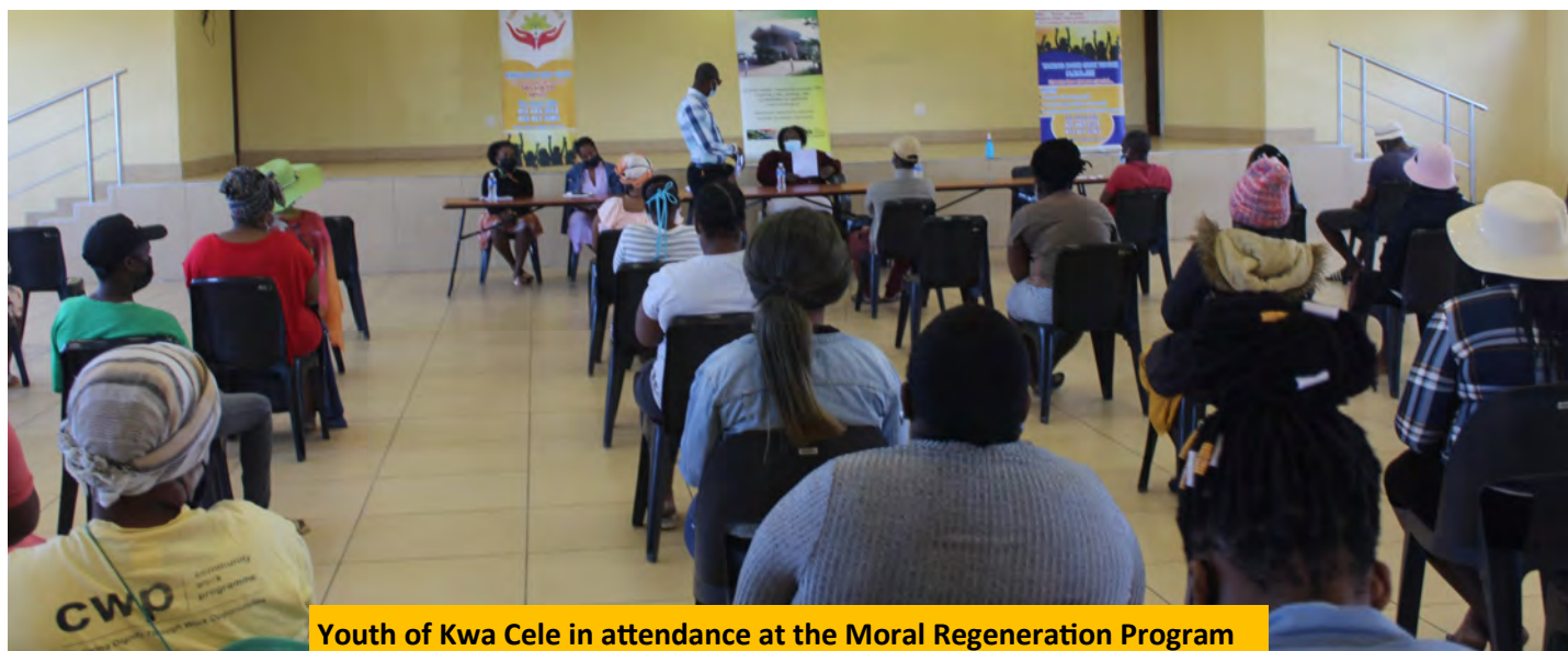
Youth of Kwa Cele in attendance at the Moral Regeneration Program