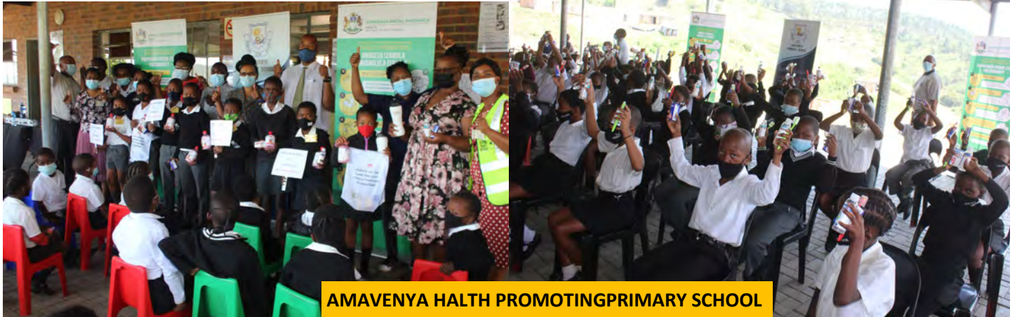
AMAVENYA HALTH PROMOTINGPRIMARY SCHOOL

Global and washing day is an international handwashing promotion campaign to motivate and mobilize people around the world to improve their hand washing habits. Washing hands at critical points especially during the pandemic with soap is important. This day occurred on the 15 th of October each year.