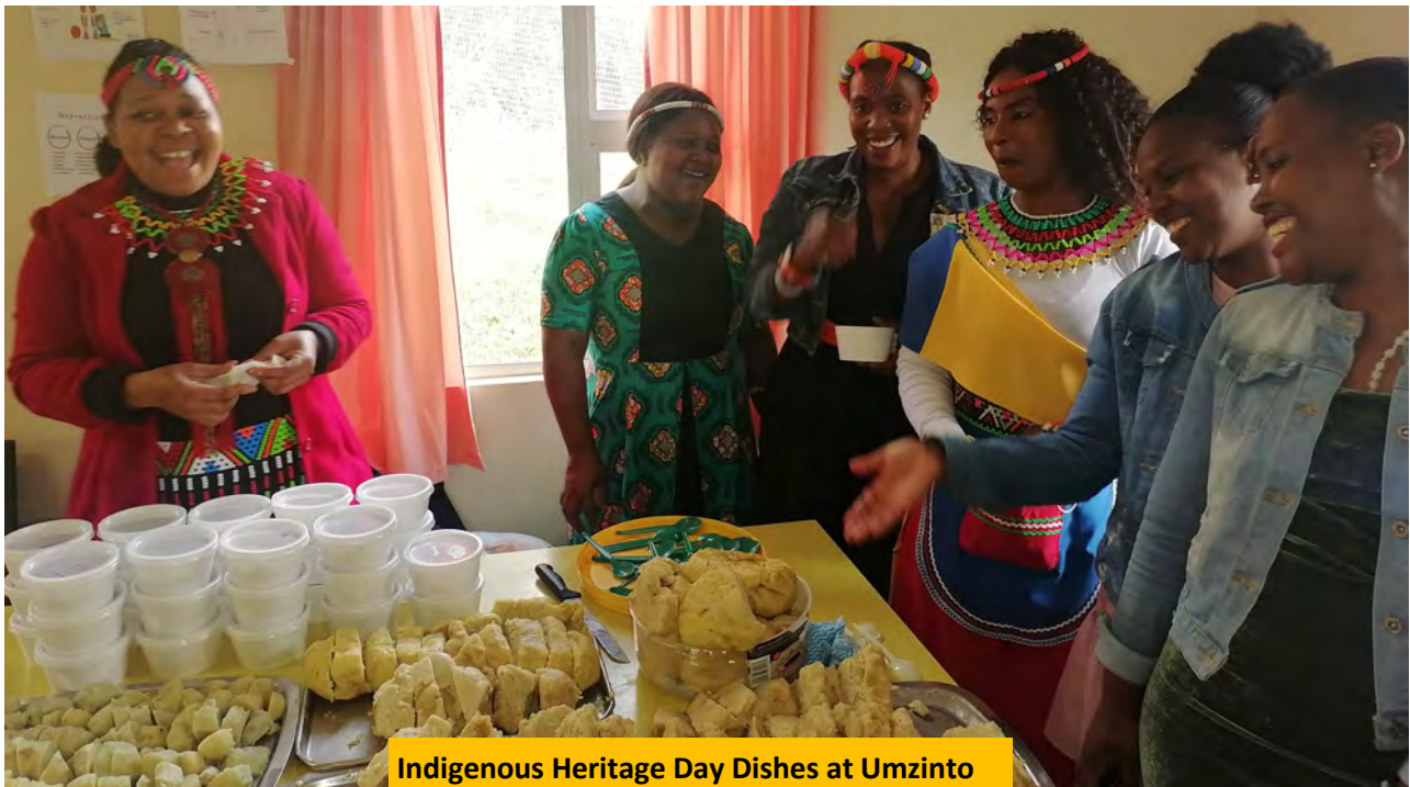
Indigenous Heritage Day Dishes at Umzinto