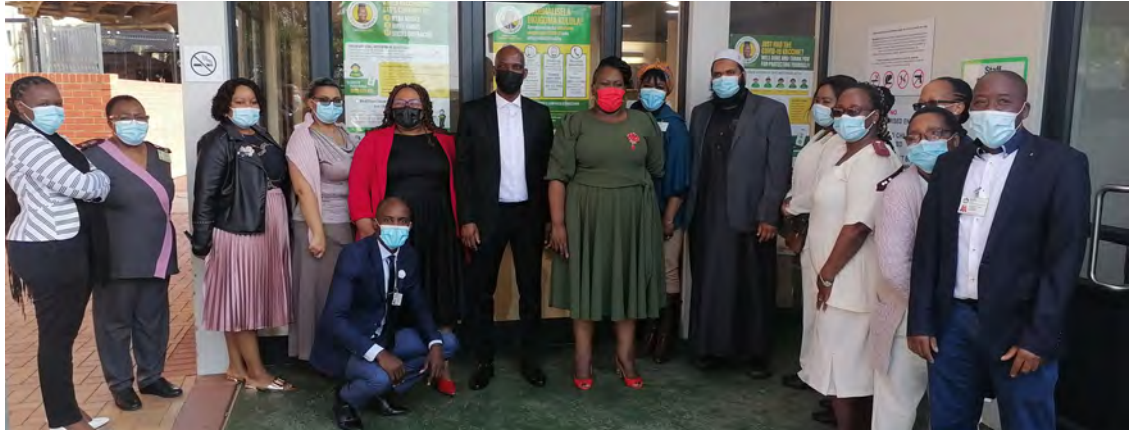
Official Opening of Covid –19 Isolation Wards by MEC for Health: Page 07