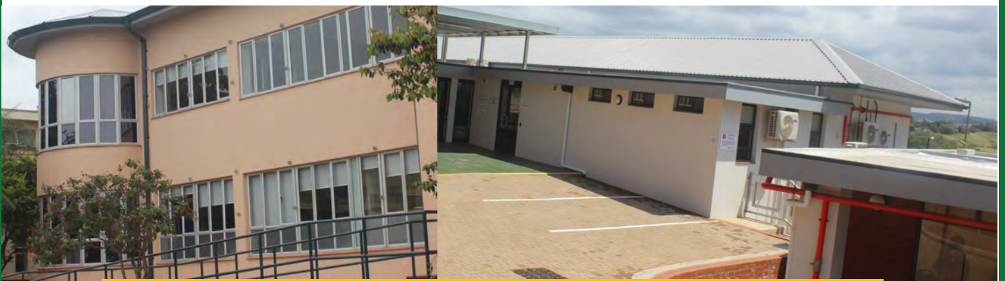
Newly Renovated 84 Bed Covid-19 Isolation Wards Officially Opened by MEC for Health KZN

"The kind of work that is being done here is exciting. We've come to say to the workers, 'Thank you very much; we appreciate your work.'" stated the MEC for Health