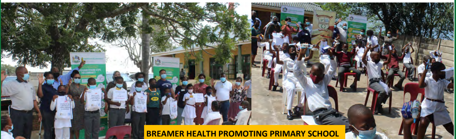
BREAMER HEALTH PROMOTING PRIMARY SCHOOL