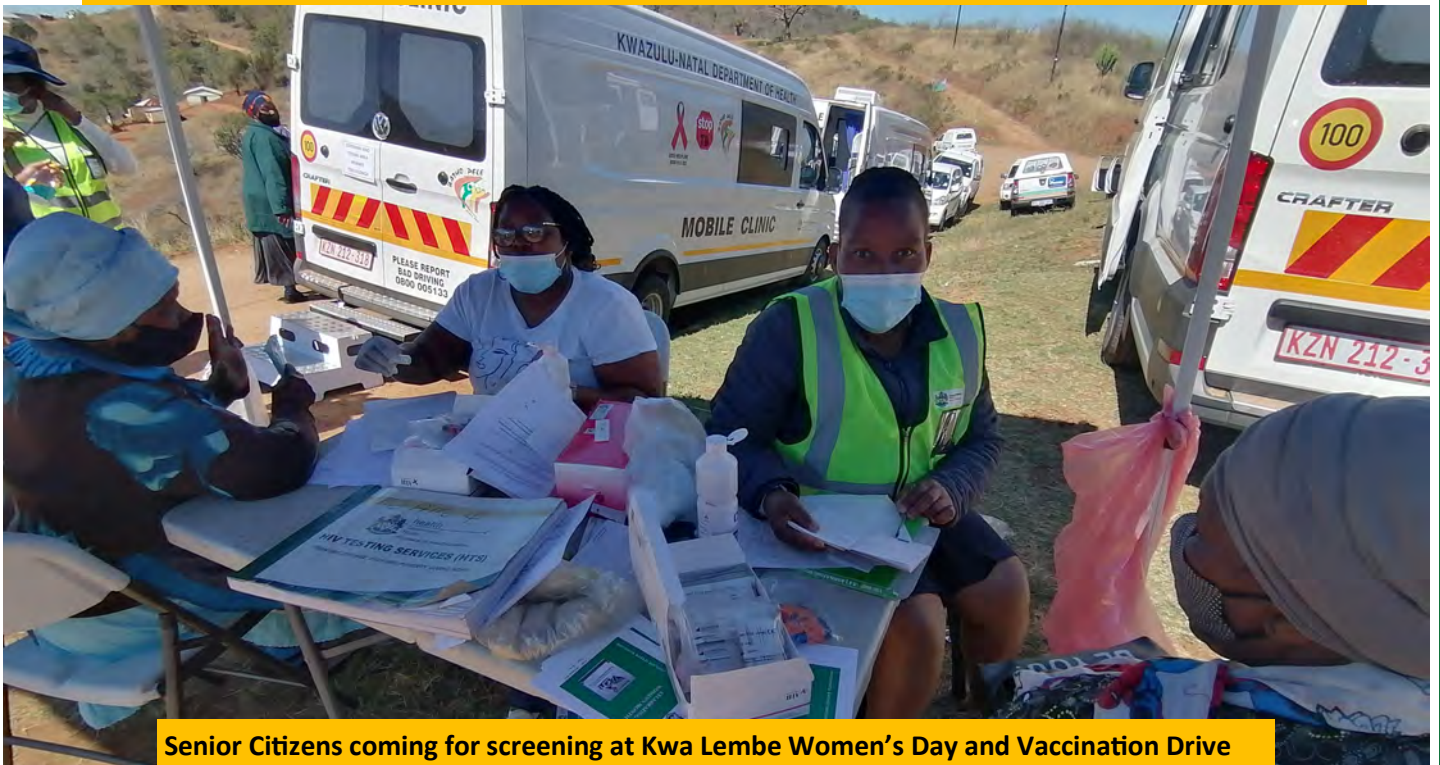
Senior Citizens coming for screening at Kwa Lembe Women's Day and Vaccination Drive