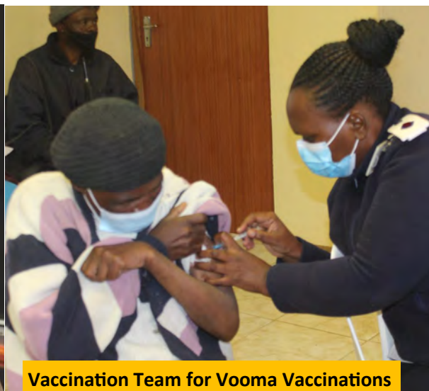
Vaccination Team for Vooma Vaccinations

G.J Crookes Hospital formally promoted its campaign to encourage people to take the Covid-19 vaccine and eradicate conspiracy theories and myths about the vaccine.