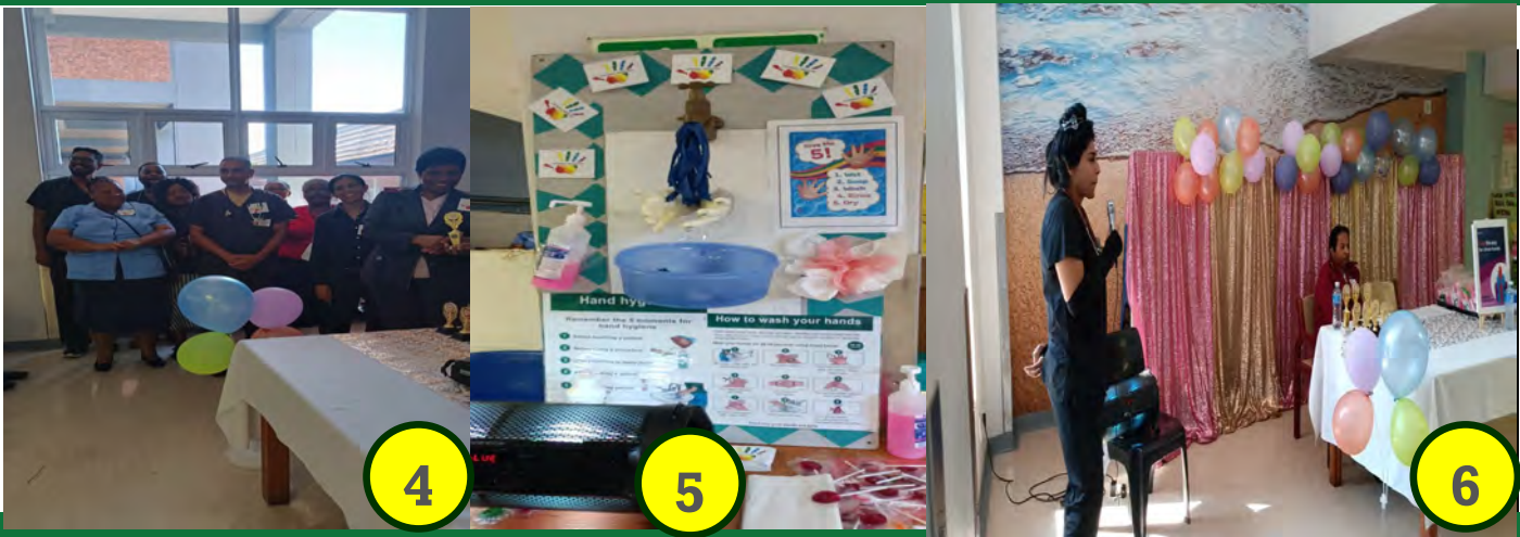
Picture 4: Internal medicine staff led by HCU – Dr Ramjiwan. Picture 5 : demonstration from internal medicine. Picture 3 Dr from internal medicine giving a history of hand hygiene