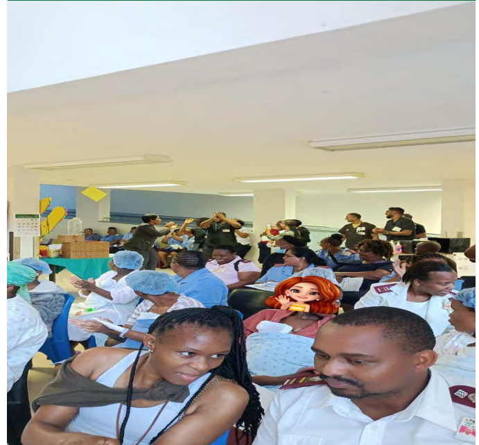
Audience during World Hand Hygiene Day. 10 May 2024