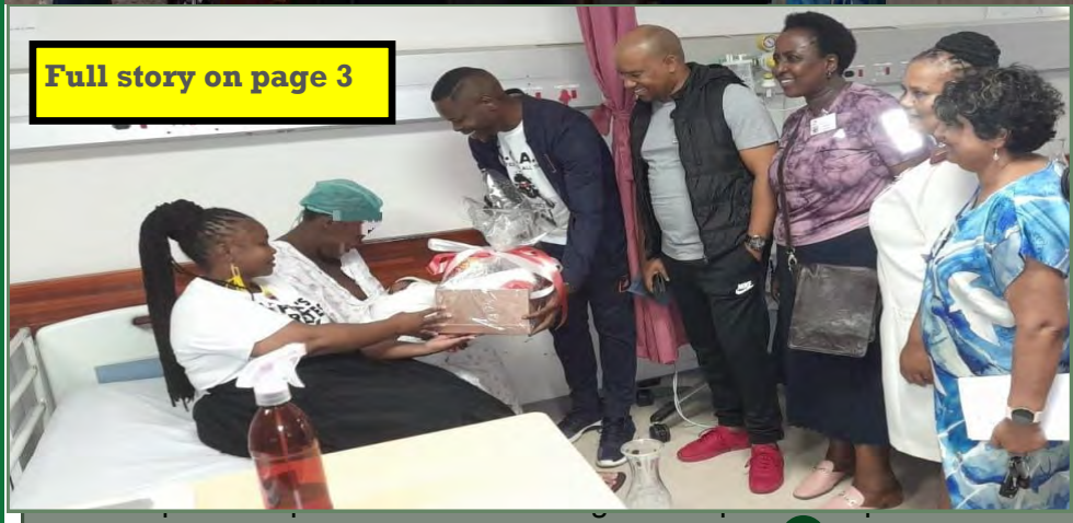
Full story on page 3