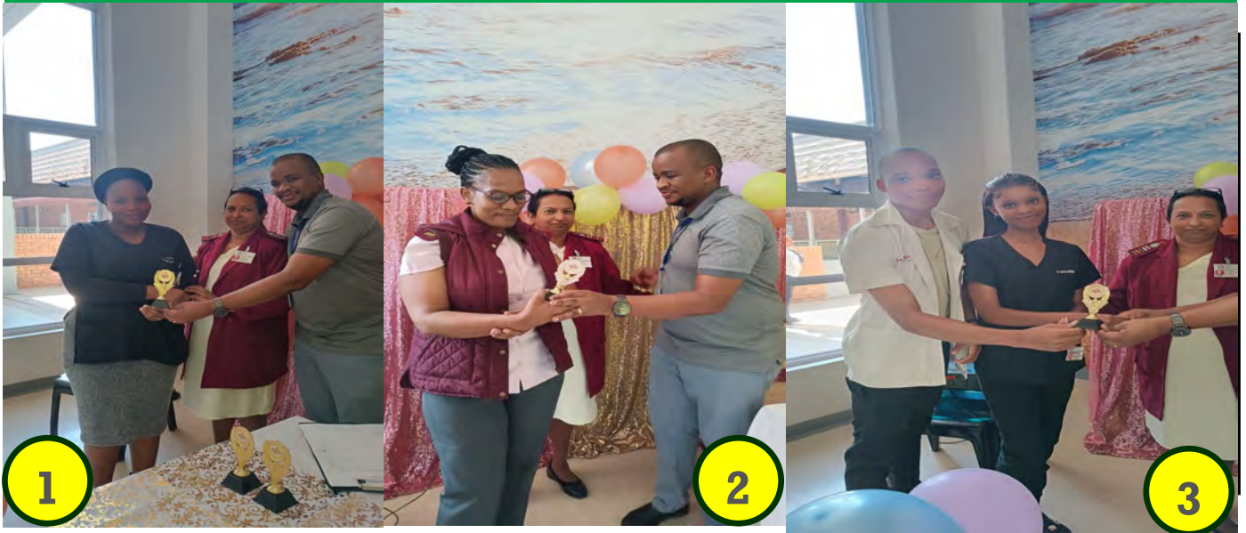
Picture 1: X-Ray dept receives a trophy from management. Picture2 Nursery ward receives a trophy from management. Picture 3 Pharmacy dept receives a trophy from management during World Hand Hygiene Day.