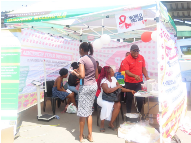
AIDS DAY - PATIENT VITALS