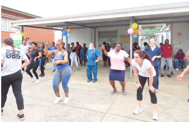
EXECISE 1 ST SESSION

The Physiotherapy Department extended their heartfelt thanks to the sponsors and the organizers of the event ( Metropolitan, South African Society of Physiotherapy, Cape Heat Exchange and the rest of the organising staff).