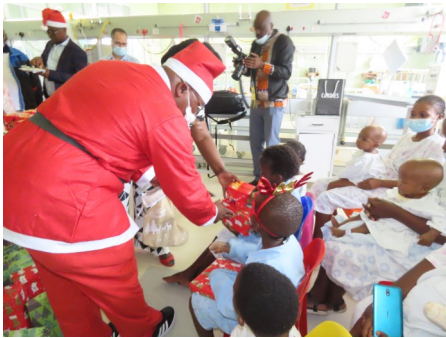
PHOTO GALLERY CHRISTMAS BABIES