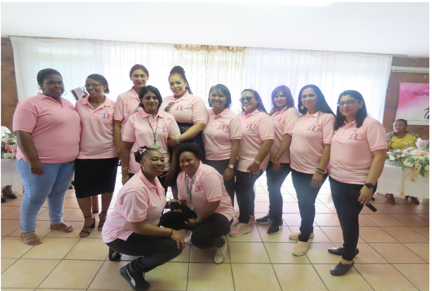
WOMEN'S FORUM COMMITTEE

Unveiling of a Banner, gift giveaways for incoming and outgoing members were the crucial part of the event. The event was complimented by a celebratory cake and closed off with lunch being served to all attendees.