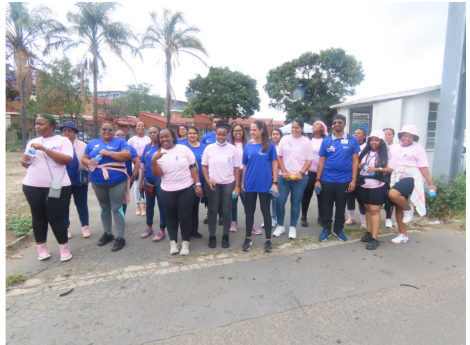
CANCER AWARENESS - FUN WALK START