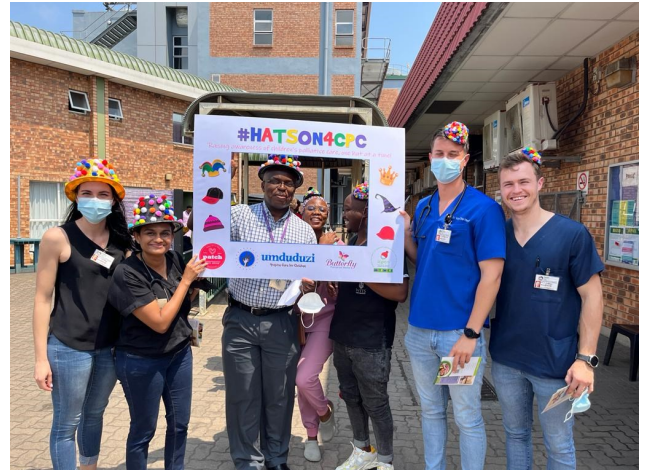
CP AWARENESS - SELFIE TIME!