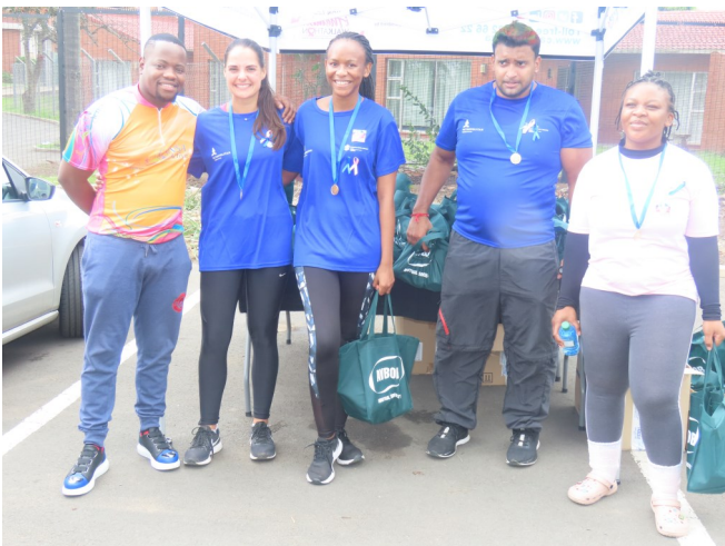
CANCER AWARENESS - FUN WALK WINNERS