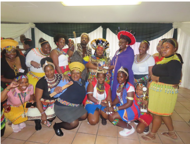
HERITAGE DAY - BEST CULTURAL GROUP