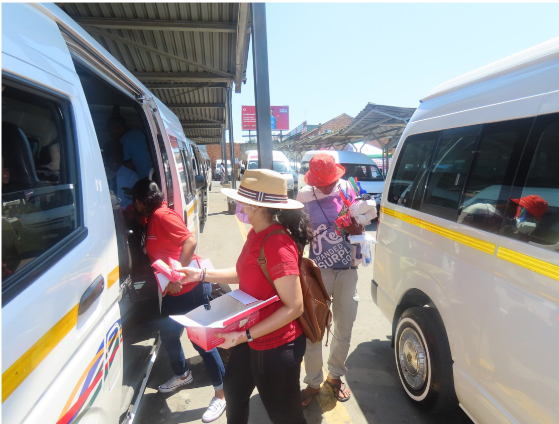
STAFF DISTRIBUTING CONDOMS

bu where the services were provided and distribution of condoms both male and female was on a very high rate with 12 900 condoms distributed on the day. 217 people screened for TB and 28 tested for HIV.