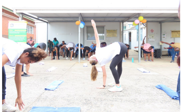
EXECISE 2 ND SESSION