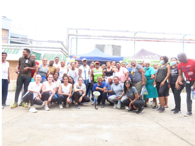
FITNESS DAY - STAFF & FITNESS TRAINERS