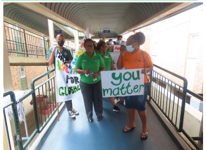
MENTAL HEALTH AWARENESS - MARCH