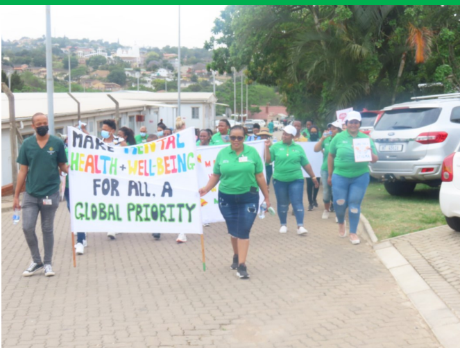
MENTAL HEALTH AWARENESS - MARCH