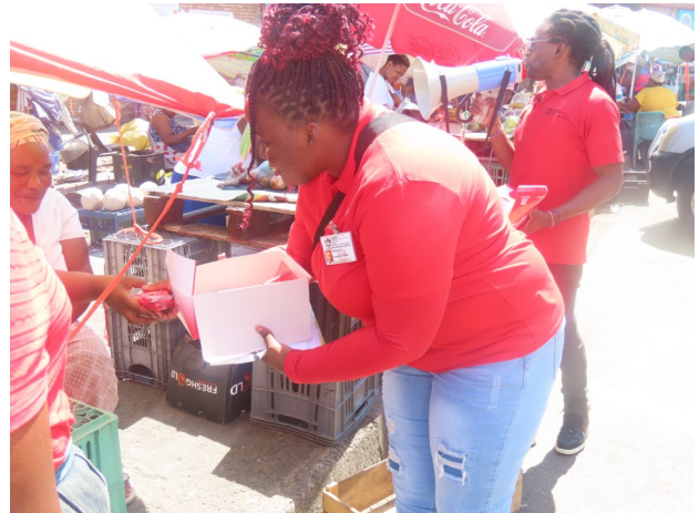
AIDS DAY - CONDOM DISTRIBUTION