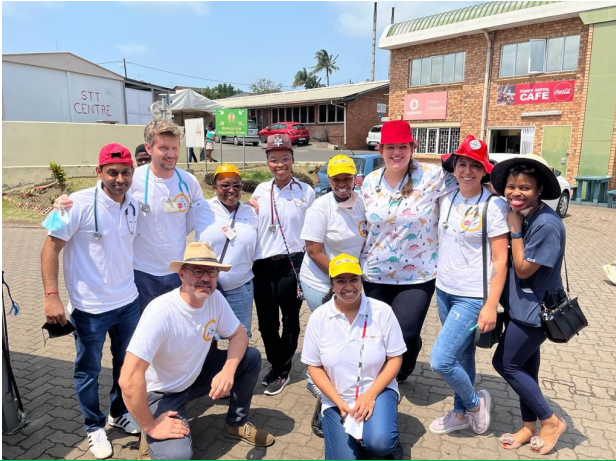
CP AWARES - STAFF