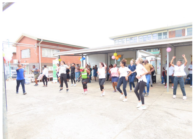
FITNESS DAY - EXERCISE SESSION