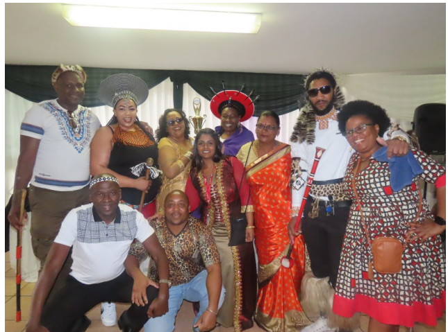
HERITAGE DAY - BEST TABLE DISPLAY