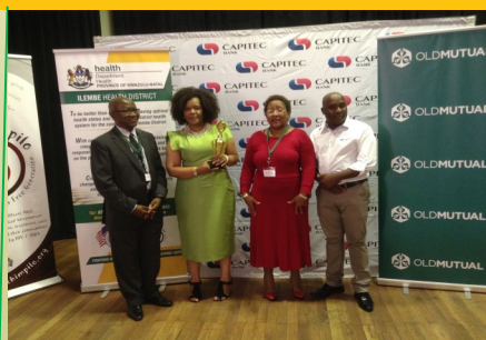
Stanger Hospital gets an award for NCS's best hospital READ MORE ON PAGE 3