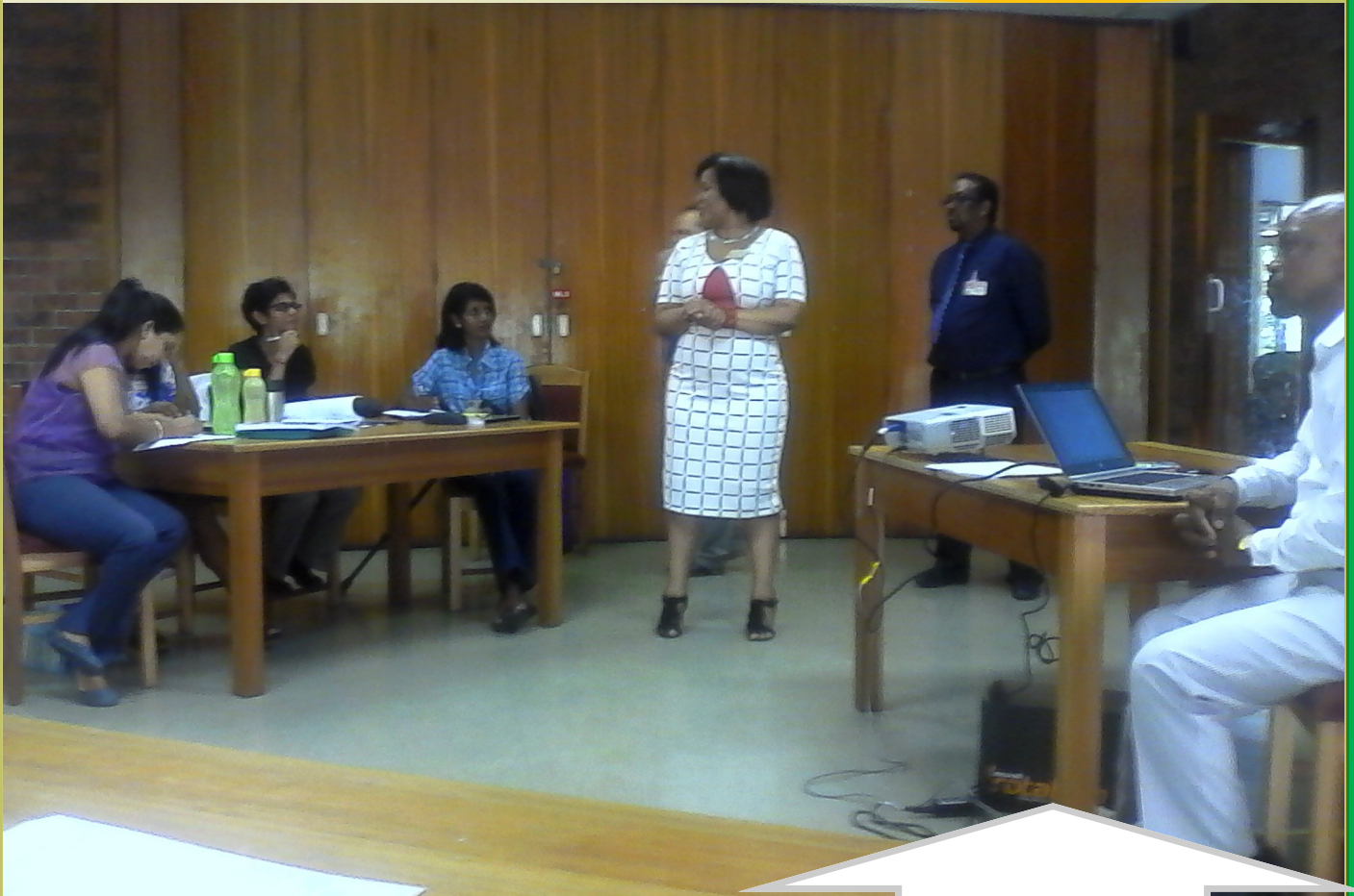
Stanger Hospital CEO welcoming staff on first session

Stanger Hospital has embarked on a journey of training all staff on customer care the batho-pele way workshop. These workshops are done at Stanger Hospital. The trainings started from the beginning of the year. Each session accommodate +-25 employees. All participants are expected to attend the workshop full time for 3 days. The trainings are conducted by KZN public service training academy.