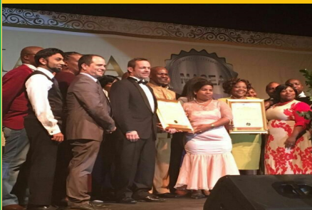
MASEA for Stanger Hospital READ MORE ON PAGE 2