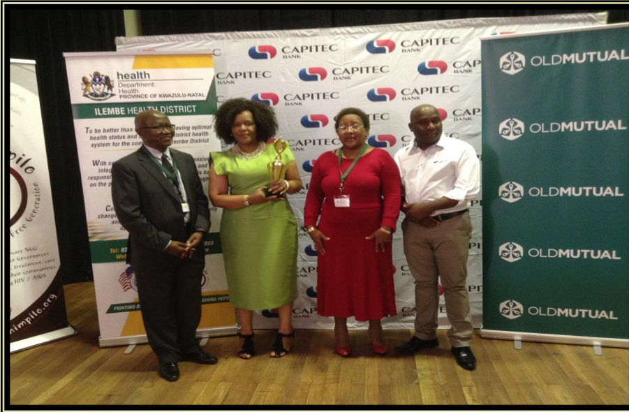
Stanger hospital CEO receiving an award for NCS 's best hospital.