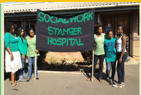
Child protection week campaign READ MORE ON PAGE 3