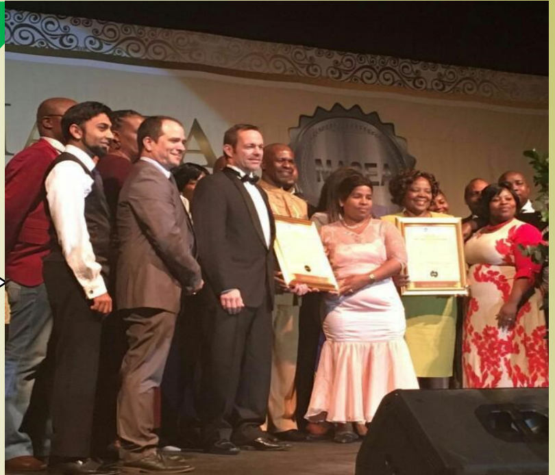
Stanger hospital staff receiving an award for best play area

Stanger Hospital received an award for the best play area for kids (MASEA 2016).