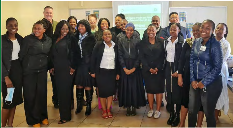
The Outreach team with the LifeLine attendees