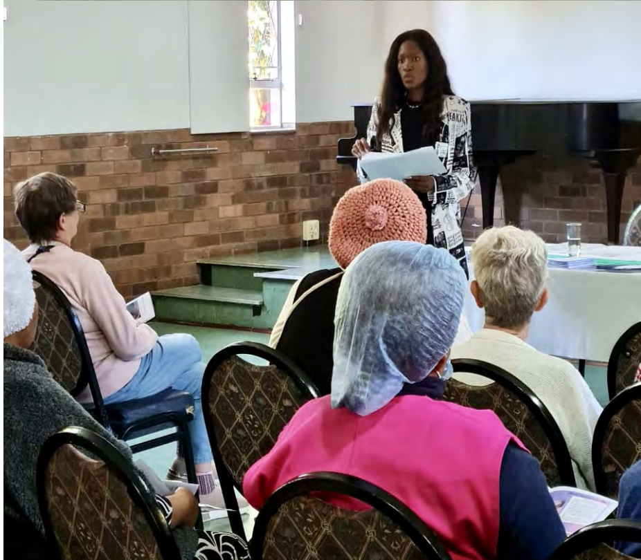
Above Pictures from Left: PADCA & Grey's Hospital Staff Members and Alzheimer display at OPD