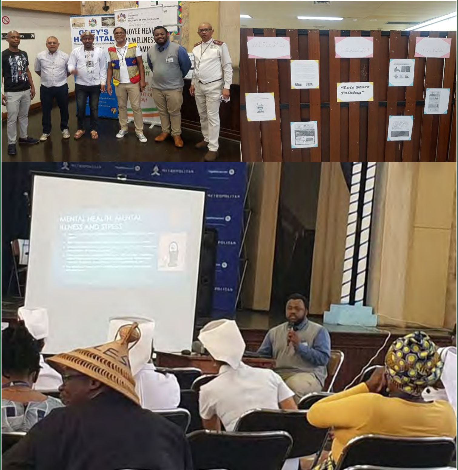
Top left picture to right: members of the men's forum and the display screen placed at OPD

A display was created and set up in the outpatient area to honour men's health month and to conveying information about men's mental health.