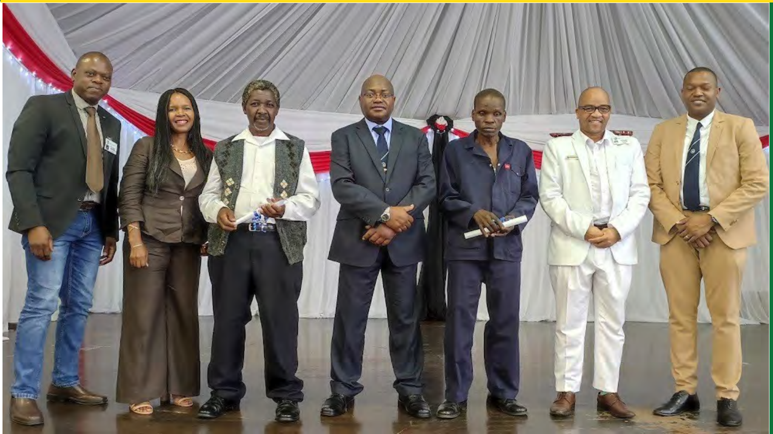
EXCO with the two staff members who have been on service for 40 years