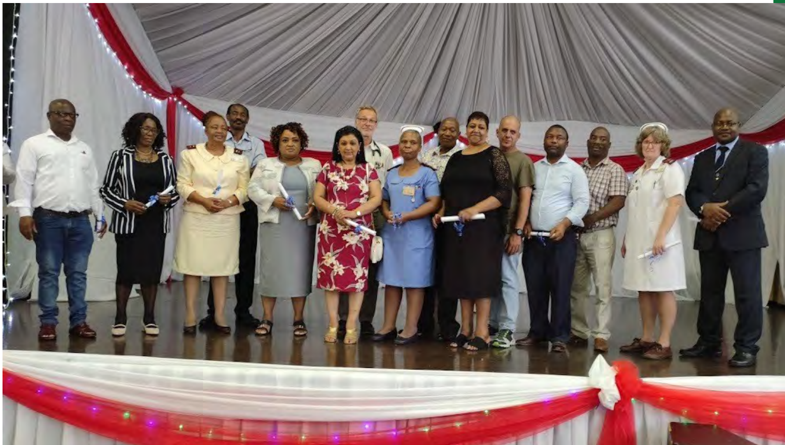
The above staff members have been on service for 30 years