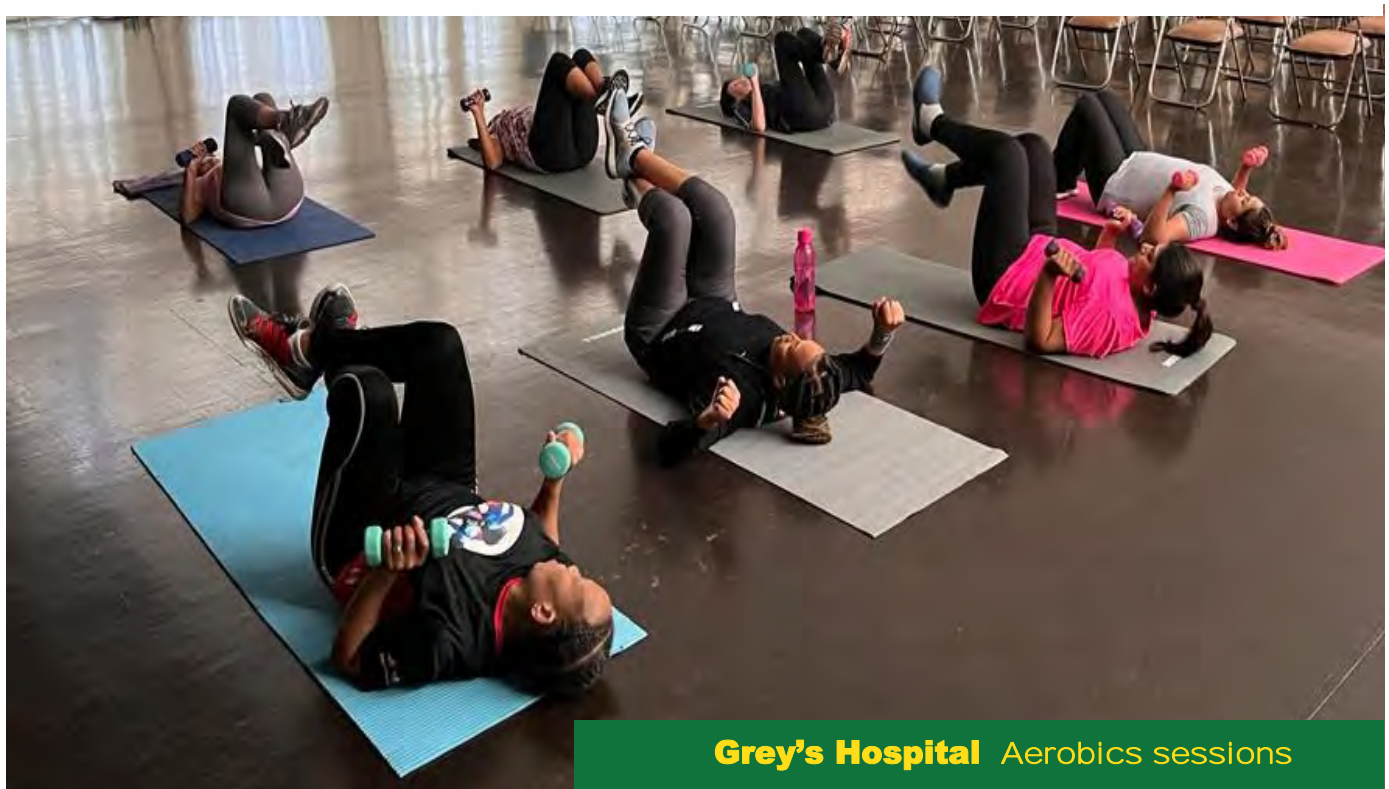
Grey's Hospital Aerobics sessions