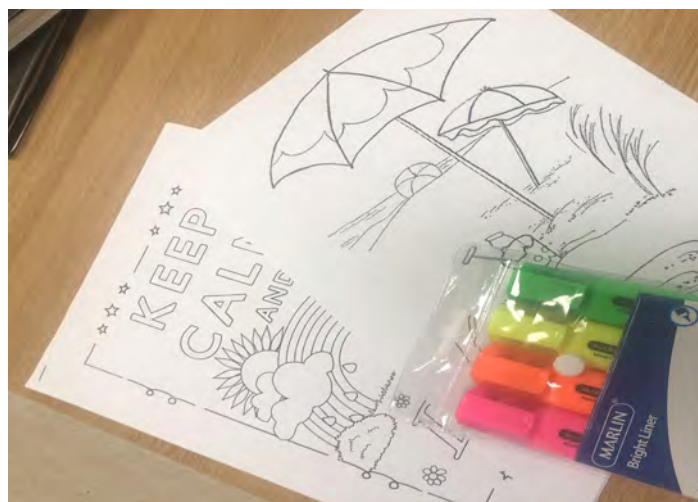
Colouring and drawing material handed out to children