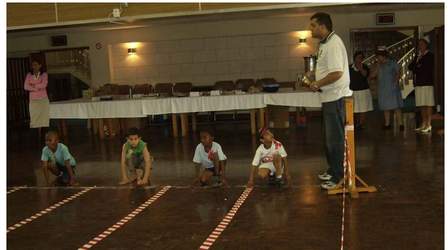
Ready, Steady, GO!