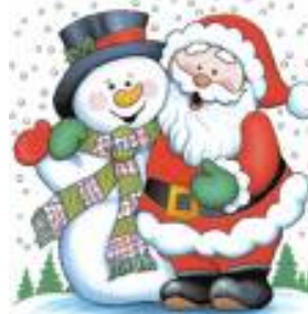
Christmas joy warms the heart

Everyone who contributed and participated in the event is thanked for making the event successful. It is hoped that all participants will proactively maintain healthy lifestyles and will not take their health needs for granted.