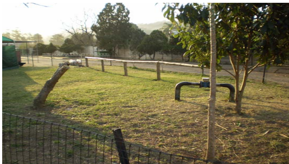
The play ground where Ruth plans to build the jungle gym.