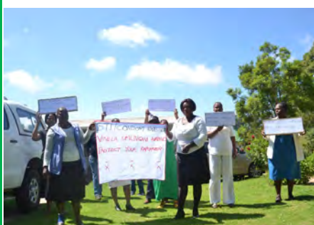
STI & CONDOM AWARENESS