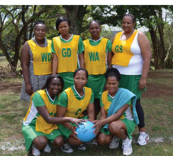
District Office Netball Team came 1st place