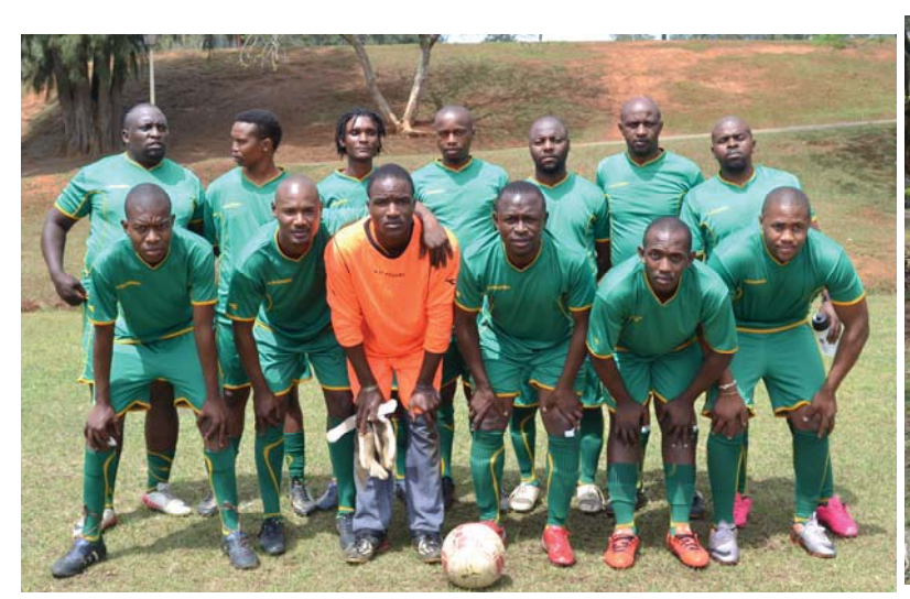
District Office Football Team came 2nd place