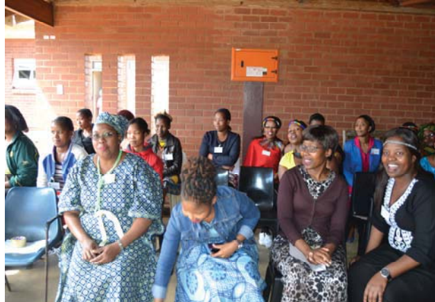
Employees from different departments enjoyed our heritage day programme