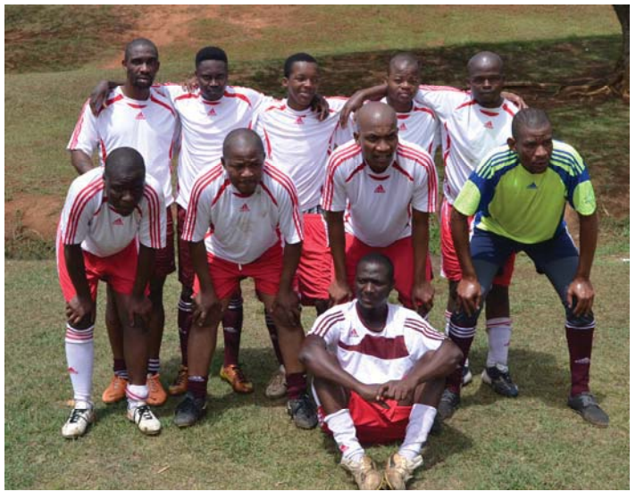
GTN Football Team came 3rd