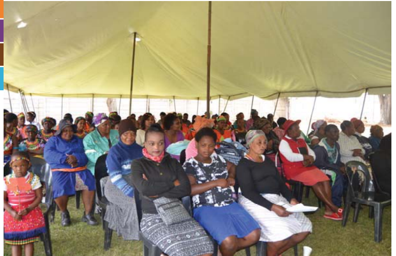
Audience listening attentively to speech

On the 23 September 2015 Pine Street Clinic hosted an open day. The purpose of the open day was to make the community aware of the services rendered at the clinic and further provide a platform for the community to ask questions. The event started with health promotion and viewing of stalls where health services rendered were displayed.