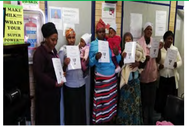
The mothers were awarded certificate of excellence for choosing to breastfeed.