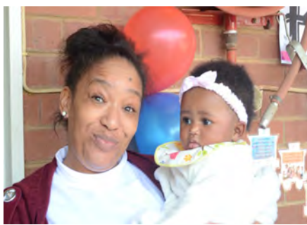
Breastfeeding week 2018