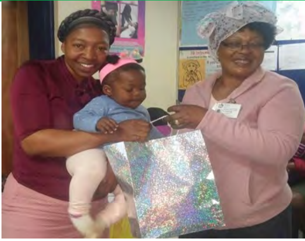
First price handed to the winner