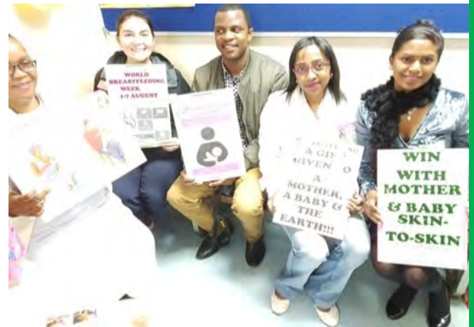
The Nutrition and Dietetics Team