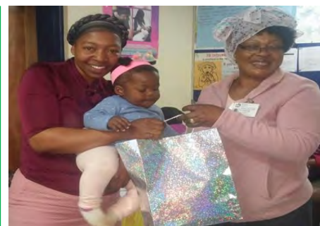
Breastfeeding week 2018

FIGHTING DISEASE, FIGHTING POVERTY, GIVING HOPE