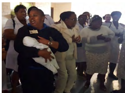
Breastfeeding week 2018