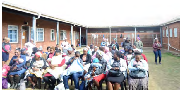
Gateway Clinic Attendee