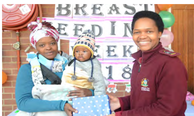
First price handed to the winner