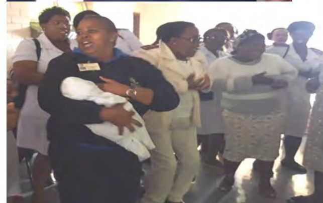
The cleaning hostess joined the awareness The Maternity staff entertained the mothers