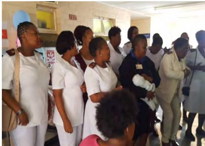
Maternity Staff singing "Celisa Mama" song