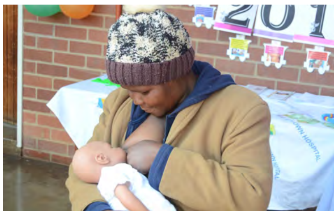
Participant demonstrating on how to breastfeed correctly