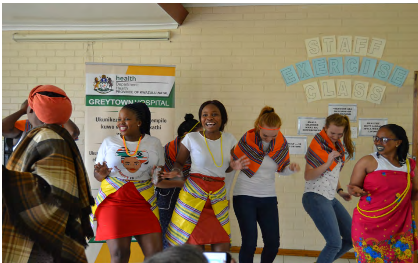
The Pedi culture - What a WoW!