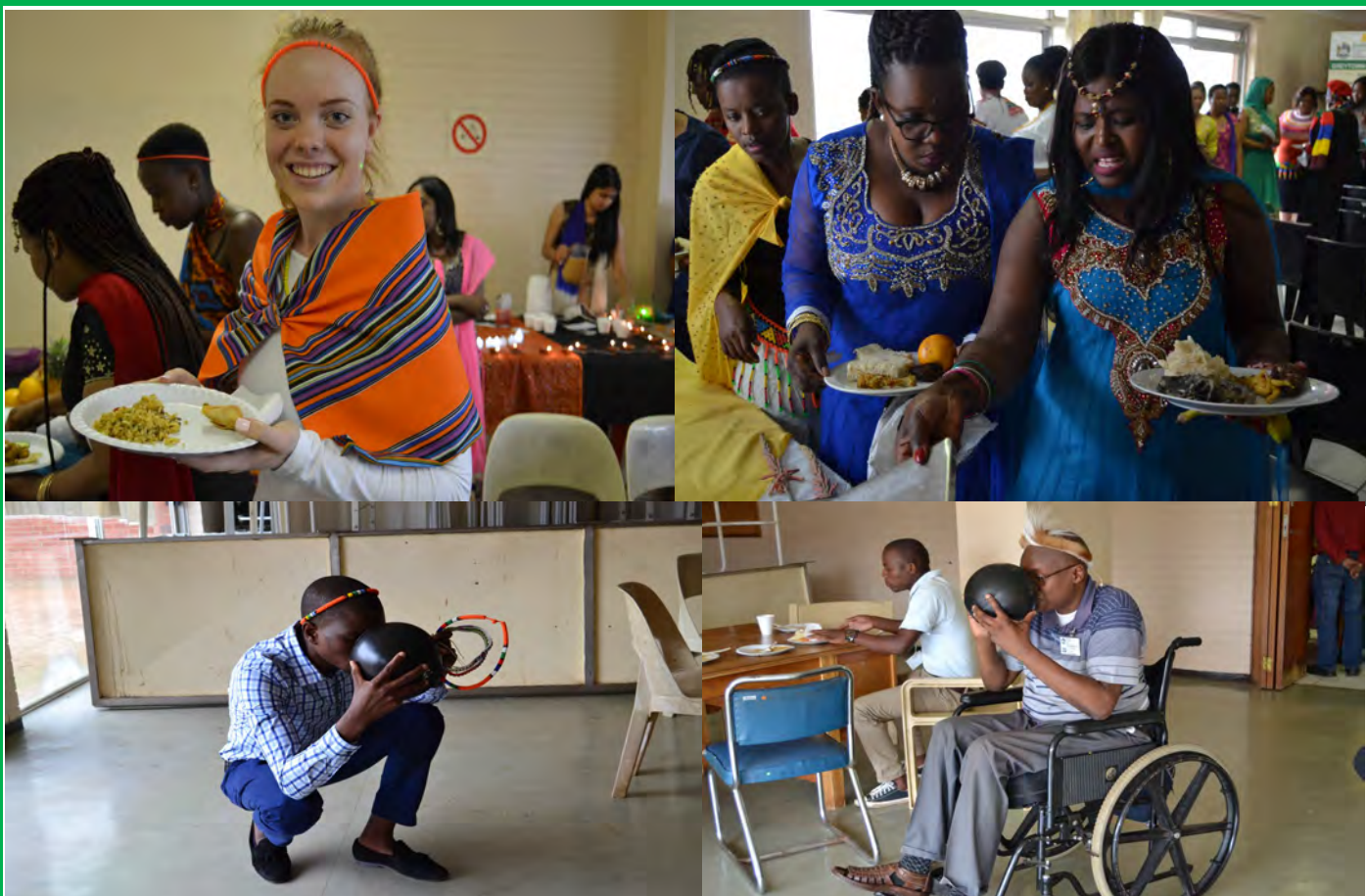
Cultural cuisine enjoyed by all