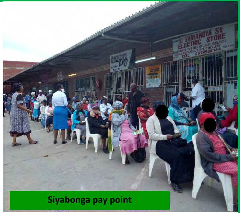
Siyabonga pay point