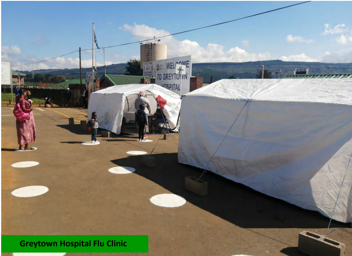
Greytown Hospital Flu Clinic