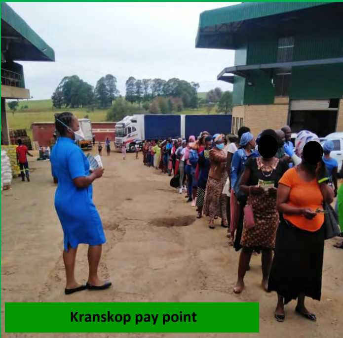
Kranskop pay point