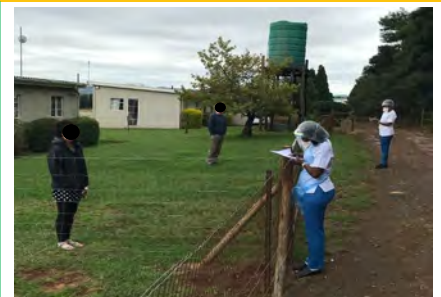
DOOR TO DOOR VISITS