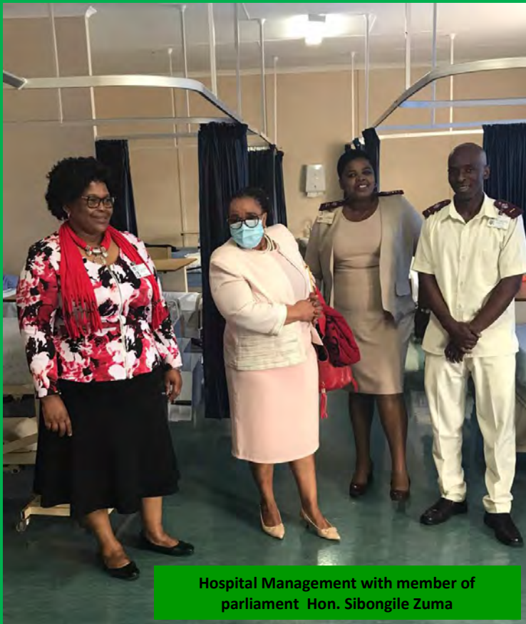
Hospital Management with member of parliament Hon. Sibongile Zuma