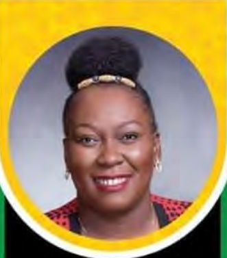
MS NOMAGUGU SIMELANE-ZULU MEC FOR HEALTH

Department: Health PROVINCE OF KWAZULU-NATAL