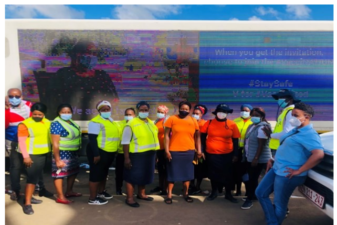
The Umvoti Community Health Care Workers