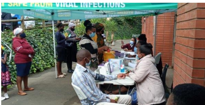
Health Services brought to the people at Mavundla Mall