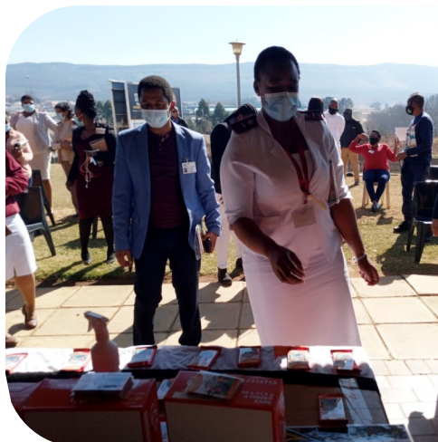
Mondi forest together with LETCEE appreciated staff with Kitkat chocolate bar