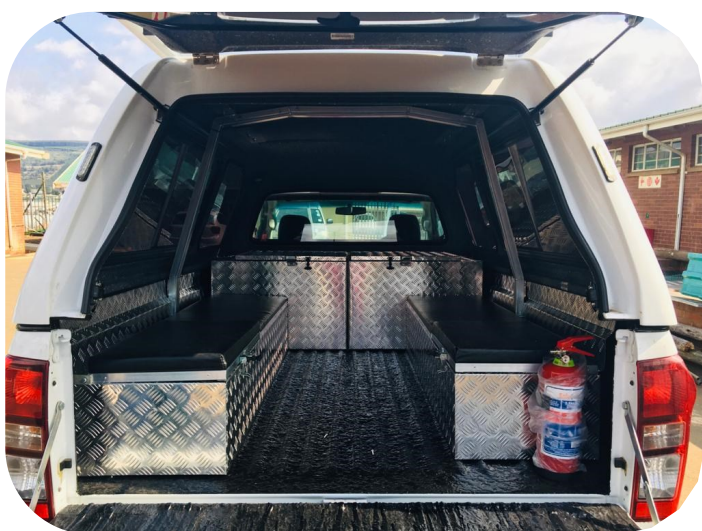
The Maintenance vehicle