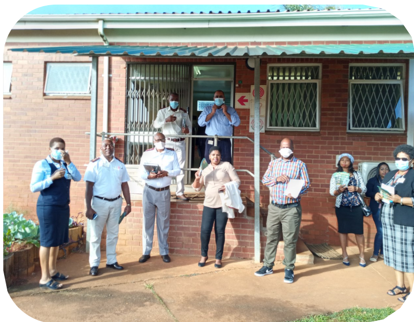
Management about to hit the streets of Greytown CBD creating awareness on COVID-19