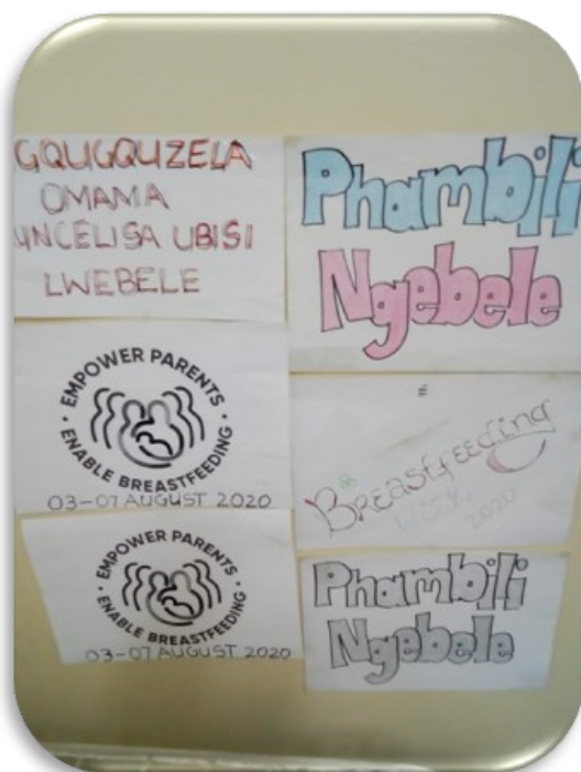
Posters promoting breast milk