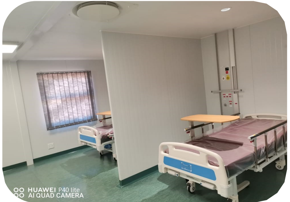
COVID-19 WARD - Isolation

This is service delivery at its best. The new COVID-19 ward comprises of 14 COVID-19 beds.