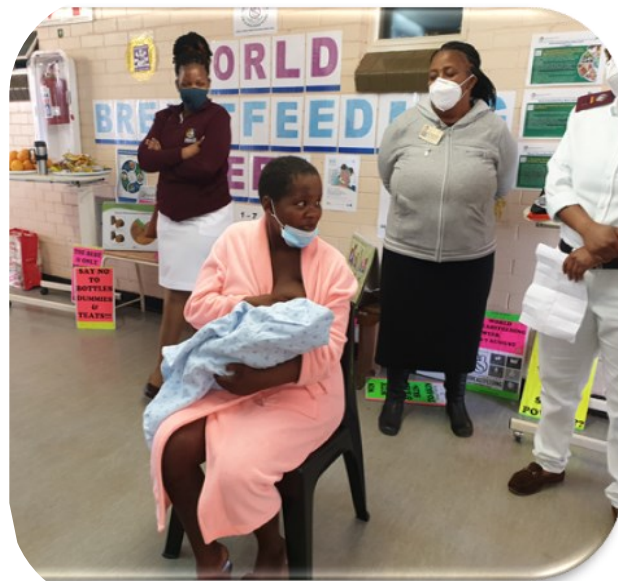
Mother demonstrating proper breastfeeding technique