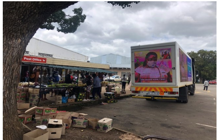
UNICEF Truck at Umvoti Post Office