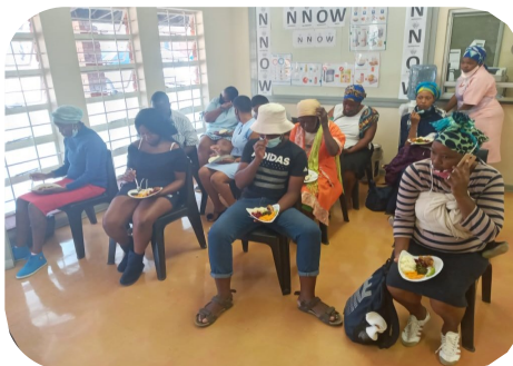
Sibuyane Clinic clients served with nutritious meal

encouraging them to eat more fruits and vegetables.