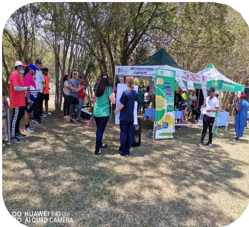
PHOTO GALLERY WELLNESS DAY 2021