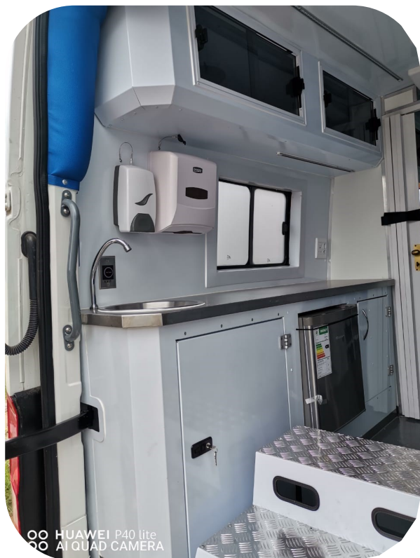
The mobile vehicle