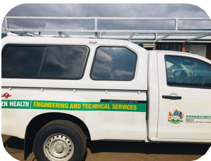
The Maintenance vehicle