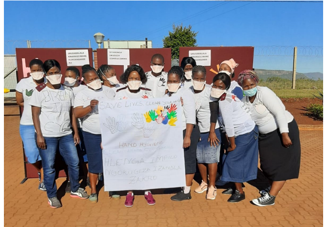
The KwaSenge Clinic staff