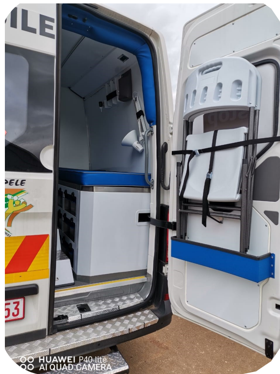
The mobile vehicle