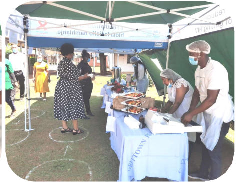
The Nutrition Team serving clients