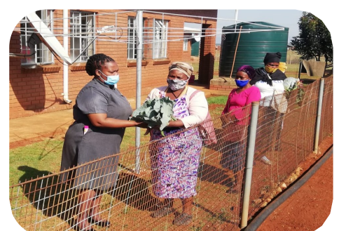
KwaSenge Clinic vegetable garden

Nutrition assessment were conducted to staff member and BMI calculated, 11 staff members were assessed at Sibuyane clinic. 72.2% of the staff assessed were obese, and only 18.25 had Normal BMI.