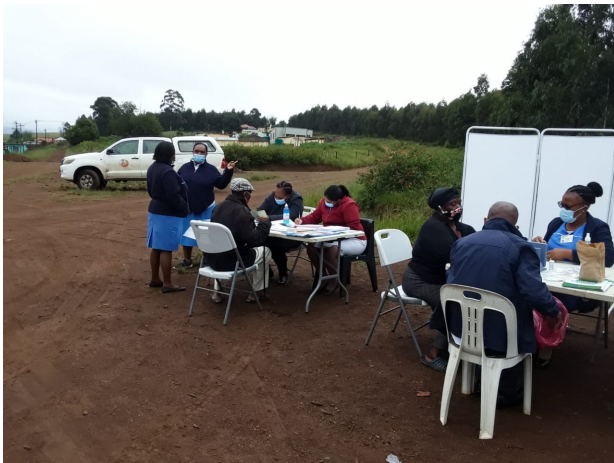
Wolneka & Tin town Area