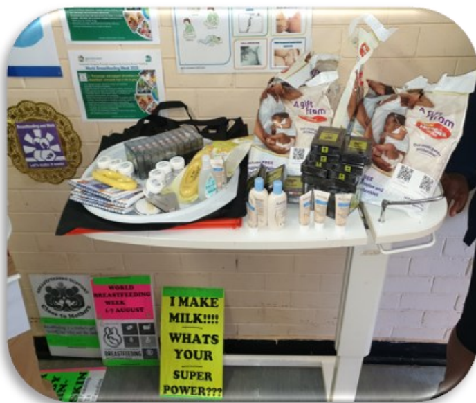
Gift packs for moms