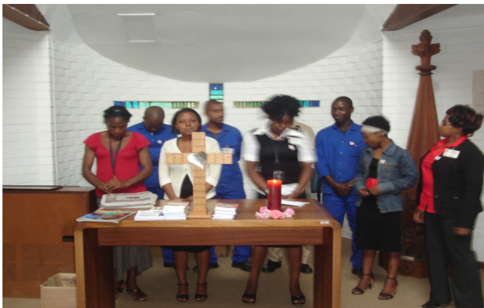
Hospital choir on AIDS day I joyous yakusasa