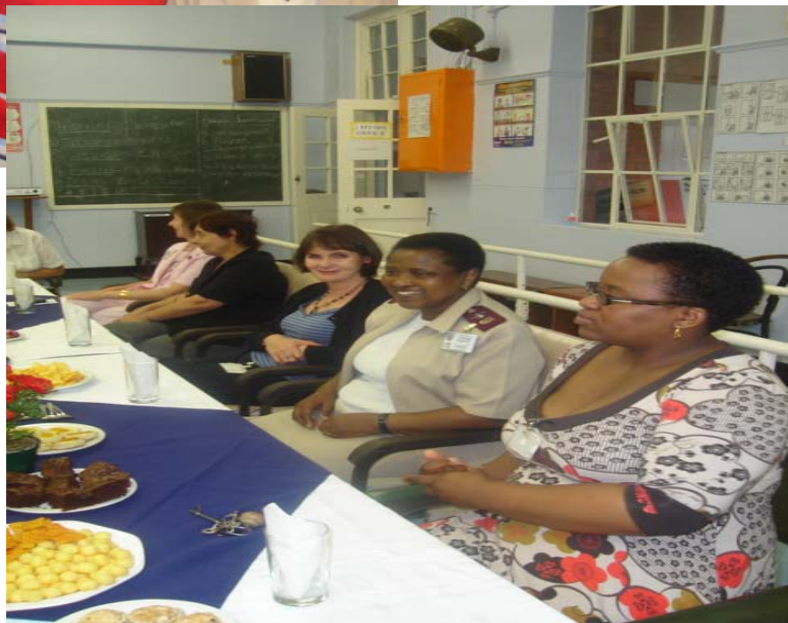
Some of the guest at the party