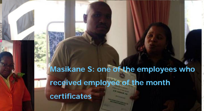
Masikane S: one of the employees who received employee of the month certificates