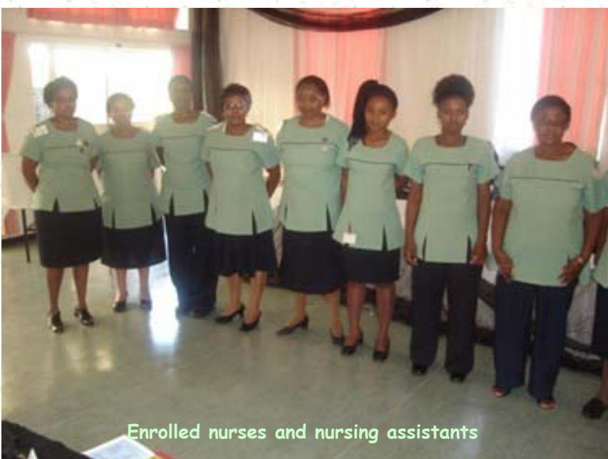
Enrolled nurses and nursing assistants

Bahle badelile abahlengikazi base Hillcrest nawe uyazibonela amapetshisi