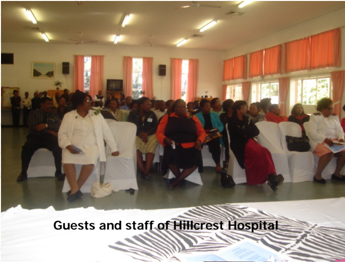
Guests and staff of Hillcrest Hospital